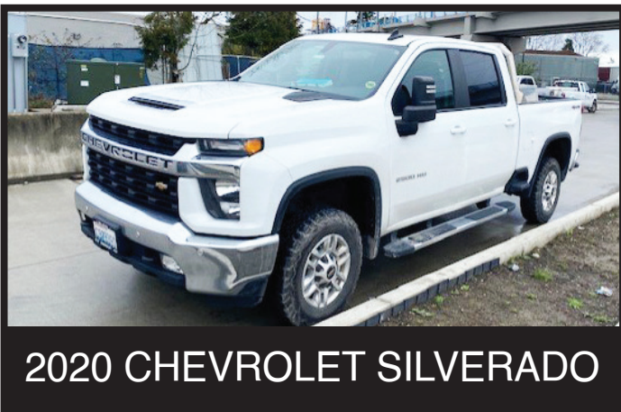
2020 CHEVROLET SILVERADO