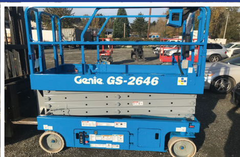
GENIE GS2646 26'