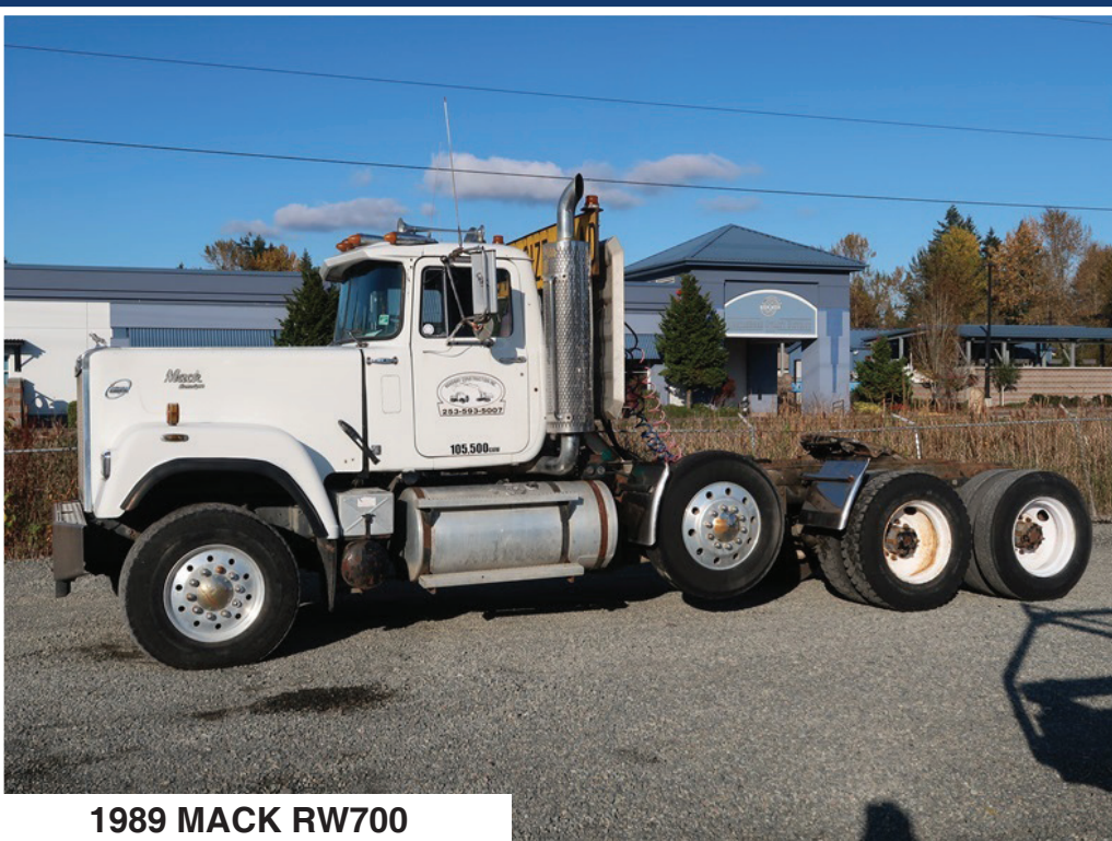
1989 MACK RW700