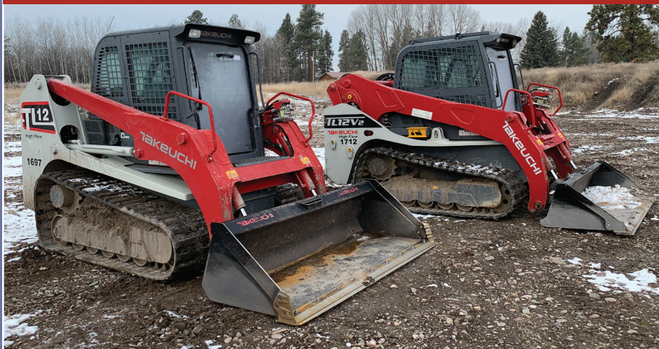
2016 TAKEUCHI TL12R 2016 TAKEUCHI TL12V2