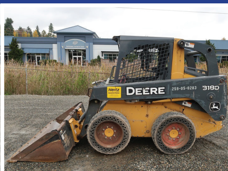
2011 JOHN DEERE 318D