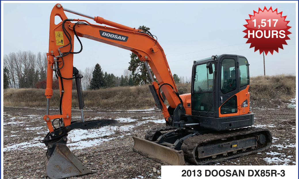
2013 DOOSAN DX85R-3