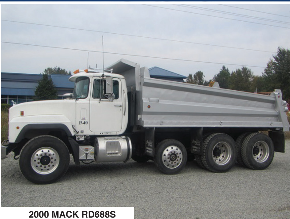
2000 MACK RD688S