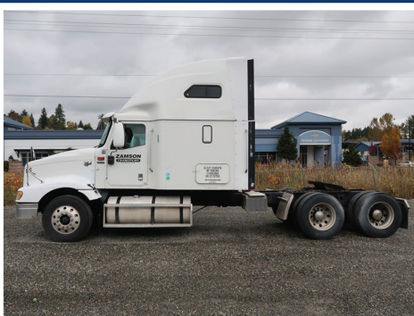
2001 INT'L 9400