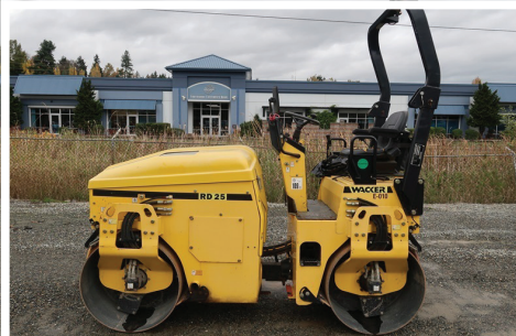
2003 WACKER RD25