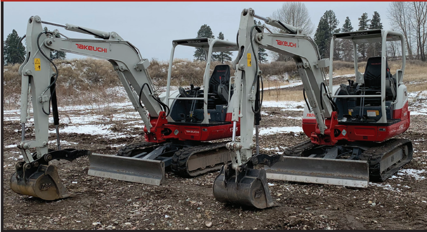
(2 OF 3) 2017 TAKEUCHI TB240'S