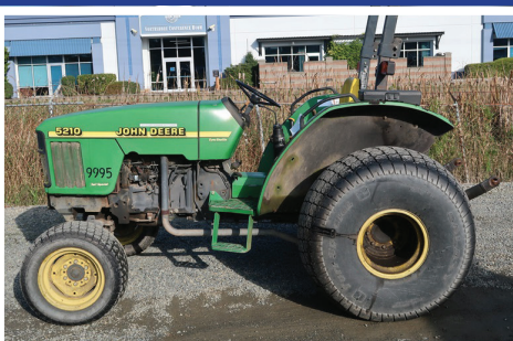
2001 JOHN DEERE 5210