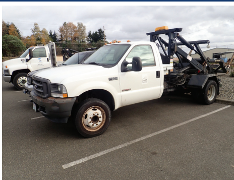
2003 FORD F550