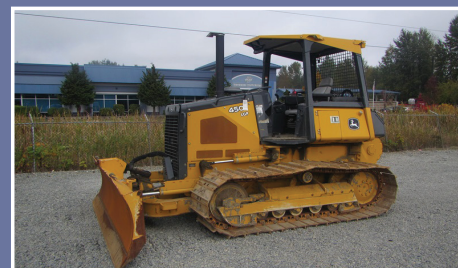
2013 JOHN DEERE 450J LGP