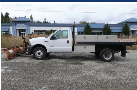
2003 FORD F450