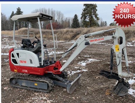
2017 TAKEUCHI TB216R