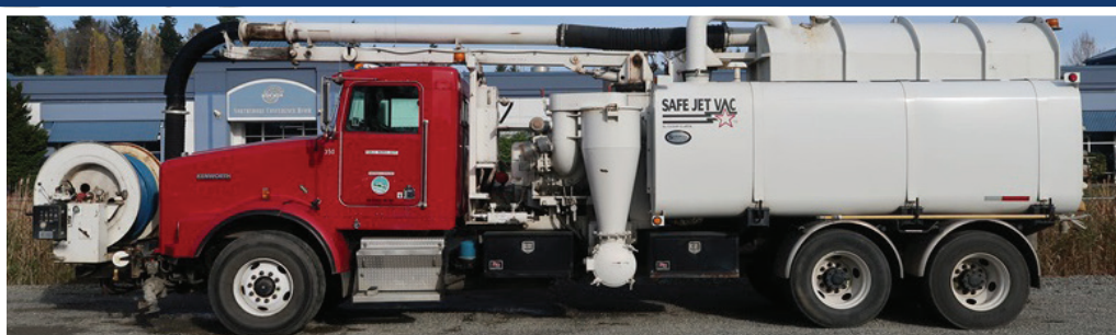
2002 KENWORTH T800

1.800.426.3008 - 425.486.1246 - MURPHYAUCTION.COM