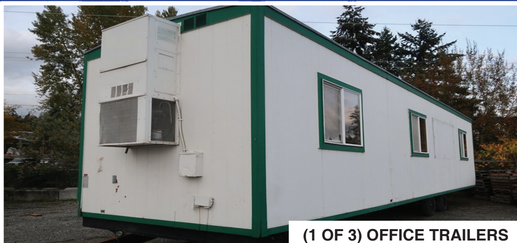
(1 OF 3) OFFICE TRAILERS