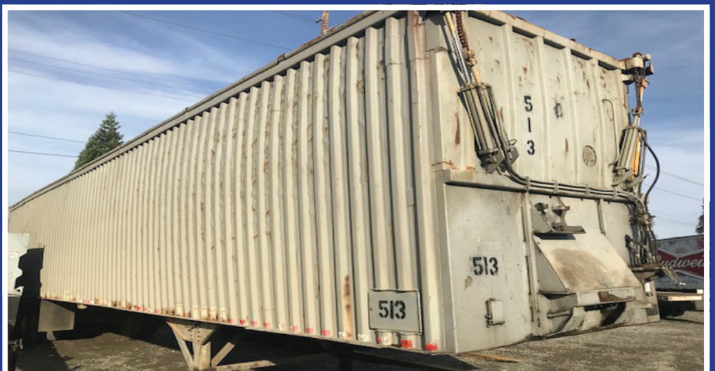
1998 ALLOY ATSLT-49.5-3

1.800.426.3008 - 425.486.1246 - murphyauction.com