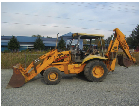
1996 JCB 214 SERIES 2 4X4