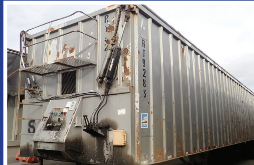
(1 OF 3) RELIANCE