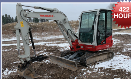
2016 TAKEUCHI TB240