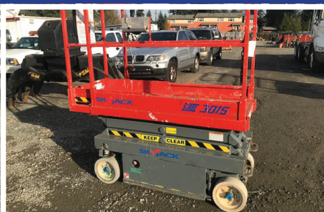
SKYJACK SJ3015 15'