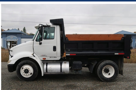
2005 INT'L 8600