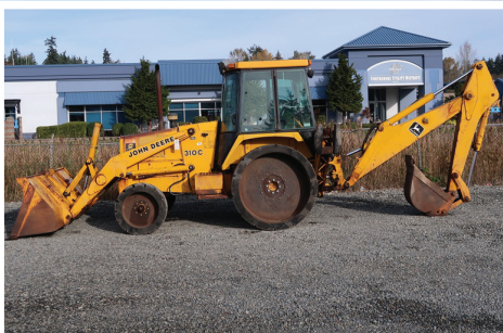
1990 JOHN DEERE 310C