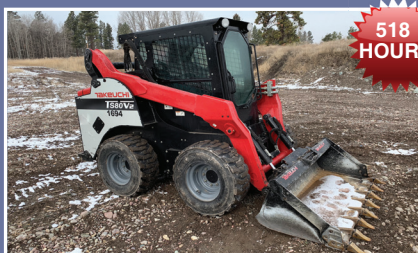
2016 TAKEUCHI TS80V-2