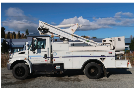
2009 INT'L 4300