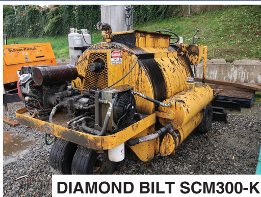
DIAMOND BILT SCM300-K