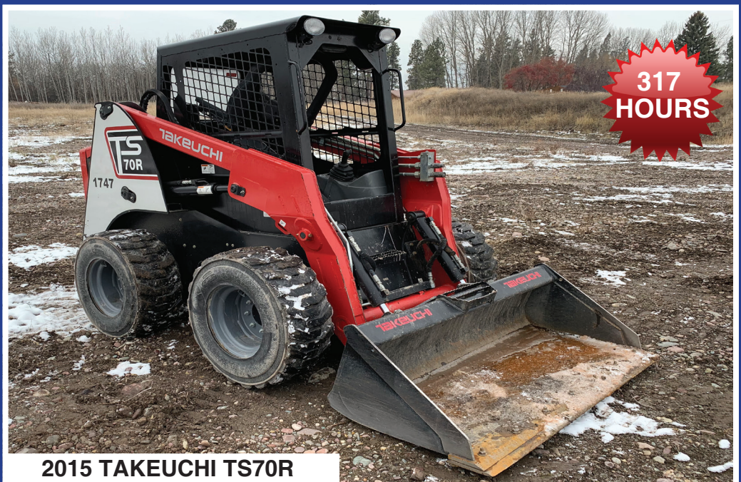
2015 TAKEUCHI TS70R