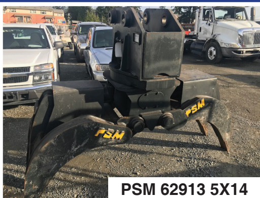
PSM 62913 5X14