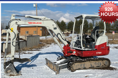
2016 TAKEUCHI TB240