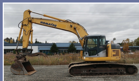
2007 KOMATSU PC228USLC-3