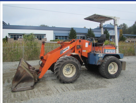
1996 KUBOTA R510 4WD