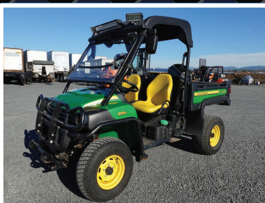
2016 JOHN DEERE 855D