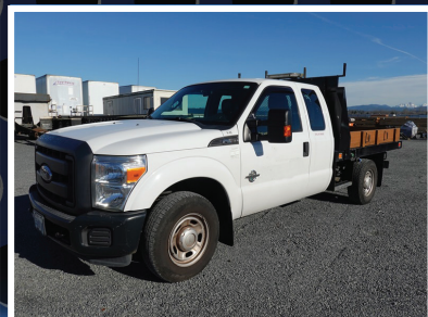
2013 FORD F250