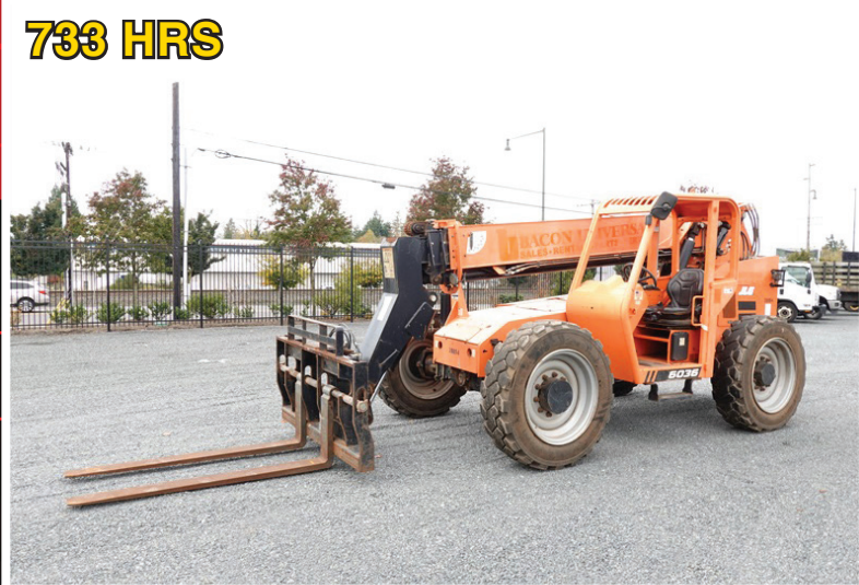
2019 JLG SKYTRAK 6036