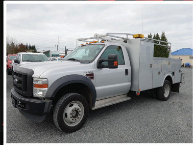
2009 FORD F550