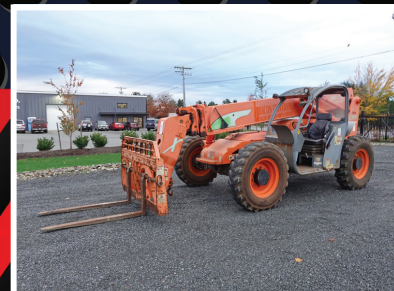
2016 XTREME XR0842

1.800.426.3008 - 425.486.1246 - murphyauction.com