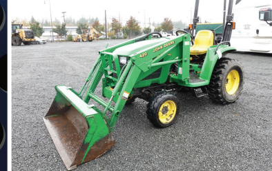
2001 JOHN DEERE 4200