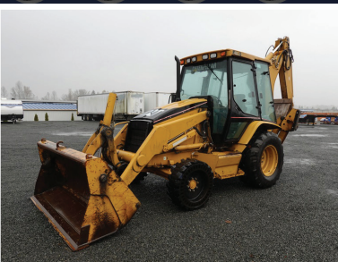
2004 CAT 430D