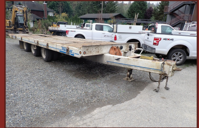
2014 TRAILMAX TRD-54-T