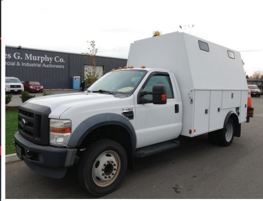
2009 FORD F450