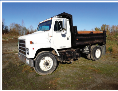
1984 INTERNATIONAL S1900