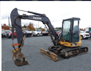
2016 JOHN DEERE 50G