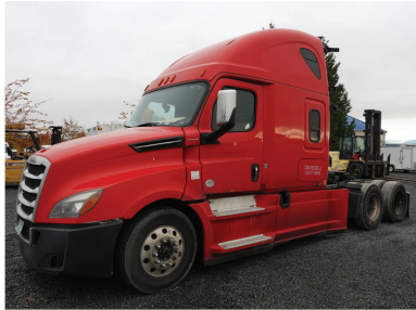
2018 FREIGHTLINER CASCADIA