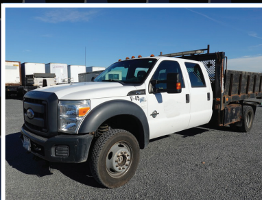
2013 FORD F450