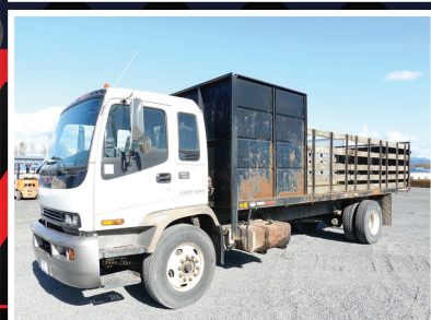
2009 GMC T7500