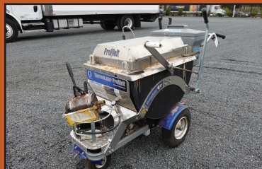
GRACO THERMO LAZER PROMELT

Go To Murphyauction.com For More Information