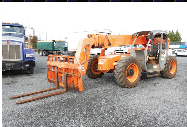
2018 XTREME XR1147