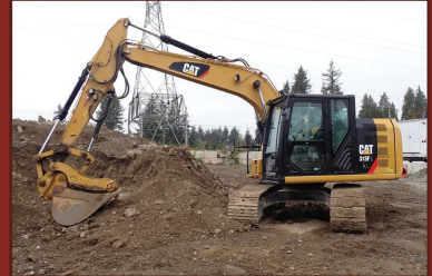
2019 CAT 313FL