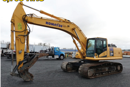
2012 KOMATSU PC360LC-10