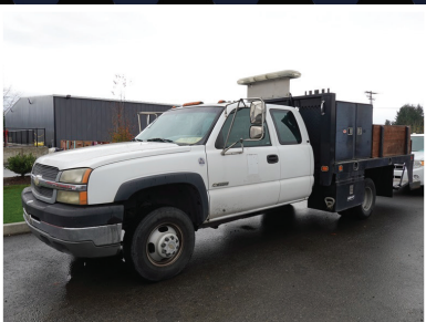
2004 CHEV 3500