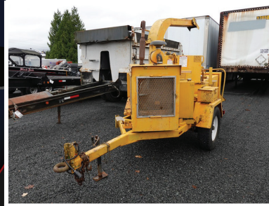
BRUSH BANDIT 100