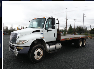
2012 INTERNATIONAL 4400