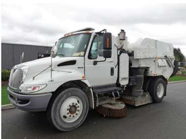
2014 INTERNATIONAL 4300