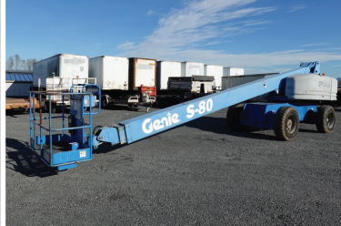
2000 GENIE S-80