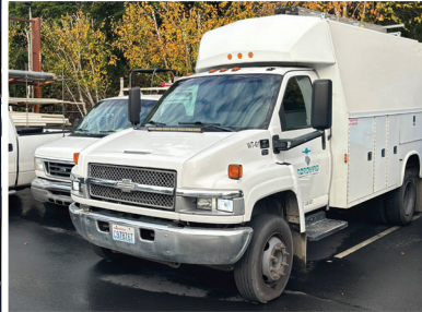
2004 CHEVY C4500