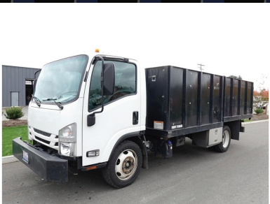
2017 CHEV 5500 HD