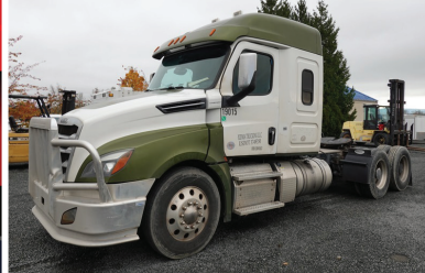
2019 FREIGHTLINER CASCADIA