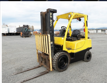
2006 HYSTER H50FT