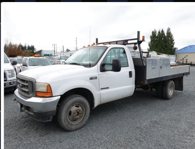
2001 FORD F350