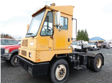
2009 KALMAR 4X2