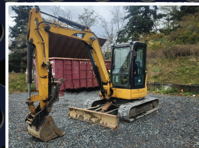
2006 CAT 305C CR