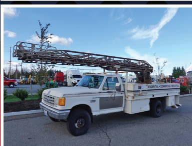
1990 FORD F450