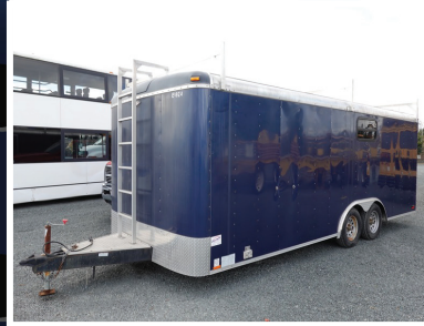
2009 CARGO MATE