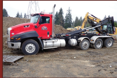
2012 CAT CT660S