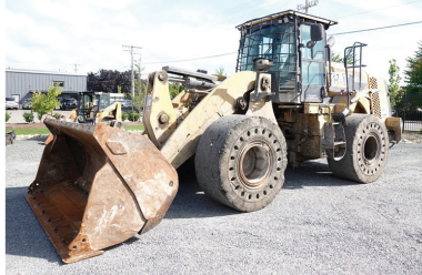
2013 CAT 950K