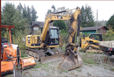
2016 CAT 307E2