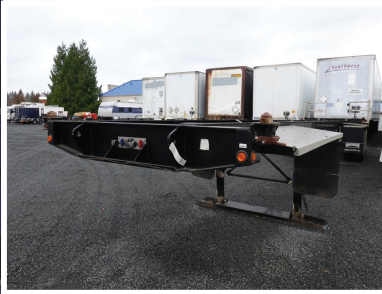
2019 MAGNUM 2STC-40