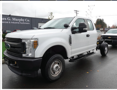
2018 FORD F250