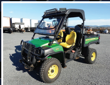
2013 JOHN DEERE 855D