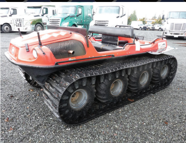
2007 ARGO AVENGER