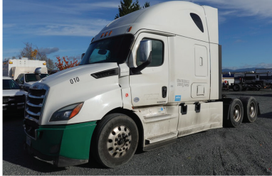
2019 FREIGHTLINER CASCADIA