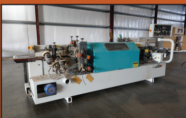
HOLZHER 1438 EDGE BANDER