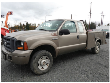
2005 FORD F250