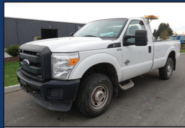
2015 FORD F250

Go To Murphyauction.com For More Information