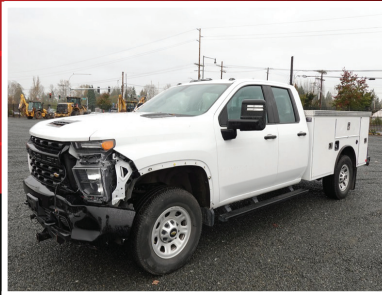
2020 CHEV 3500