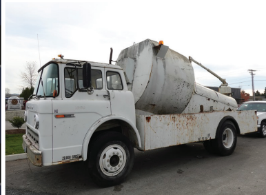
1976 FORD RODDER