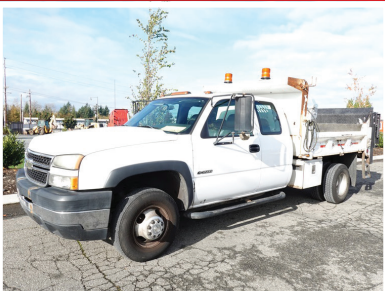
2006 CHEV 3500