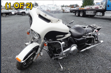
2015 HARLEY FLHP ROAD KING