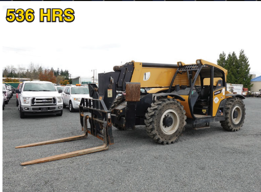
2021 SANY STH1056A