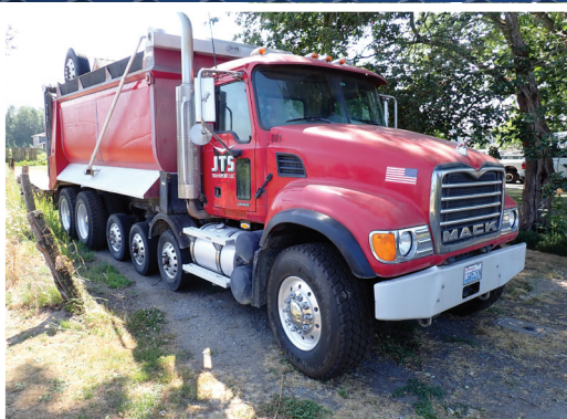
2007 MACK CV713 SUPER SOLO