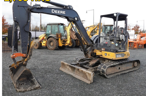
2018 JOHN DEERE 50G