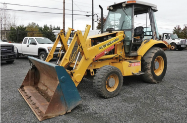
2007 NEW HOLLAND U80 4X4