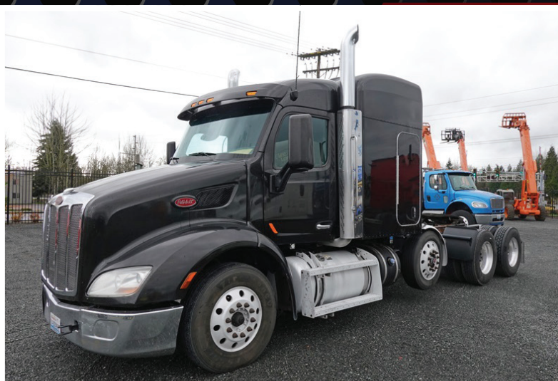
2017 PETERBILT 579

1.800.426.3008 - 425.486.1246 - murphyauction.com