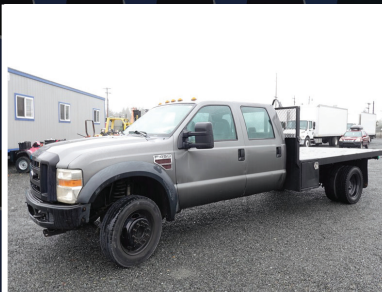
2009 FORD F450