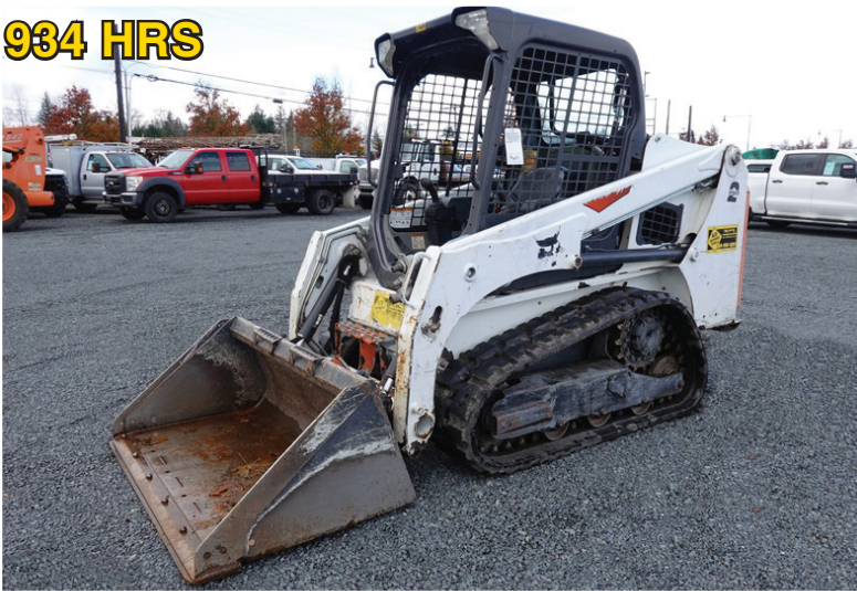
2018 BOBCAT T450