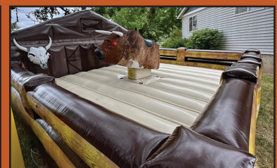
GALAXY CLASSIC BULL