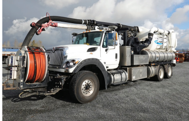
2016 INTERNATIONAL 7600