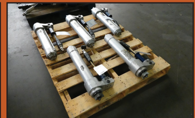
HURST JAWS OF LIFE R 424