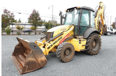
2016 NEW HOLLAND B95C 4X4