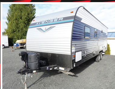
2022 FOREST RIVER AVENGER 268K