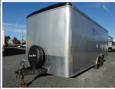
2020 FOREST RIVER