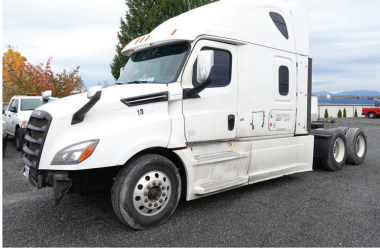
2019 FREIGHTLINER CASCADIA