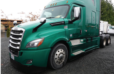
2019 FREIGHTLINER CASCADIA