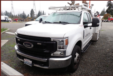
2020 FORD F350 XL