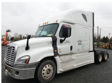
2015 FREIGHTLINER CASCADIA