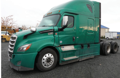
2019 FREIGHTLINER CASCADIA