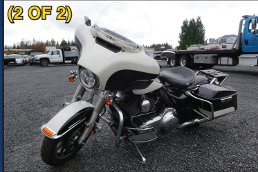
2015 HARLEY FLHP ROAD KING