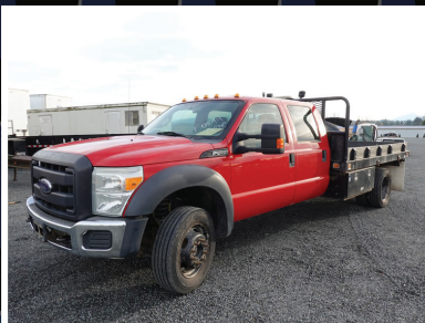
2014 FORD F450