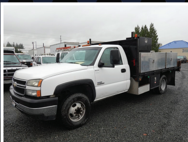
2007 CHEV 3500