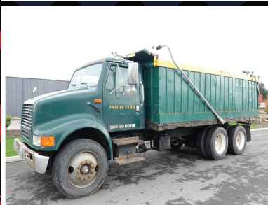
1993 INTERNATIONAL 8000