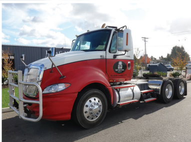
2011 INTERNATIONAL PROSTAR