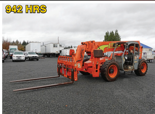
2018 XTREME XR1055