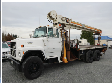
1989 FORD L8000