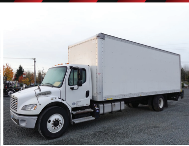
2016 FREIGHTLINER M2