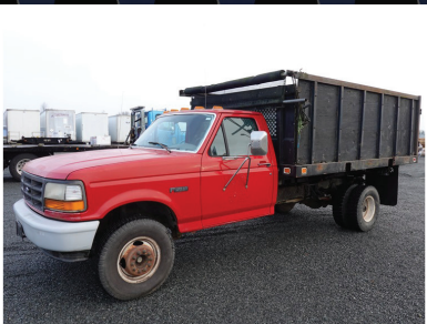
1996 FORD F450