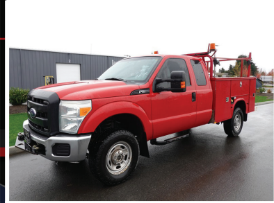
2015 FORD F250