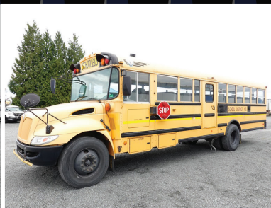
2010 IC PB10500