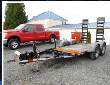
2019 SNAKE RIVER