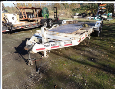
2017 TRAIL KING TKT12U