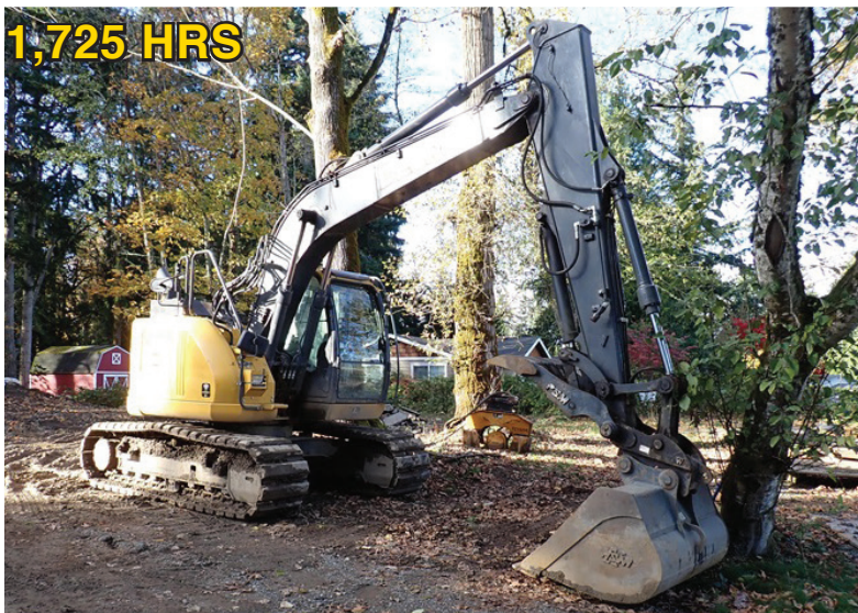
2019 JOHN DEERE 135G