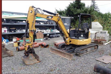
2017 CAT 304E2CR