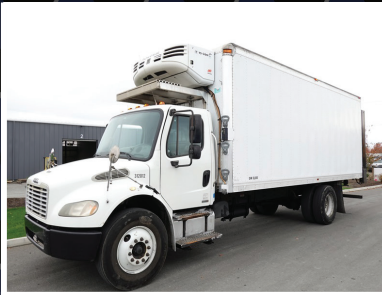
2005 FREIGHTLINER M2