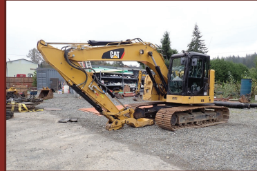
2019 CAT 315FLCR