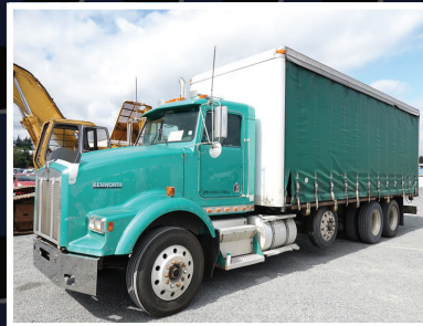
1990 KENWORTH T800