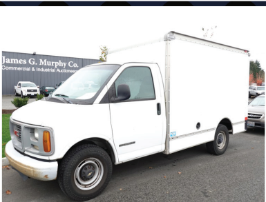
2000 GMC 2500