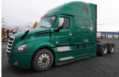
2019 FREIGHTLINER CASCADIA