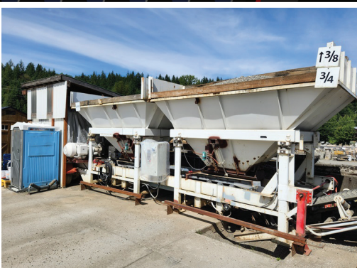
CONCRETE BATCH PLANT