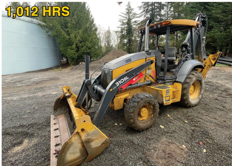
2019 JOHN DEERE 310SL