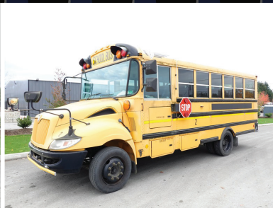
2011 IC PB40500