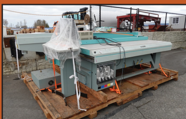
2011 FUJI ACTUITY ADVANCEHS-W10