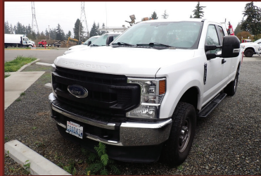
2020 FORD F250 XL