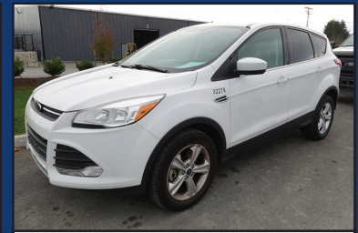
2014 FORD ESCAPE