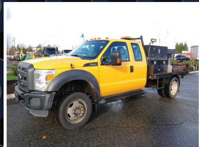
2013 FORD F550