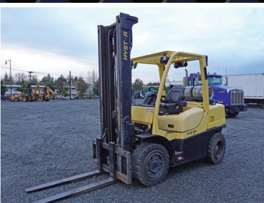
2018 HYSTER H90FT