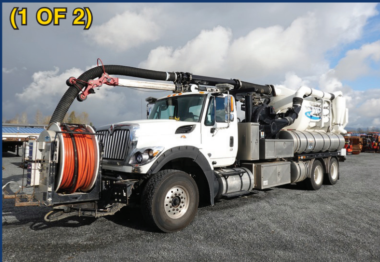
2016 INTERNATIONAL 7600