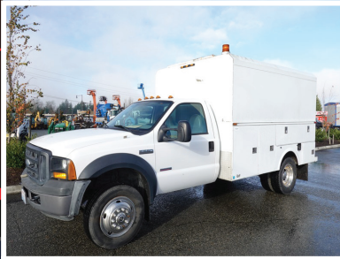
2006 FORD F550