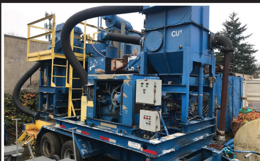
ECS T/A MOBILE FARRIS & NON FARRIS ABRASIVE RECYCLER