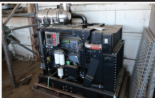
DEUTZ TCD 6.1 L6 173HP