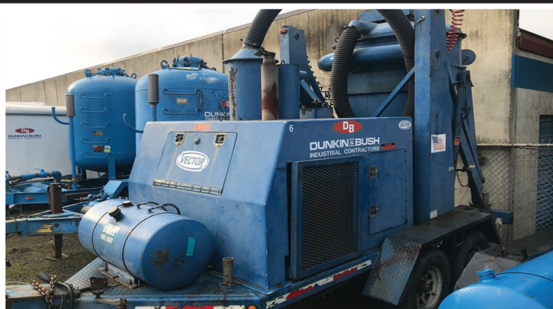
VECTOR 616 HP ABRASIVE VACUUM

INDUSTRIAL SANDBLASTING & PAINTING CONTRACTOR