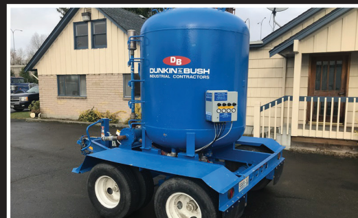
CAM INDUSTRIES 6-TON BULK BLAST POT

James G. Murphy Co. Commercial & Industrial Auctioneers