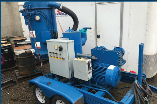
VECTOR SPARTAN 480V 2000 CFM VACUUM

START DATE: 11:00 AM | THURSDAY - DEC 13 END DATE: 11:00 AM | THURSDAY - DEC 20