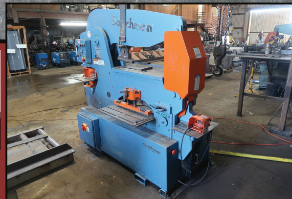
2023 SCOTCHMAN DO 150/240-24M