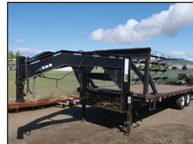
2018 CARRY ON TRAILERS