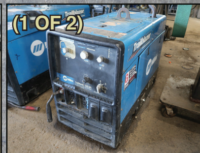
(1 OF 2) MILLER TRAILBLAZER 325 EFI