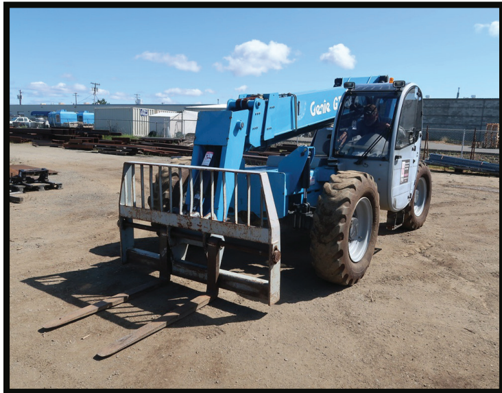
2008 GENIE GTH-844