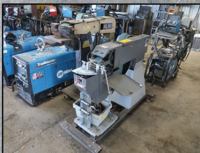
2019 FEIN 79012209233-GX752H