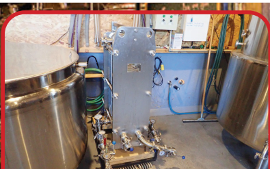
2016 NANHUA BR2A-JZ-20B