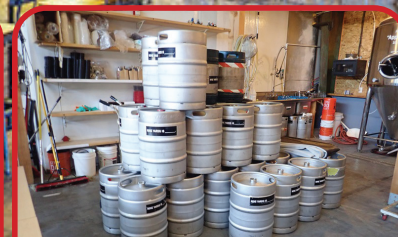
(95) 1/2 BARREL S/S KEGS