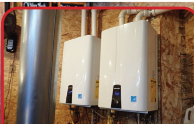
(2) NAVIEN NPE-240A