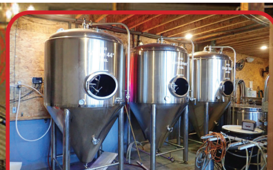
(3) 2015 10 BBL S/S JACKETED FERMENTATION TANKS