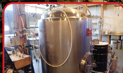
2015 10 BBL S/S JACKETED BRITE TANK