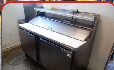
BEVERAGE AIR SPE60-16