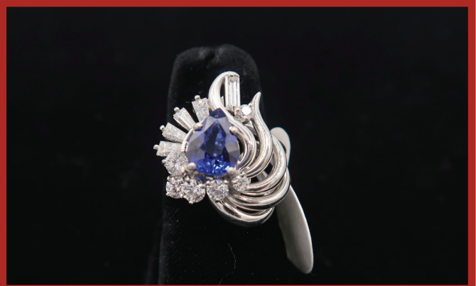
PLATINUM RING W/5 BAGUETTE DIAMONDS, 6 ROUND DIAMONDS, 1.86 CARAT SAPPHIRE

18226 68TH AVENUE NE., KENMORE, WA 98028