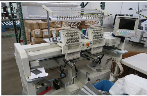
ATLANTA ATTACHMENT E1202M