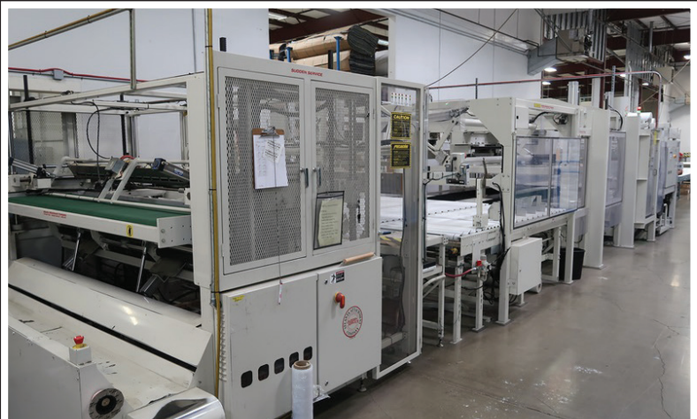
ATLANTA ATTACHMENT AUTO PAC ROLL PACK LINE