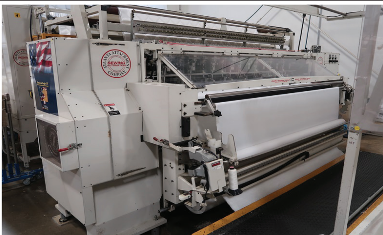
ATLANTA ATTACHMENT 1392A GOLDEN EAGLE IV

DATE: 9:00 AM | THURSDAY - MAY 9 PREVIEW 8:00 AM TO 4:00 PM | WEDNESDAY, MAY 8 10360 S.W. SPOKANE COURT, TUALATIN, OR 97062 MATTRESS MANUFACTURER