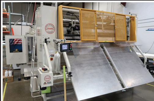
ATLANTA ATTACHMENT 1393E