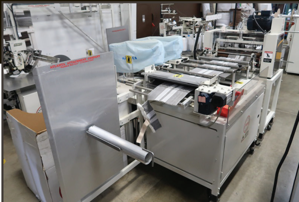
ATLANTA ATTACHMENT 4500