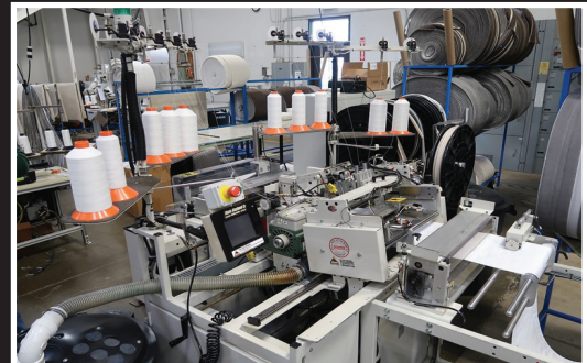
ATLANTA ATTACHMENT 4300A

James G. Murphy Co. Commercial & Industrial Auctioneers