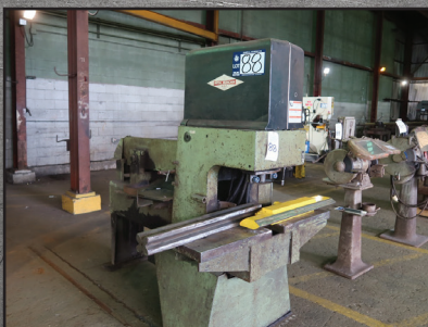
CENTER ENGINEERING METAL MUNCHER MM90