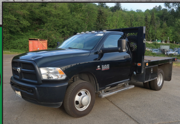
2016 DODGE RAM 3500