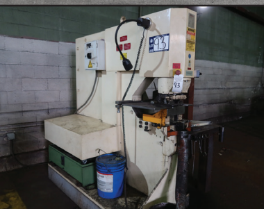
GEKA PUMA 110/E-500