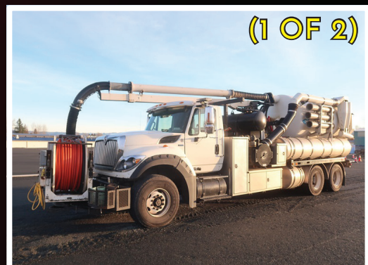
2012 INTERNATIONAL 7600