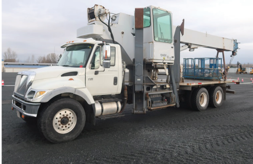
2007 INTERNATIONAL 7500