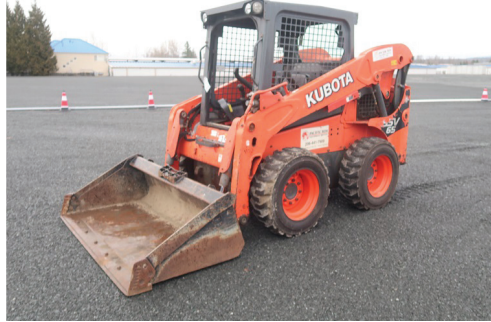
2016 KUBOTA SSV65