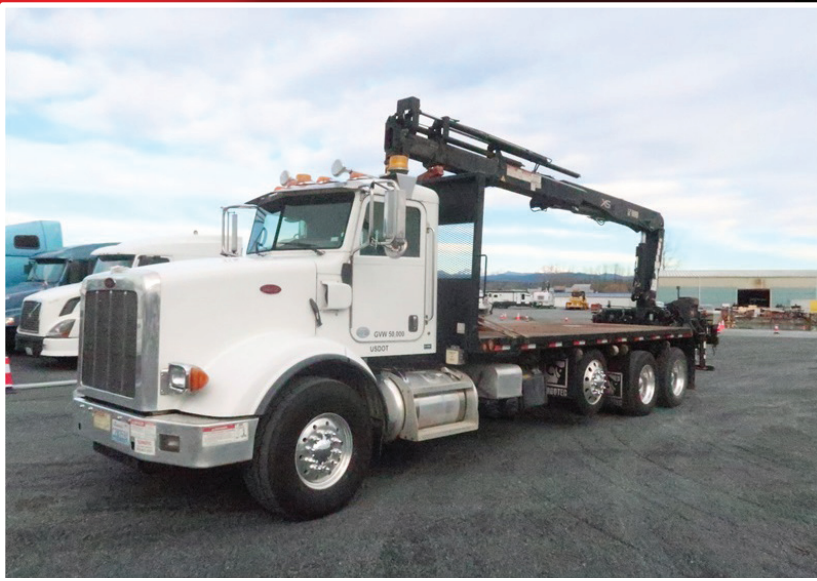
2012 PETERBILT 365

START DATE: 10:00 AM | THURSDAY - FEBRUARY 2 END DATE: 10:00 AM | THURSDAY - FEBRUARY 9