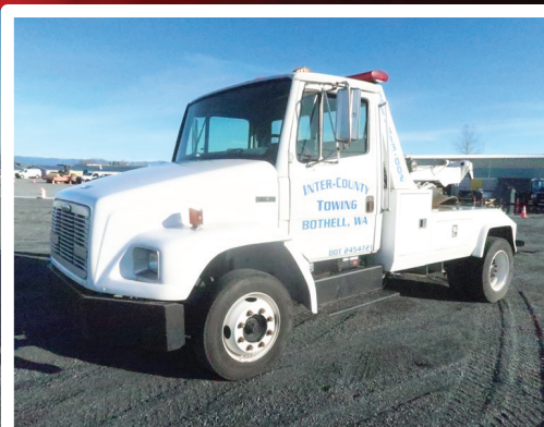
2000 FREIGHTLINER FL60