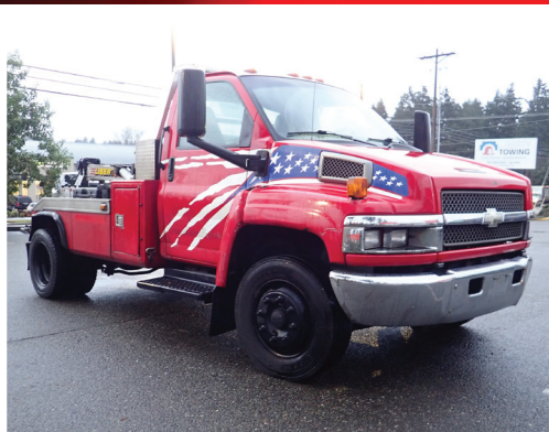
2007 CHEV C5500