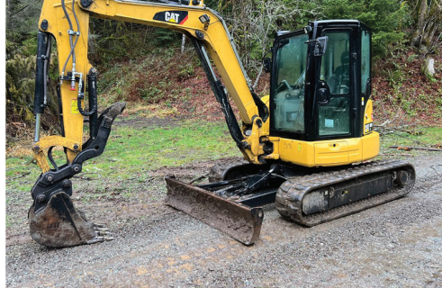
2018 CAT 305E2