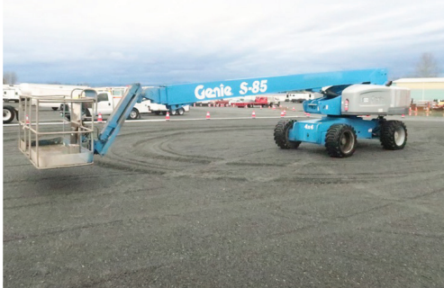
2010 GENIE S-85