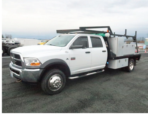
2011 RAM 4500