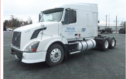
2007 VOLVO VN SERIES

1.800.426.3008 - 425.486.1246 - murphyauction.com