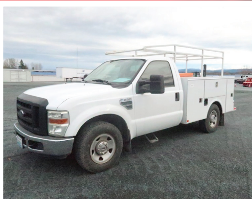
2008 FORD F250