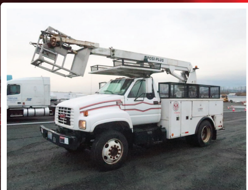
1999 GMC C6500