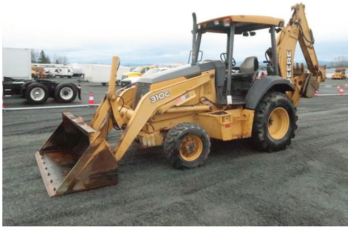
2006 JOHN DEERE 310G 4X4