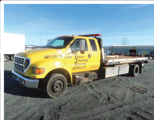
2002 FORD F650