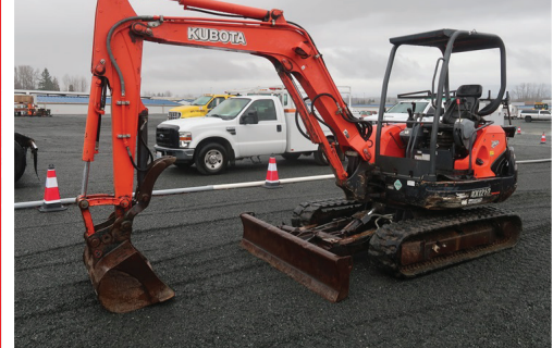
2013 KUBOTA KX121-3