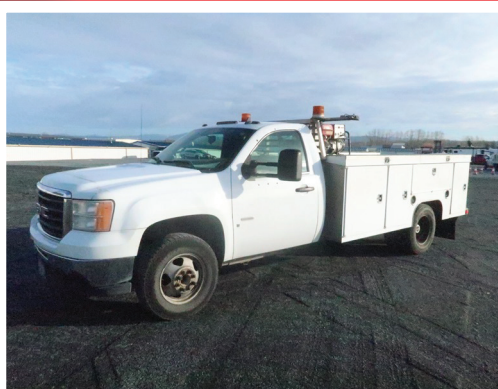
2008 GMC 3500