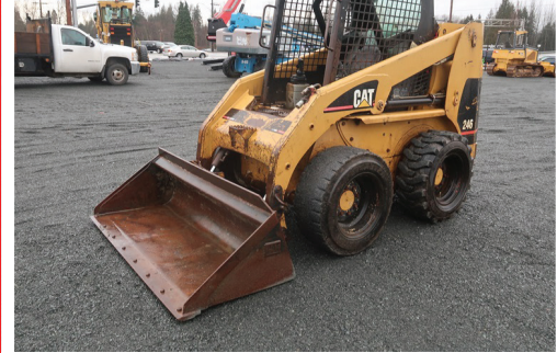
2003 CAT 246