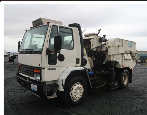
1988 FORD CARGO 7000