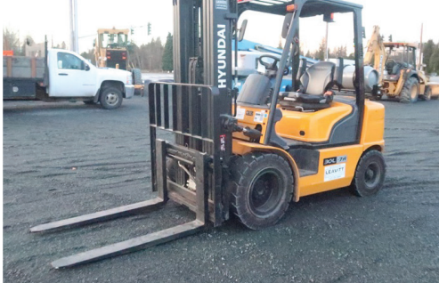
2021 HYUNDAI 30L-7A