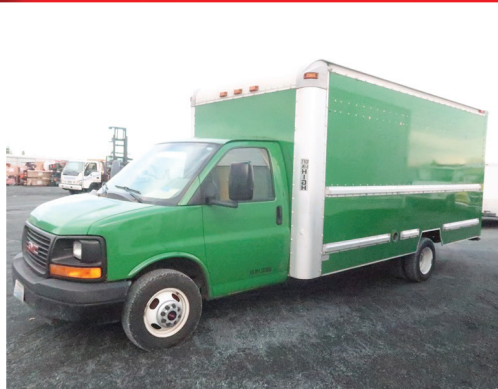
2008 GMC 3500