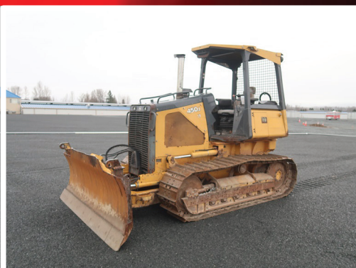
2005 JOHN DEERE 450J