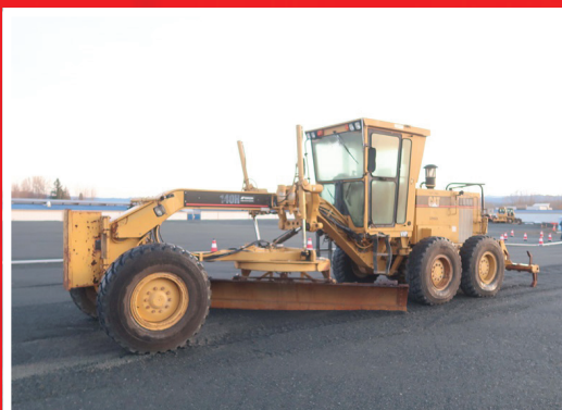
1996 CAT 140H VHP