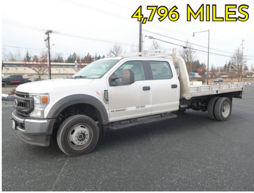
2021 FORD F550