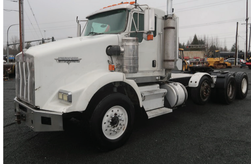
2007 KENWORTH T800