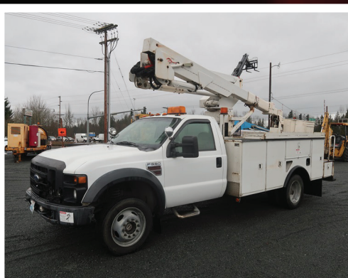
2008 FORD F550