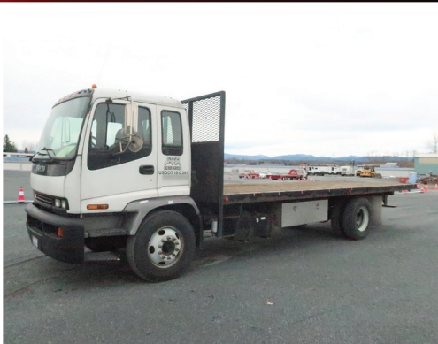
2006 ISUZU FTR