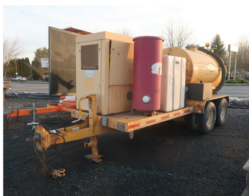
2005 VAC-TRON PKD 800SDT