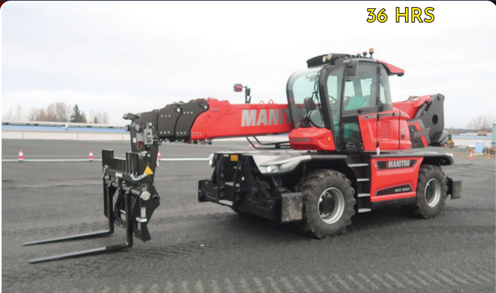
2021 MANITOU MRT 2660 ST5