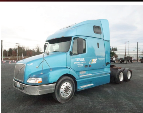
2002 VOLVO VN SERIES