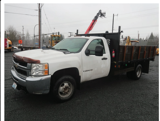
2007 CHEV 3500HD