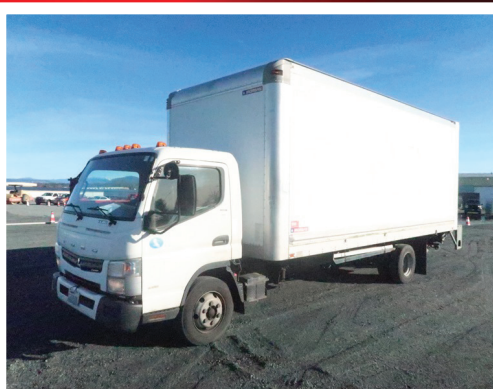
2014 MITSUBISHI FE180