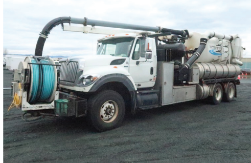
2012 INTERNATIONAL 7600