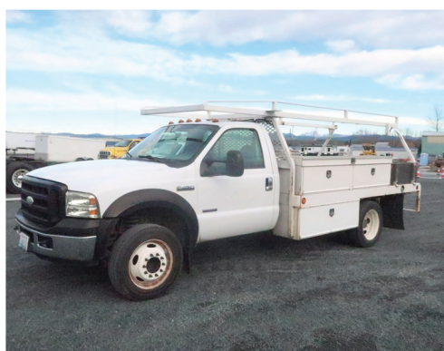
2007 FORD F450