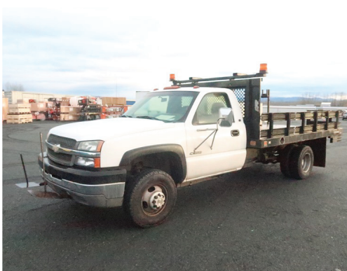
2002 CHEV 3500