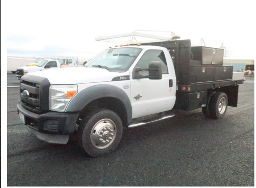
2011 FORD F450