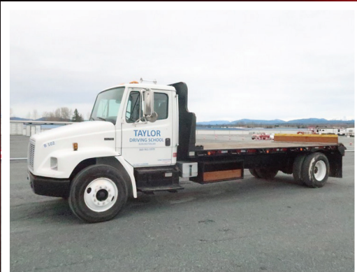
1999 FREIGHTLINER FL70