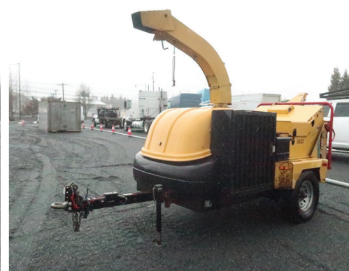
2006 VERMEER BC1400