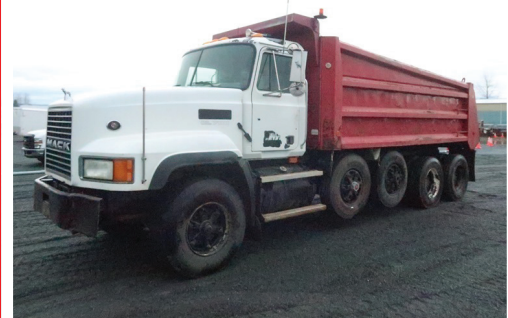
2003 MACK GL700