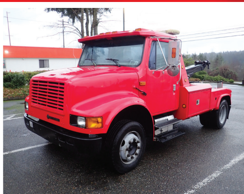
2000 INTERNATIONAL 4700