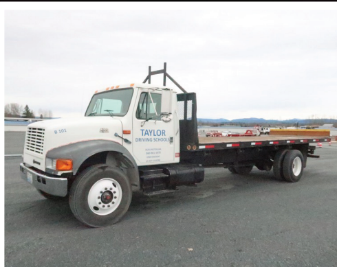
1999 INTERNATIONAL 4700