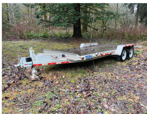
2018 TRAILMAX T-16-UT