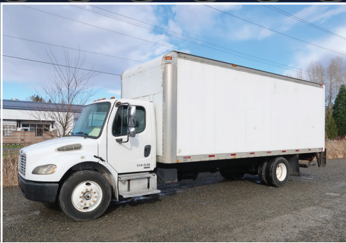
2006 FREIGHTLINER M2