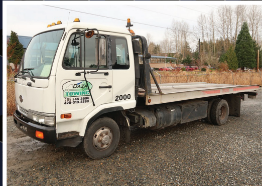
2000 NISSAN UD2000