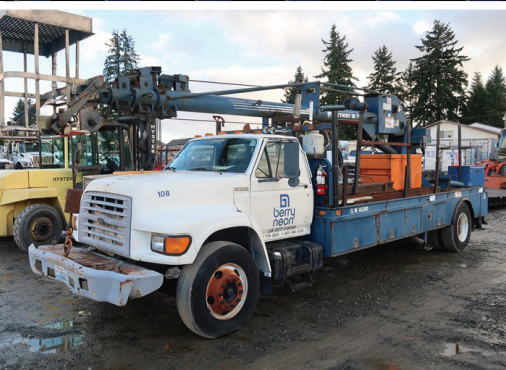
1998 FORD F800