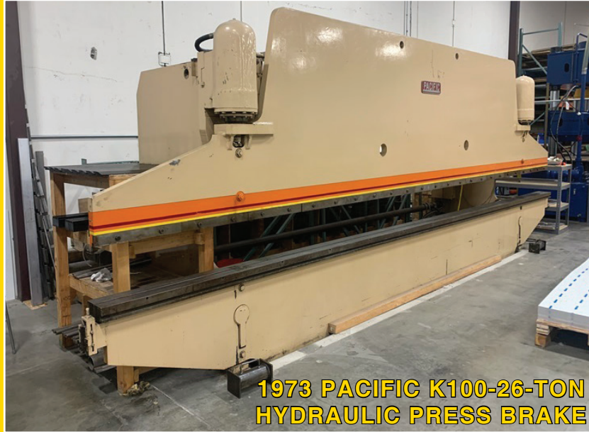
1973 PACIFIC K100-26-TON HYDRAULIC PRESS BRAKE