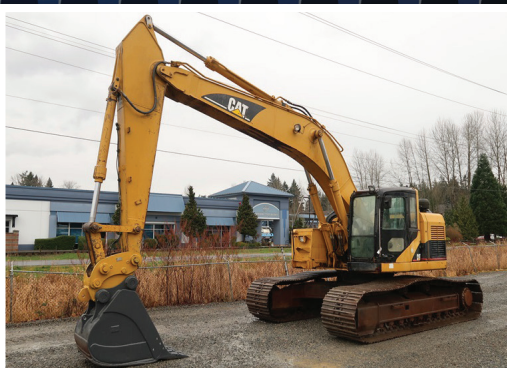
2004 CAT 325C LCR