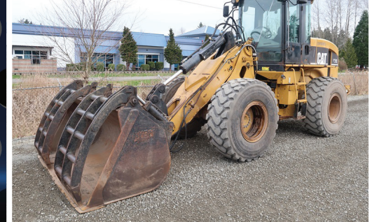
2007 CAT 930G