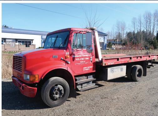
2000 INTERNATIONAL 4700