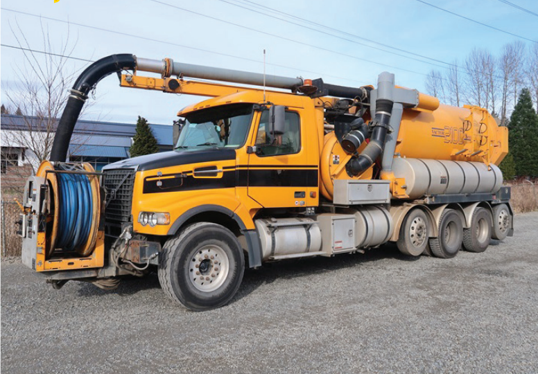
2007 VOLVO WTA64T QUAD/A