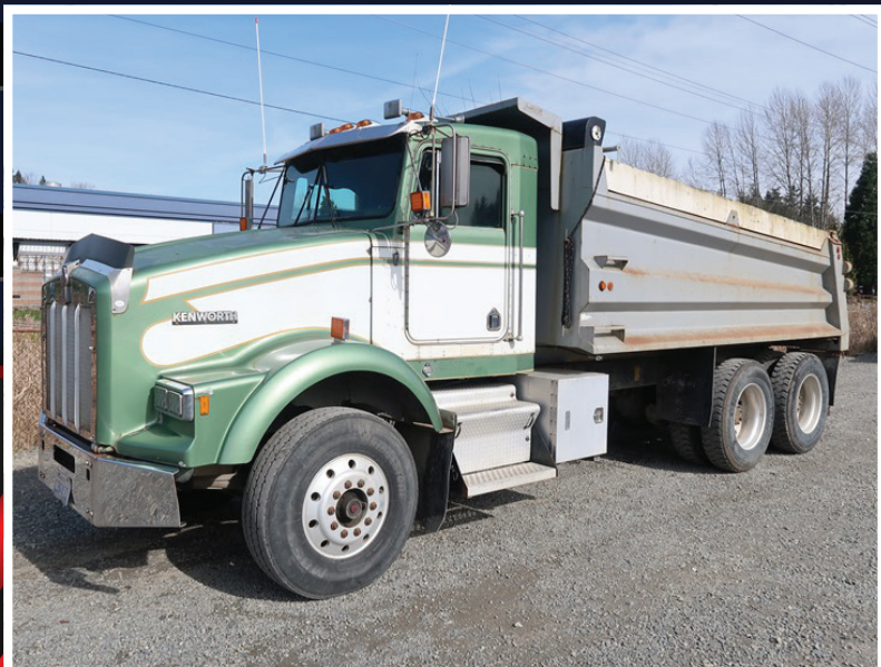
1990 KENWORTH T800