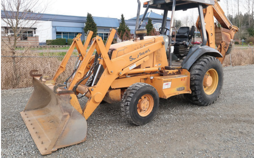
2000 CASE 580 SUPER L SERIES 2