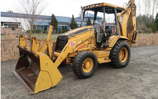
2000 CAT 416 4WD