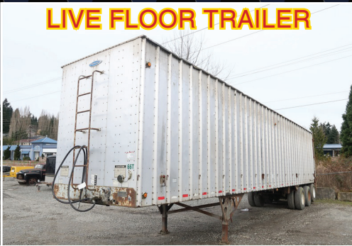
1998 PEERLESS 48-RTSSF TRI/A