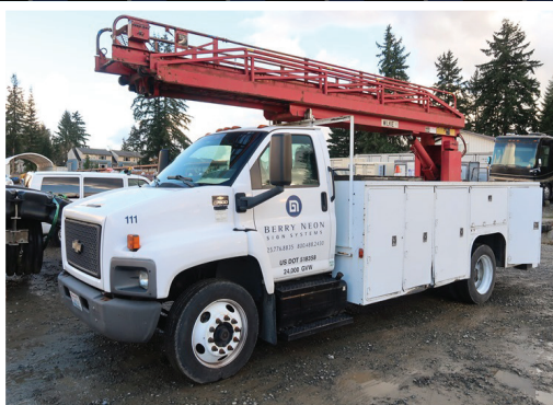
2004 CHEV C7500