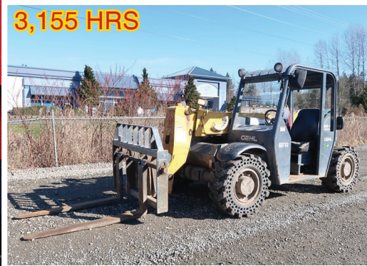
2014 GEHL RS5-19