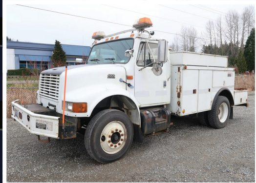
2000 INT'L 4700