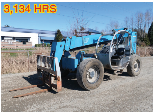
2008 GENIE GTH-644