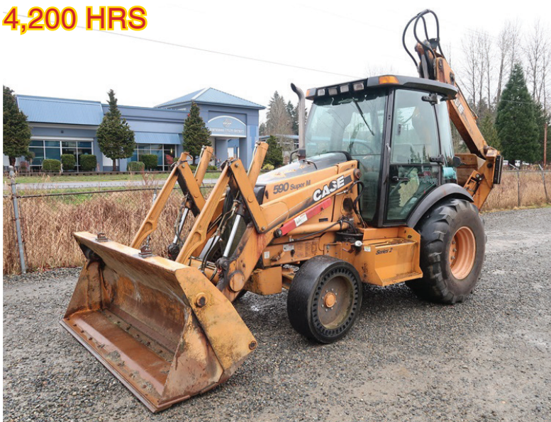
2006 CASE 591 SUPER M SERIES 2