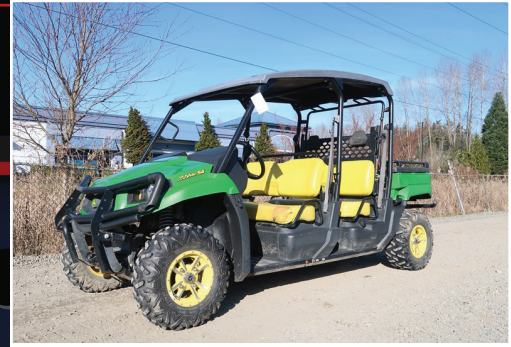
2012 JOHN DEERE GATOR XUV550 S5