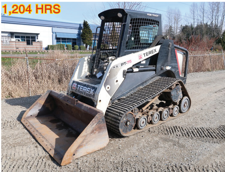
2014 TEREX PT75