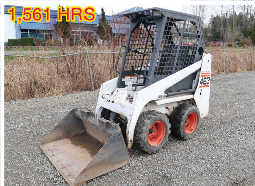
2008 BOBCAT 463