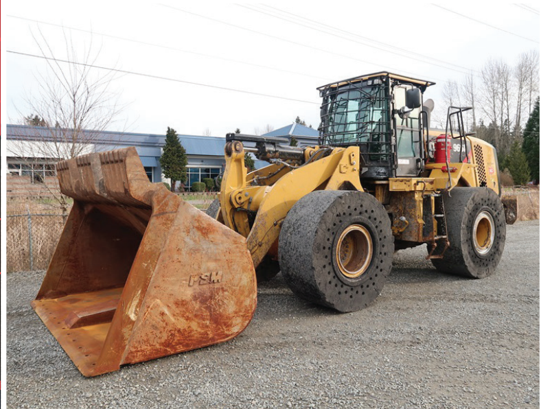
2012 CAT 966K W/WASTE HANDLER PACKAGE