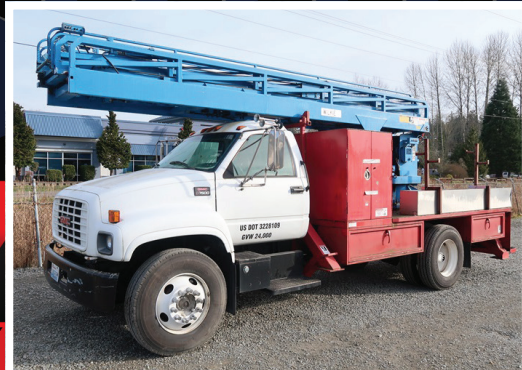
2000 GMC C7500

1.800.426.3008 - 425.486.1246 - murphyauction.com