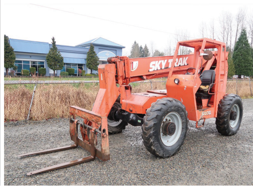
1990 SKY TRACK 6037