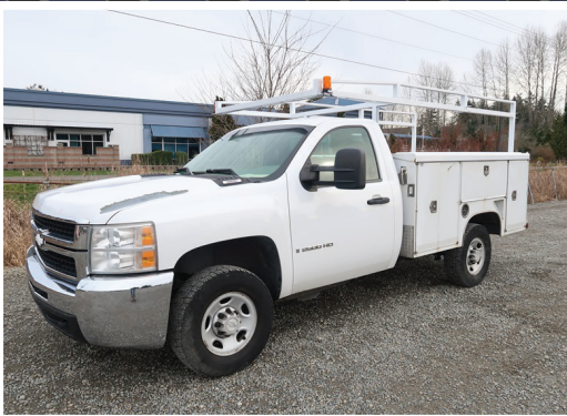
2007 CHEV 2500