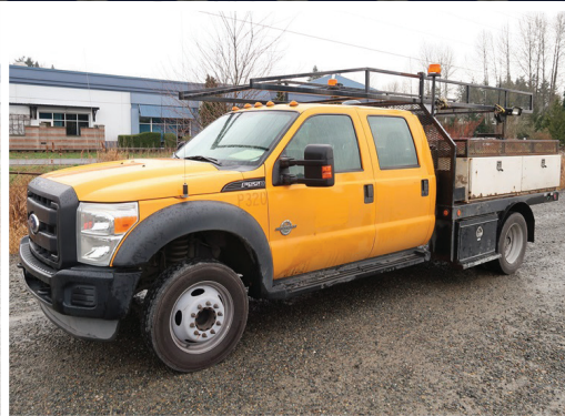
2011 FORD F550