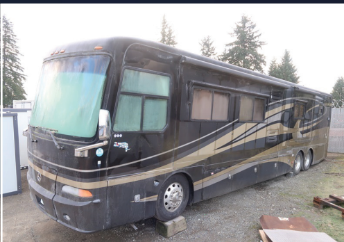
2008 HOLIDAY RAMBLER SCEPTER M-42DSQ