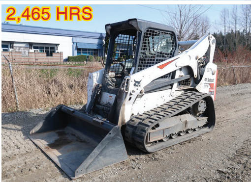
2017 BOBCAT T770