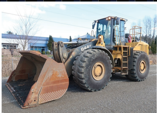
2010 JOHN DEERE 844K