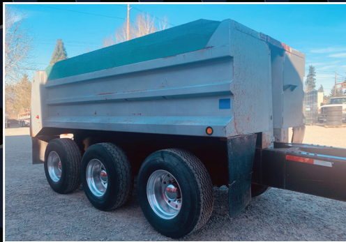
1998 WILLIAMSEN TRI/A PUP