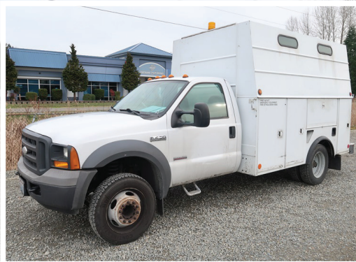
2005 FORD F450