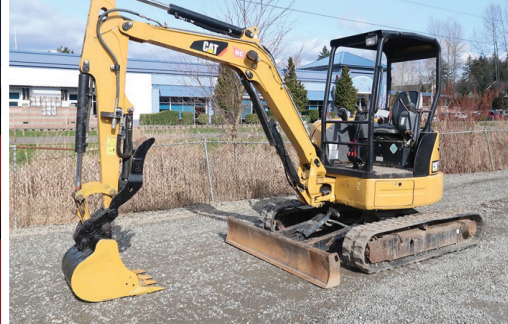
2015 CAT 304E CR