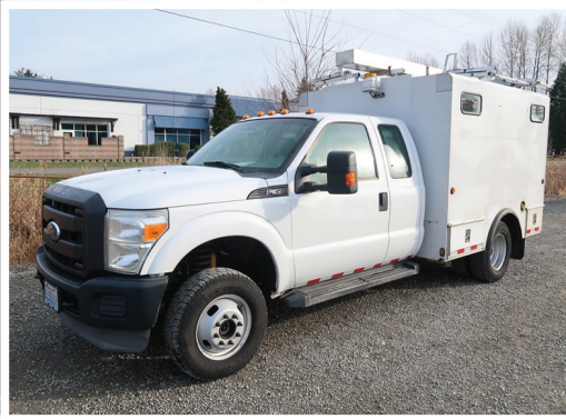
2011 FORD F350 EXT CAB