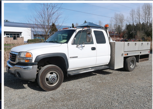
2005 GMC 3500 EXT CAB