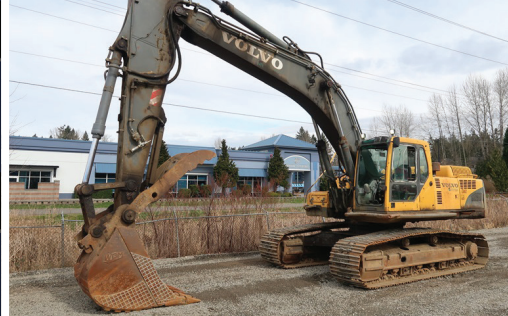
2006 VOLVO EC330BLC