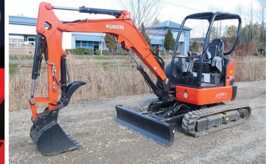
2015 KUBOTA U35-4