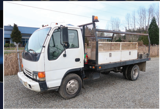
1997 ISUZU NPC7SF