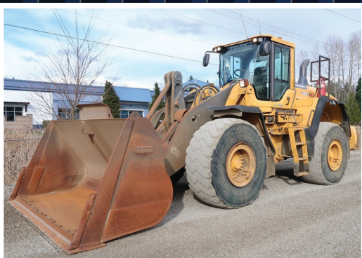
2015 VOLVO L180G