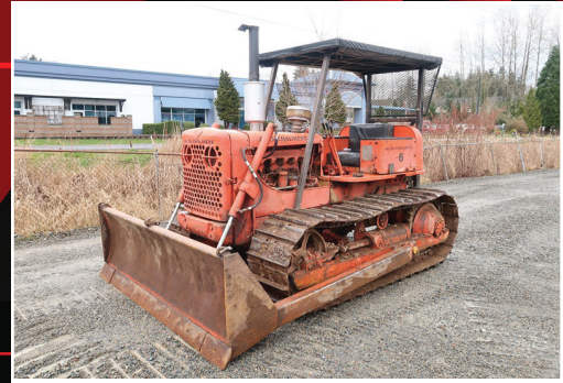
ALLIS CHALMERS HD6