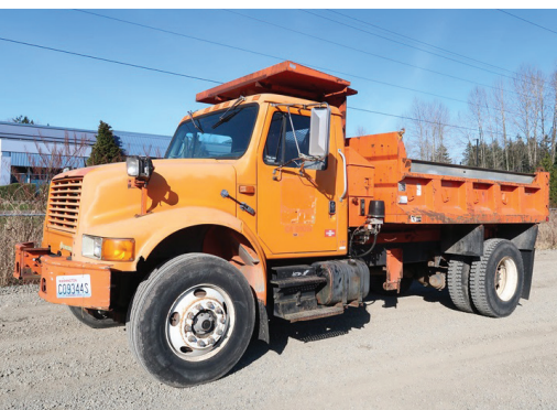
1993 INTERNATIONAL 4900