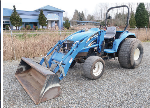
NEW HOLLAND TC40A