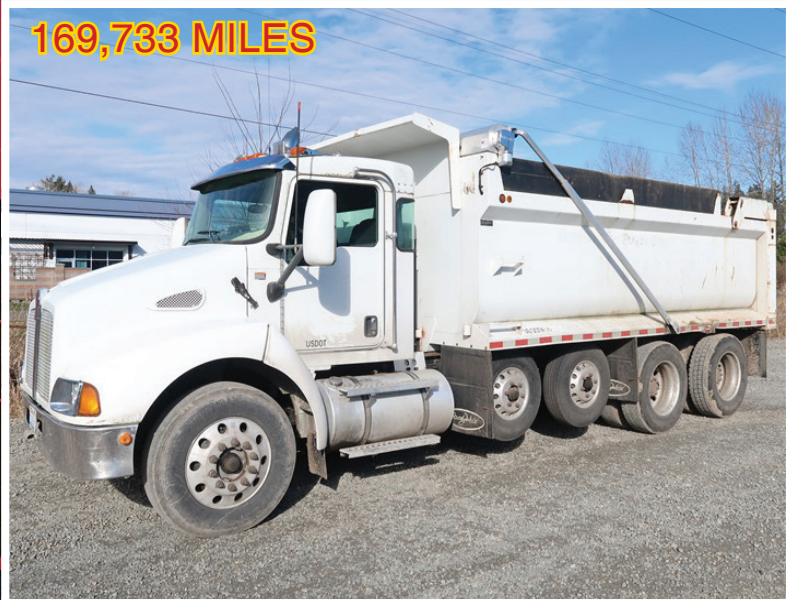
2008 KENWORTH T300 QUAD/A