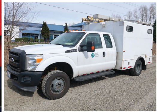
2011 FORD F350 EXT CAB