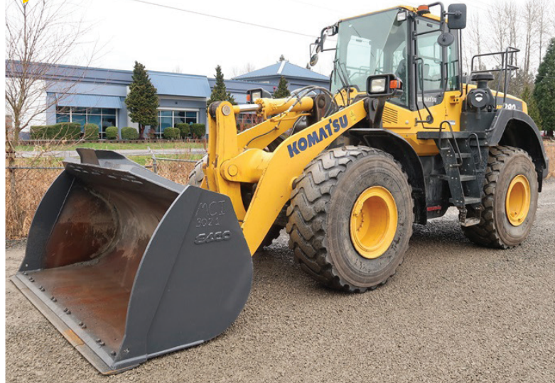
2017 KOMATSU WA380-8