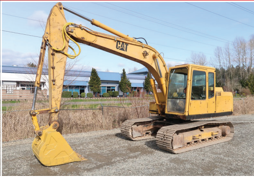
1989 CAT E120B