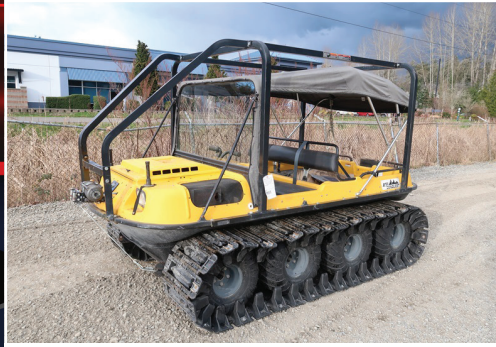
2002 ARGO CONQUEST