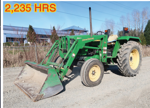
JOHN DEERE 5203