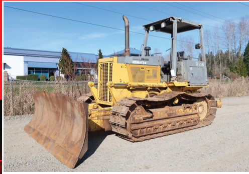
1999 KOMATSU D39E-1