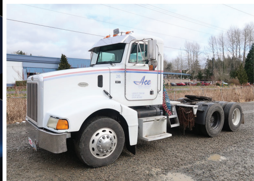
1998 PETERBILT 385