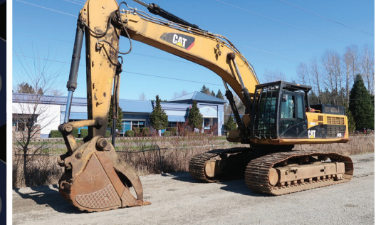
2012 CAT 345D