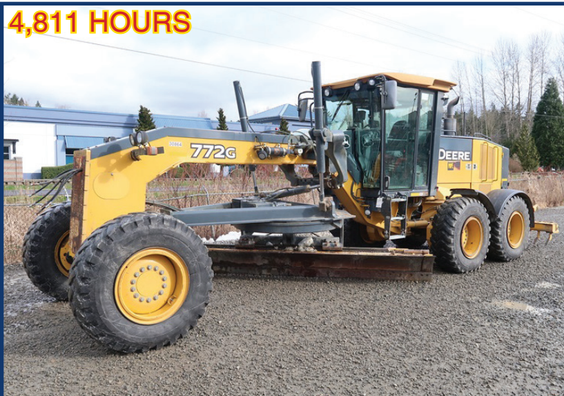
2009 JOHN DEERE 772G