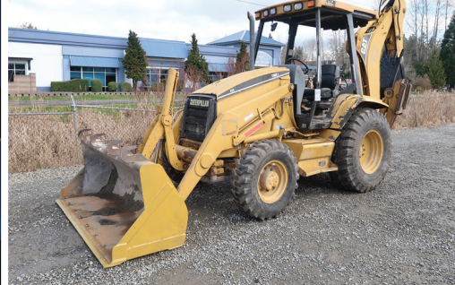
2000 CAT 416C 4WD