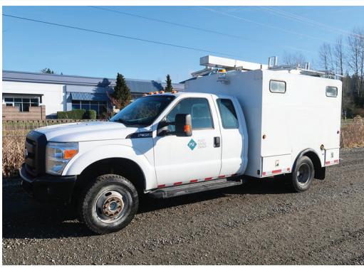
2011 FORD F350