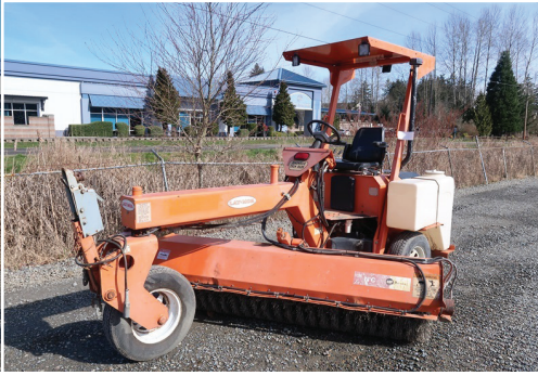
2007 LAYMOR 8HC