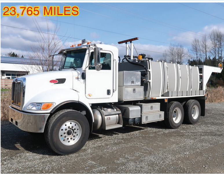
2011 INTERNATIONAL PB348 T/A