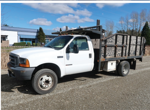
1999 FORD F450