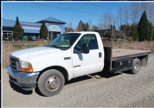
2001 FORD F350