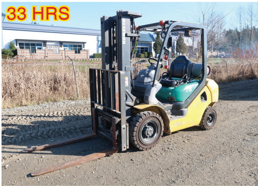
2007 KOMATSU FG25T