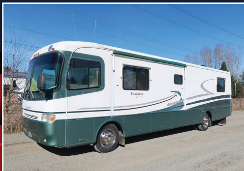
1998 HOLIDAY RAMBLER ENDEAVOR