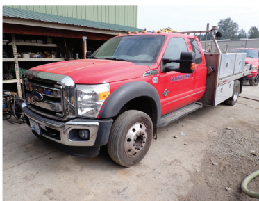
2016 FORD F550