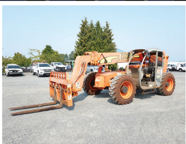
2018 XTREME XR1147