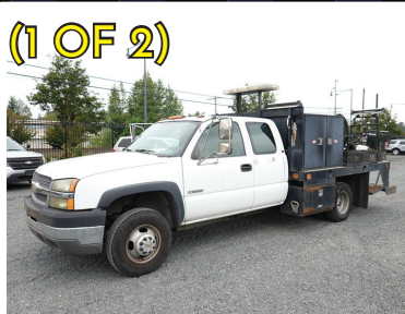
2004 CHEV 3500