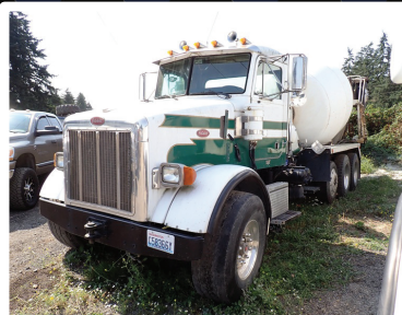
2001 PETERBILT 357