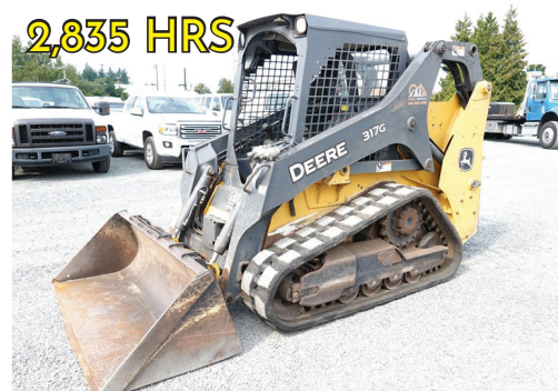
2016 JOHN DEERE 317G