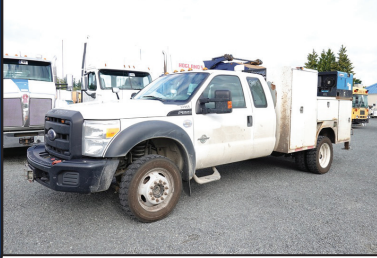
2015 FORD F550