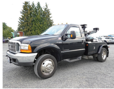
1999 FORD F450