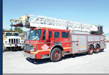
2000 AMERICAN LAFRANCE