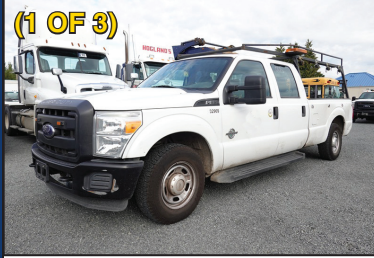
2015 FORD F350