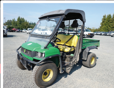
JOHN DEERE HPX DSL