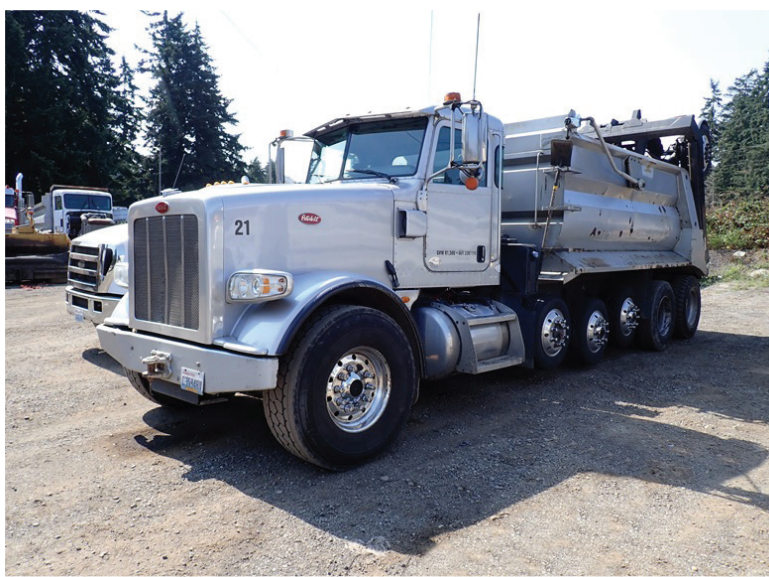
2015 PETERBILT SUPER SOLO