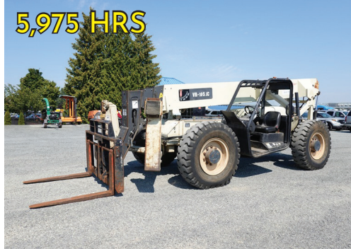
2006 INGERSOLL RAND VR-1056C