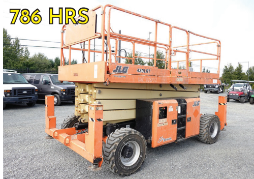
2019 JLG 430LRT