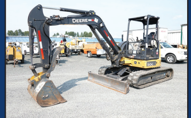
2016 JOHN DEERE 50G