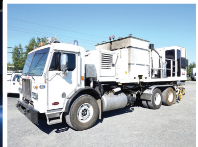
2009 PETERBILT PB320