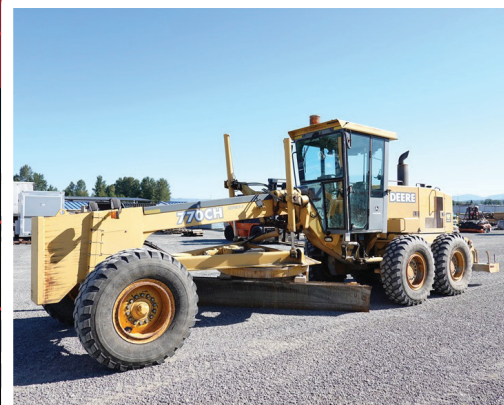
2003 JOHN DEERE 770CH