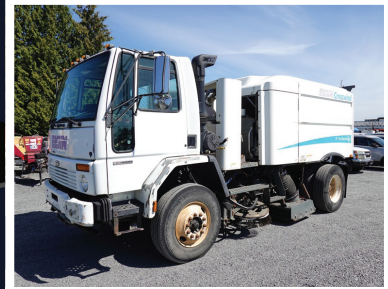
2002 STERLING SC8000