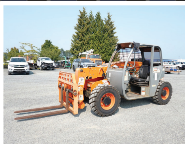
2021 XTREME XR619