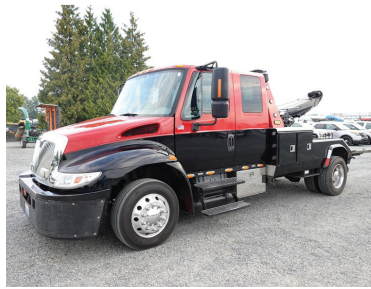
2006 INTERNATIONAL 4300