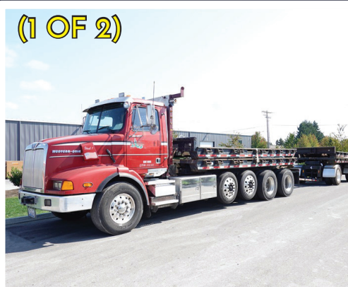
2003 WESTERN STAR