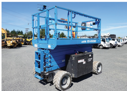
2015 GENIE GS4069BE