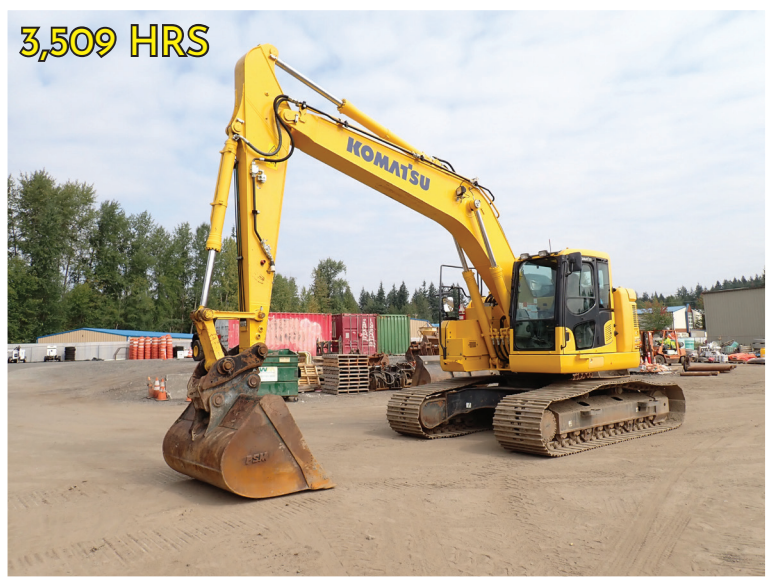
2018 KOMATSU PC238USLC-11