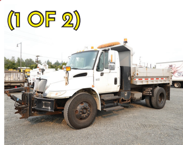
2007 INTERNATIONAL 4400