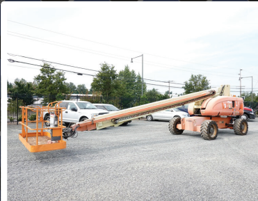
2006 JLG 800S