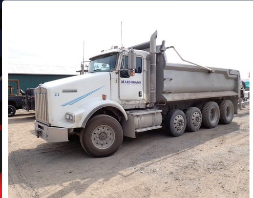
2008 KENWORTH T800