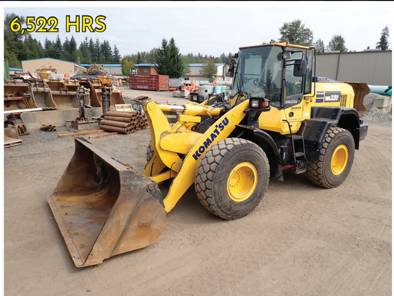
2017 KOMATSU WA320-8