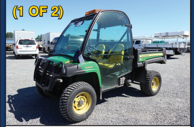
2018 JOHN DEERE 855M