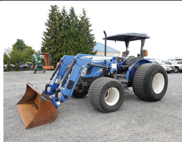
2006 NEW HOLLAND TN75A