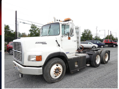
1990 FORD L9000