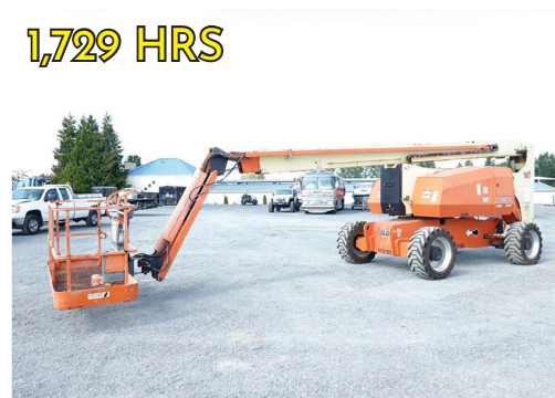
2013 JLG 800AJ