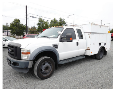
2009 FORD F450