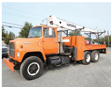
1989 FORD L8000