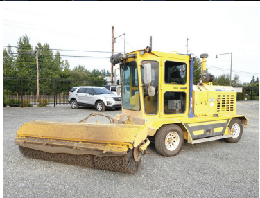
2018 SUPERIOR BROOM SM74J