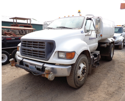
2000 FORD F600