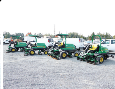
JOHN DEERE MOWERS