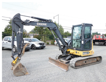
2014 JOHN DEERE 50G