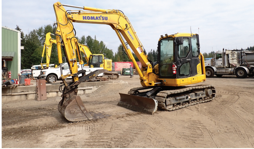
2021 KOMATSU PC88USLC-11