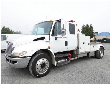
2010 INTERNATIONAL 4300