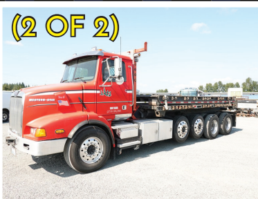
2003 WESTERN STAR