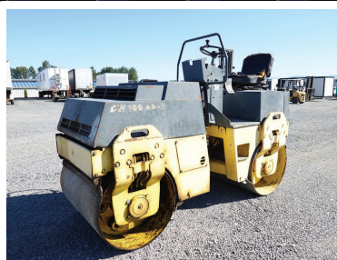
1996 BOMAG BW100AD-3