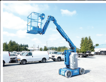
2007 GENIE Z-30/20N