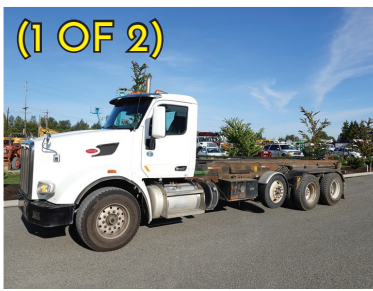
2015 PETERBILT 567