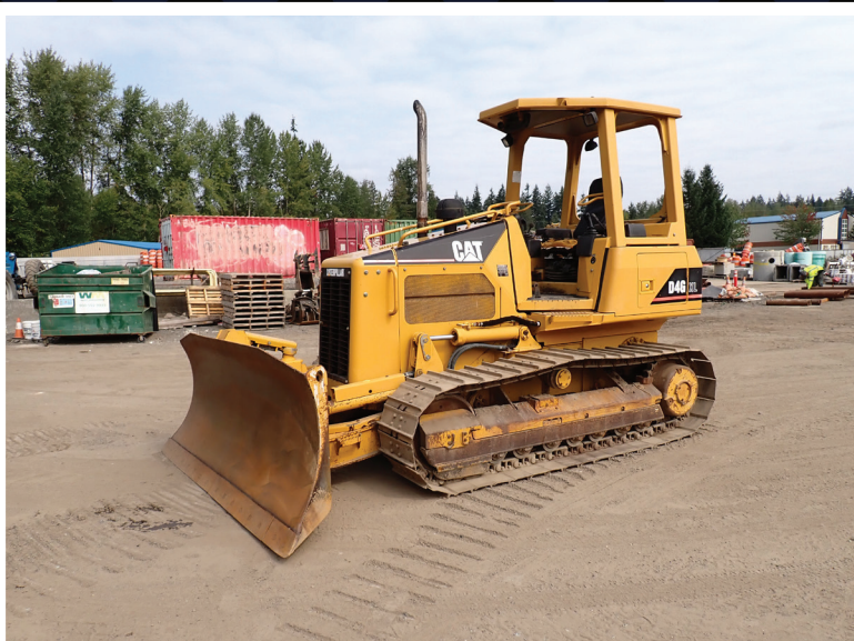
2007 CAT D4GXL