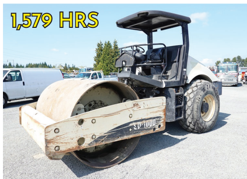
2006 INGERSOLL RAND SD-100D