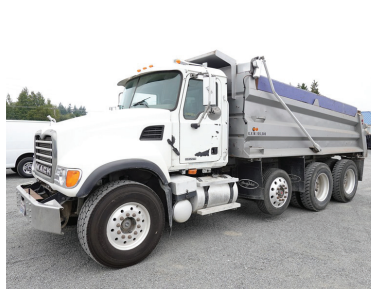
2007 MACK CV713