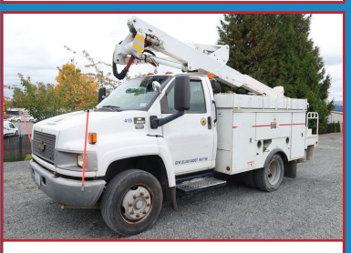
2006 CHEV C5500