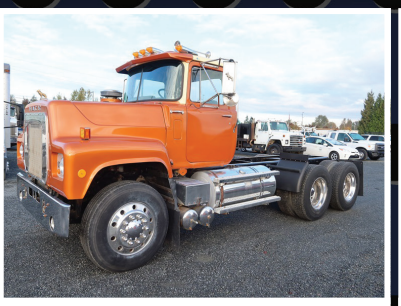
1980 MACK RS686