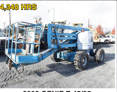
2002 GENIE Z-45/25