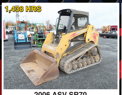
2006 ASV SR70