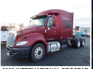
2009 INTERNATIONAL PROSTAR