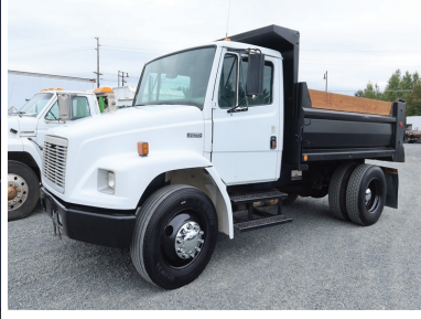
2004 FREIGHTLINER FL70