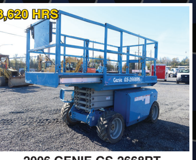
2006 GENIE GS-2668RT