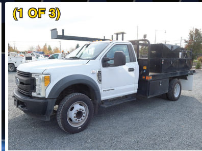
2017 FORD F450