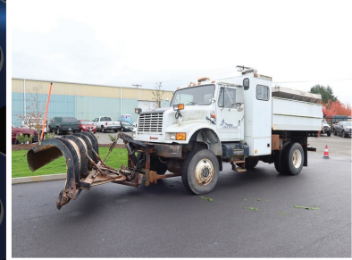
1992 INTERNATIONAL 4900