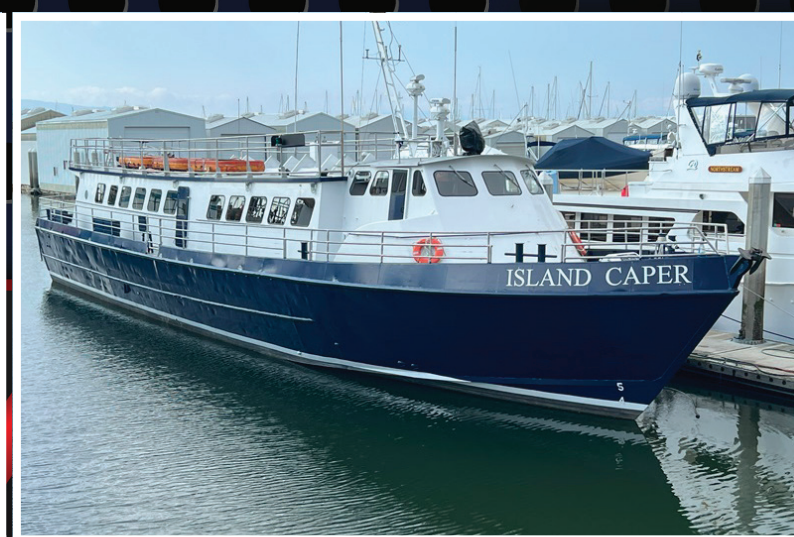
"ISLAND CAPER" 1974 SWIFTSHIPS COMMERCIAL PASSENGER VESSEL