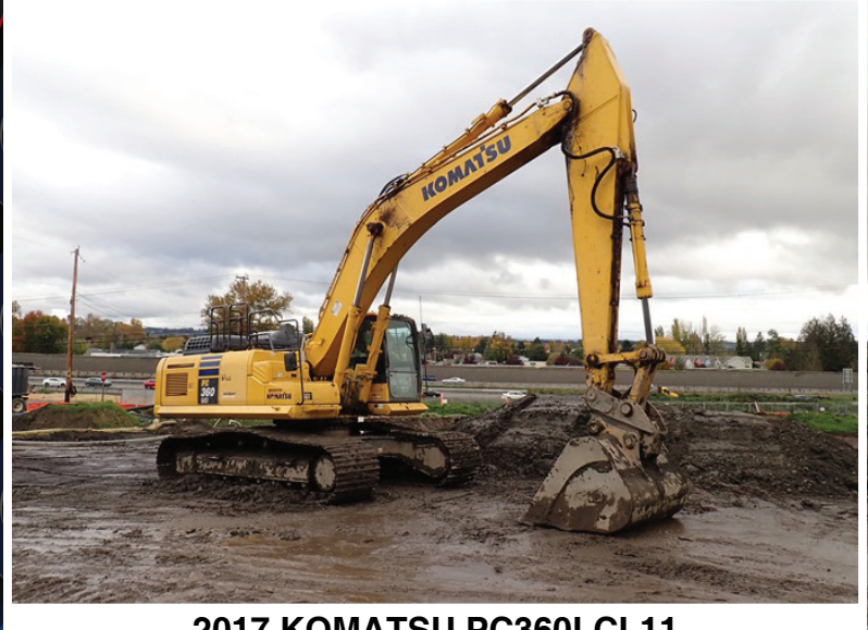
2017 KOMATSU PC360LCI-11