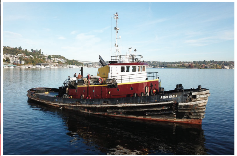
"REECE EAGLE" 1965 FMG MARINETTE MARINE *THIS ITEM WILL BE SOLD WITH A STARTING BID OF $100,000*