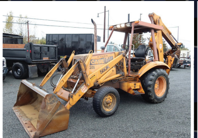
1989 CASE 580K