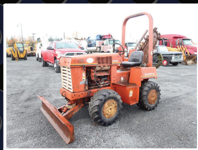
1993 DITCH WITCH 3500