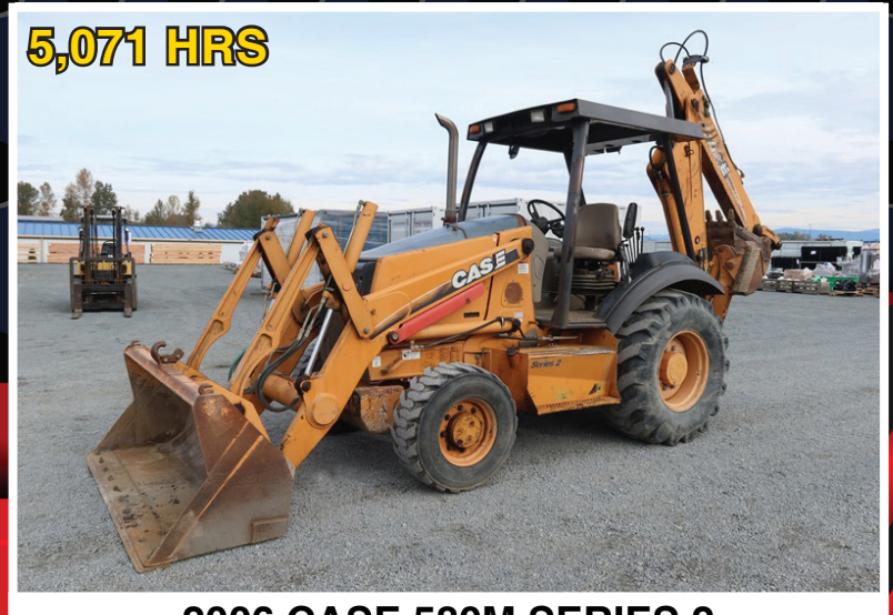
2006 CASE 580M SERIES 2