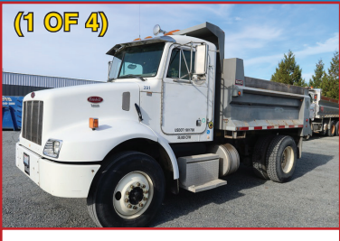
2003 PETERBILT 330