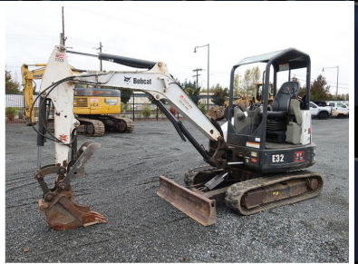
2014 BOBCAT E32