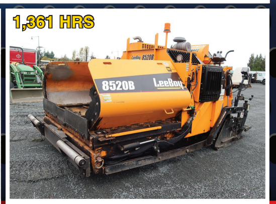
2020 LEEBOY 8520B