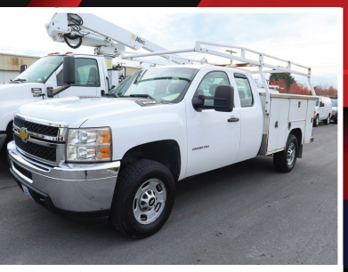
2013 CHEV 2500