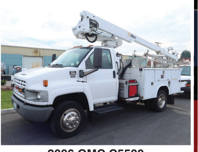
2006 GMC C5500