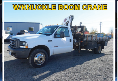
2004 FORD F550