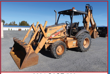
2004 CASE 580 SUPER M+ SERIES 2