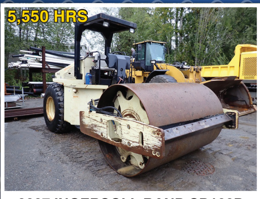
2007 INGERSOLL RAND SD100D