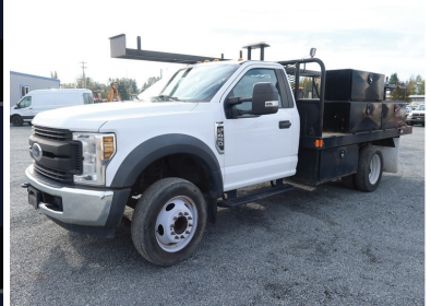
2018 FORD F450