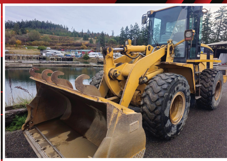
1998 CAT 938G