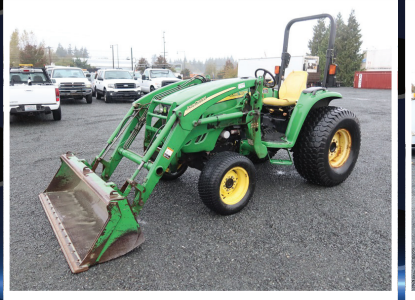
2008 JOHN DEERE 4320