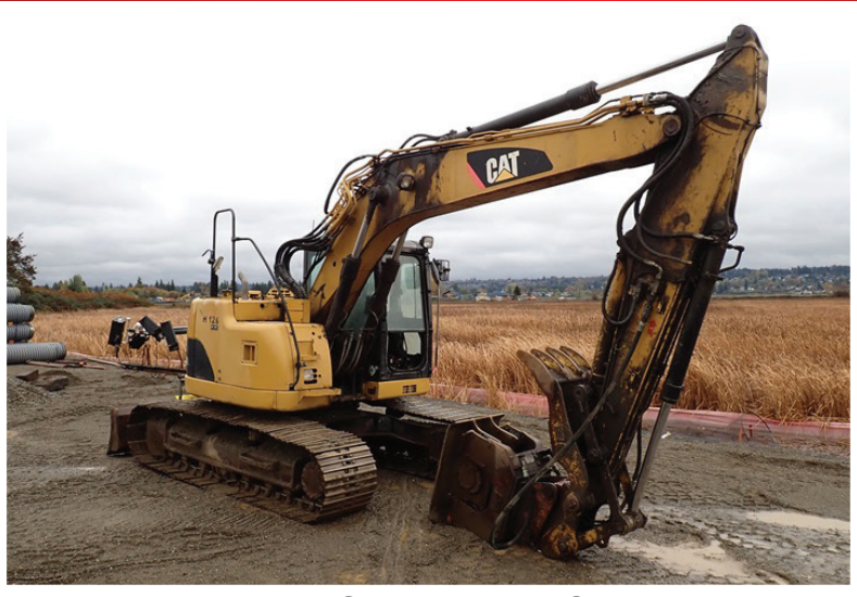
2011 CAT 314D LCR