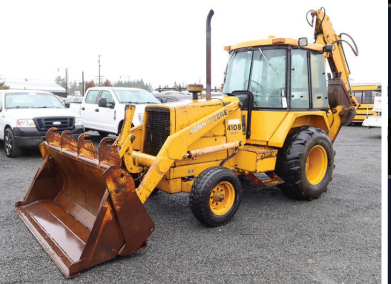
JOHN DEERE 410B