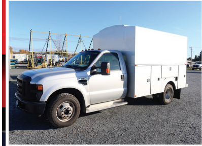
2009 FORD F350