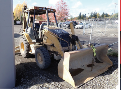
2003 CAT 420D