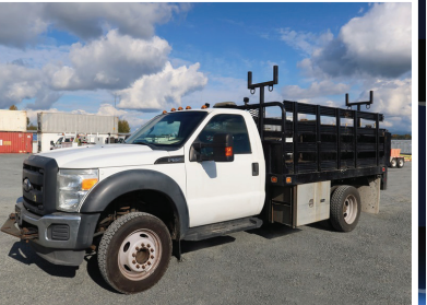
2012 FORD F550