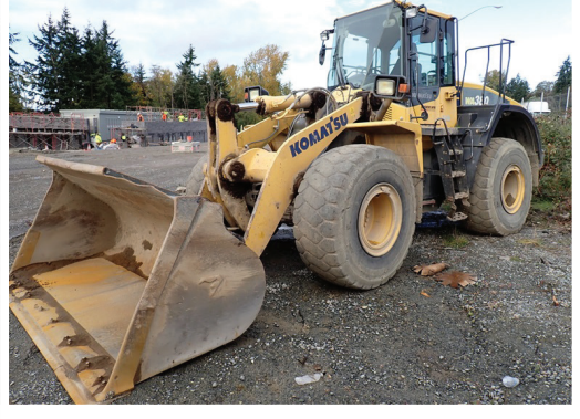
2012 KOMATSU WA380-7