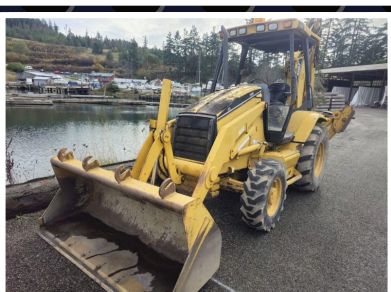
1998 CAT 416C