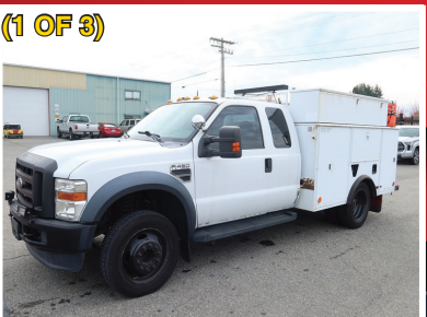
2009 FORD F450