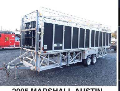
2005 MARSHALL AUSTIN