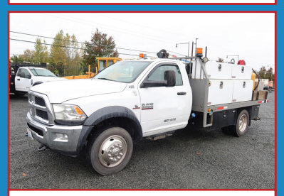
2014 RAM 5500