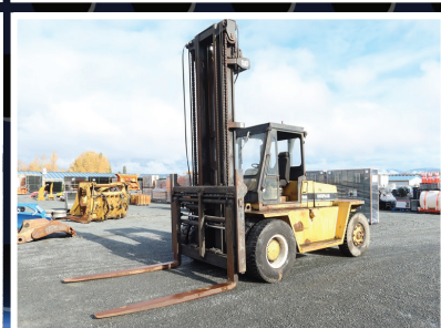
1994 CAT V330