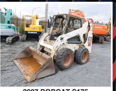
2007 BOBCAT S175