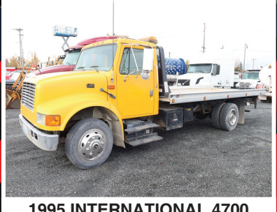
1995 INTERNATIONAL 4700