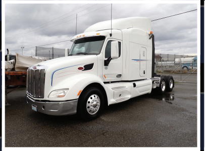
2016 PETERBILT 579