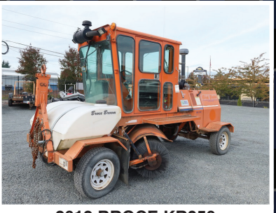
2012 BROCE KR350