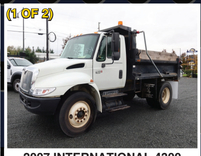
2007 INTERNATIONAL 4300