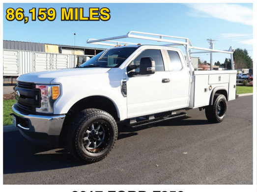
2017 FORD F250