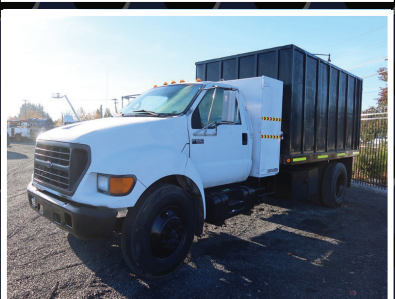
2000 FORD F650