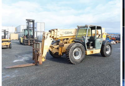
2001 GEHL DL-10H