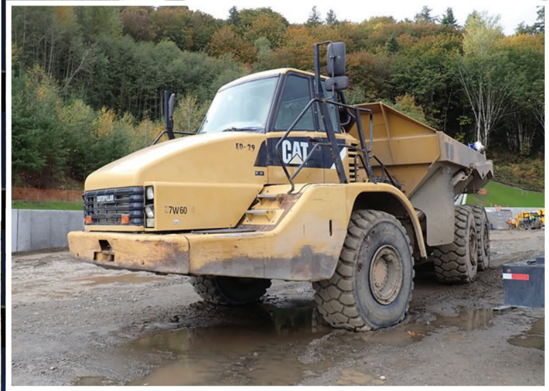
2007 CAT 735