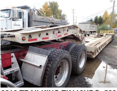
2016 TRAILKING TK110HDG+523