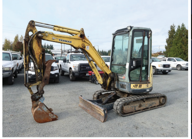
2008 YANMAR VI035-5