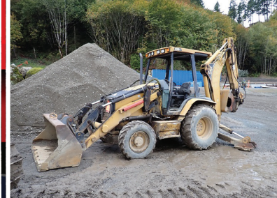
2001 CAT 420D IT