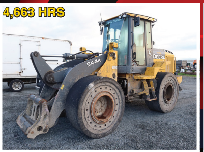
2015 JOHN DEERE 544K