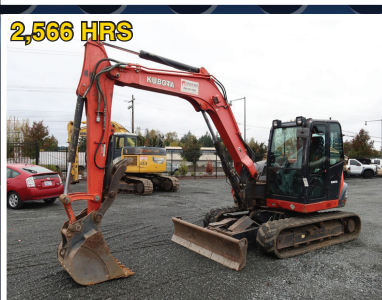
2014 KUBOTA KX080-4