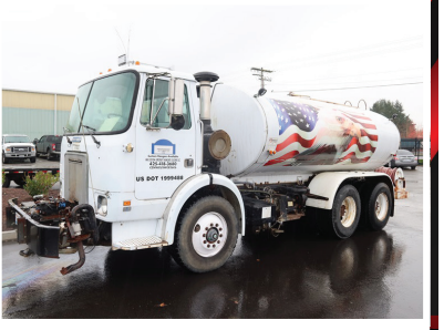
1990 WHITE GMC