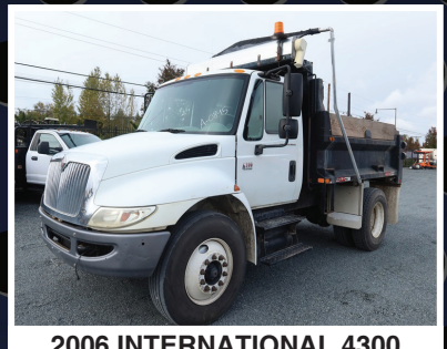
2006 INTERNATIONAL 4300