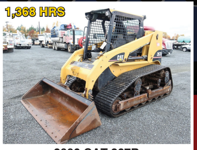
2006 CAT 267B