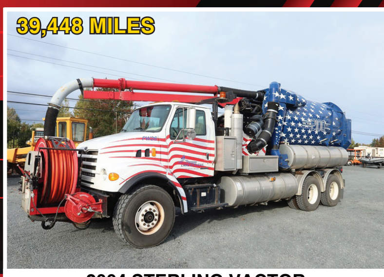
2004 STERLING VACTOR