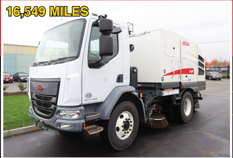
2017 PETERBILT ELGIN