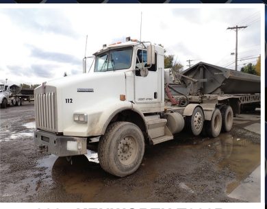
2005 KENWORTH T800B