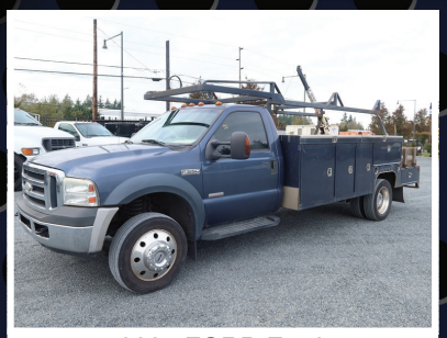
2007 FORD F550