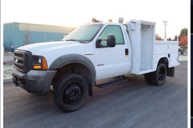
2005 FORD F450