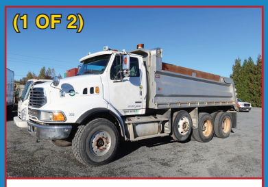
2007 & 2006 STERLING L9500