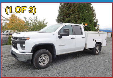
2022 CHEV 2500HD