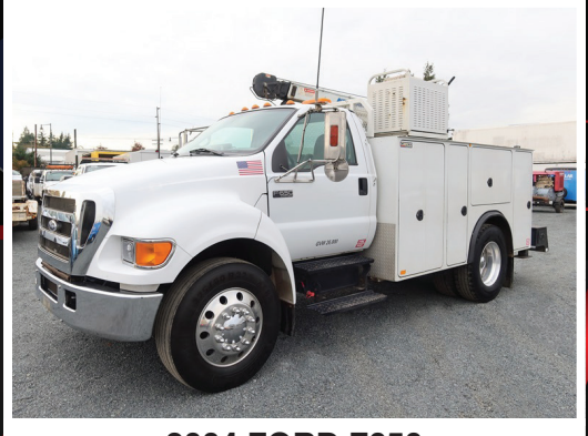
2004 FORD F650