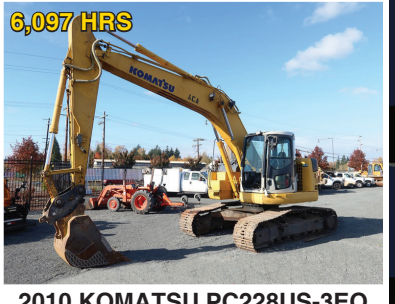
2010 KOMATSU PC228US-3EO