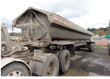
2002 TRAILKING TK60SSD-433