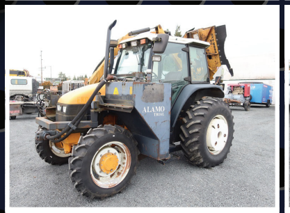
NEW HOLLAND TS110