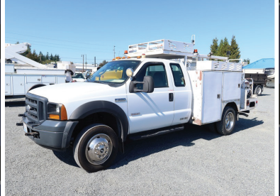
2006 FORD F550