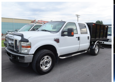
2009 FORD F350