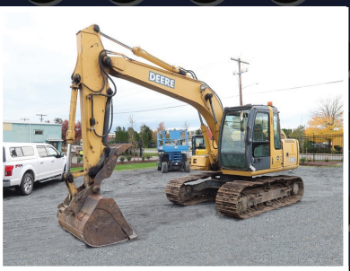
2003 JOHN DEERE 120C