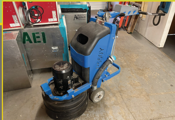
INNOVATECH BARTELL GLOBAL PREDATOR PLANETARY P550Y