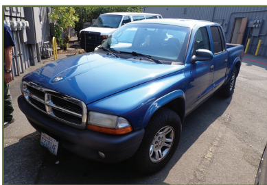
2004 DODGE DAKOTA SXT