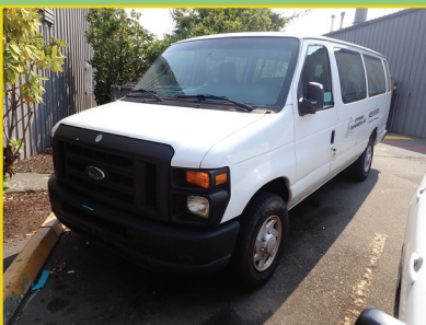
2013 FORD E350