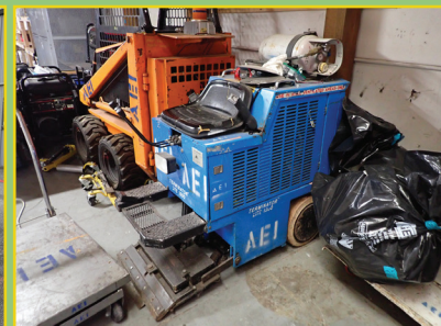
INNOVATECH TERMINATOR LITE 1500