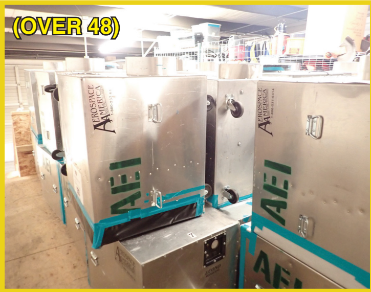
AEROSPACE AMERICA ECONO 9143 NEGATIVE AIR MACHINES

ENVIRONMENTAL CONTRACTOR & ROLLING STOCK