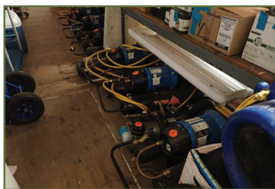
(6) AIR SYSTEMS TA-3