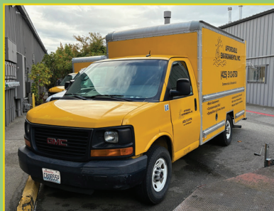
2015 CHEVROLET SAVANA