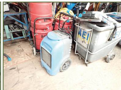
DRIEAZ DRIAIR 1200