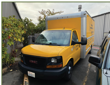
2015 GMC SAVANA