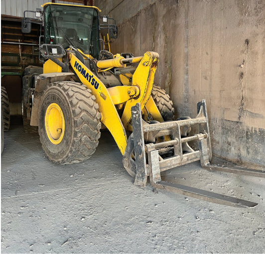
2020 KOMATSU WA270-8

PRESORTED FIRST CLASS MAIL U.S. POSTAGE PAID SEATTLE, WA PERMIT NO. 963