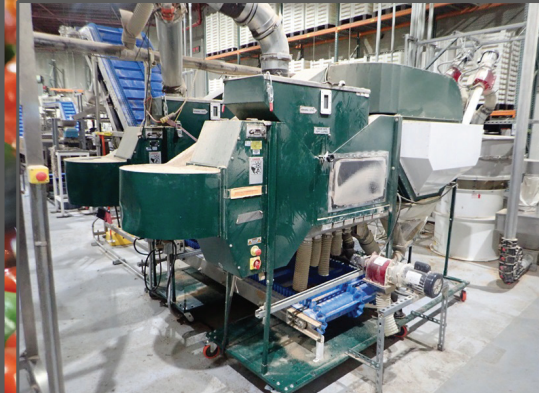
(2) 2020 GRAINCLEANER OH ISM-10-CSC GRAIN CLEANERS