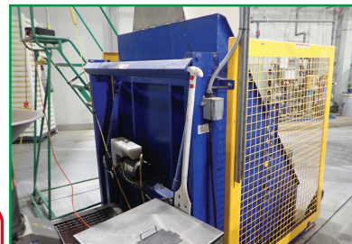
2021 VESTIL PB0-2-60