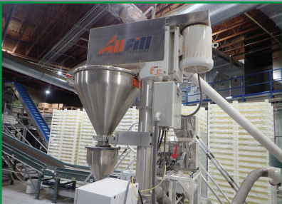
2021 ALLFILL B-600