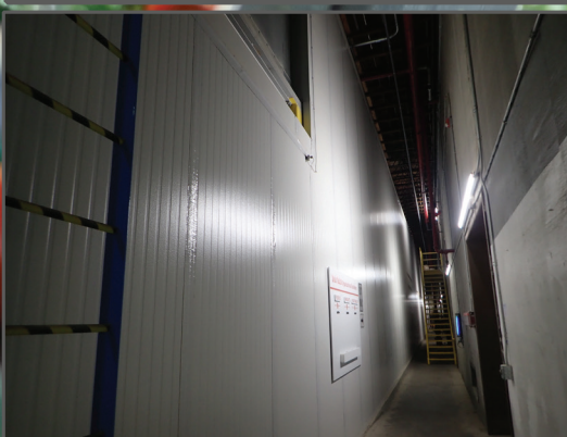
APPROX. 34'X170'X22'H CLIMATE CONTROLLED ROOM