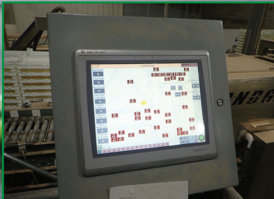
ALLEN BRADLEY PANELVIEW PLUS PLC