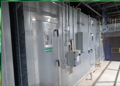
(9) 2021 FLAKT GROUP