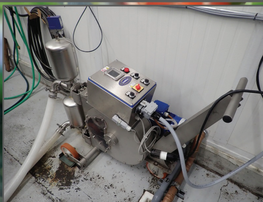
(2) ZAMBELLI ENOTECH ZETA-PE