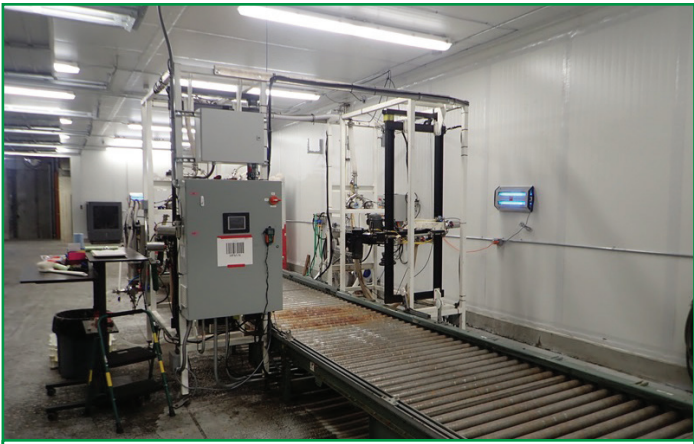
SEMI-AUTO TRAY FILLING STATION