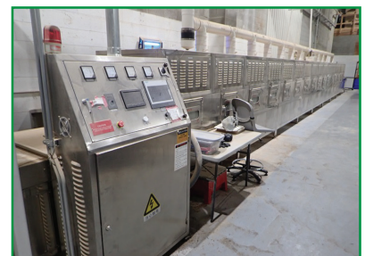
2021 MAX MACHINERY MAXMW-150TC