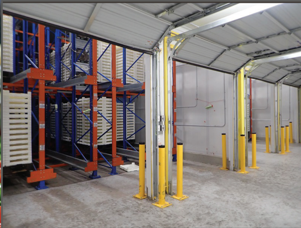
APPROX. 44'X170'X22'H CLIMATE CONTROLLED ROOM

Location: 200 Titchenal Rd, Ste. 1, Cashmere, WA 98815