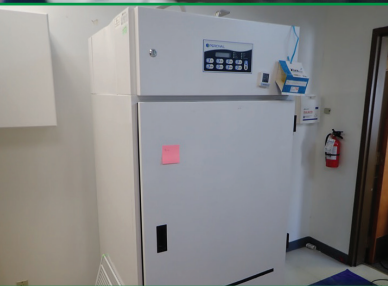
2021 PERCIVAL I36VL