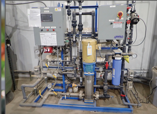
2021 MARLO MR-29K-8H-IL RO SYSTEM