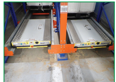
(4) AUTOMHA PALLET RUNNER