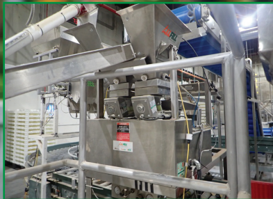
2015 ALLFILL VF210-ST