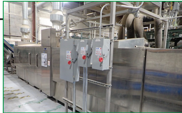
HOBART FT1000SI 28"X32' CONVEYOR WASHER