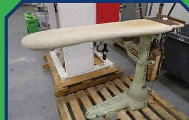
(3) CISELL AR3711