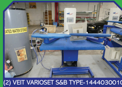
(2) VEIT VARIOSET S&B TYPE-1444030010