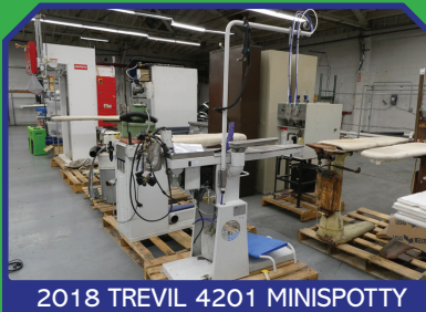
2018 TREVIL 4201 MINISPOTTY