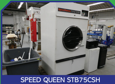
SPEED QUEEN STB75CSH