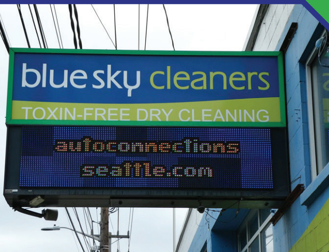
APPROX. 5'X10' DIGITAL EXTERIOR SIGN

1111 ELLIOT AVENUE WEST, SEATTLE, WA 98112