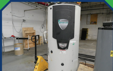
LOCHINVAR SHIELD SNA401125