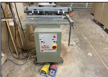
LINA BUSELLARO UNIBOHR 2000

ASSORTED SHOP CARTS, FLAT CARTS, HAND TRUCKS, PALLET RACKING, CANTILEVER MATERIAL RACK, SHOP CABINETS & LAYOUT/ASSEMBLY TABLES