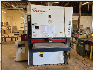
TIME SAVERS SERIES 2300