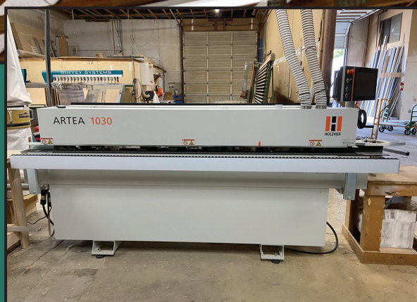
2022 HOLZHER ARTEA KAM1030