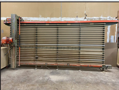
HOLZHER 1265 SUPER CUT