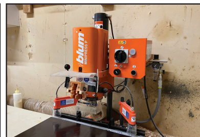
2023 BLUM MINIPRESS P