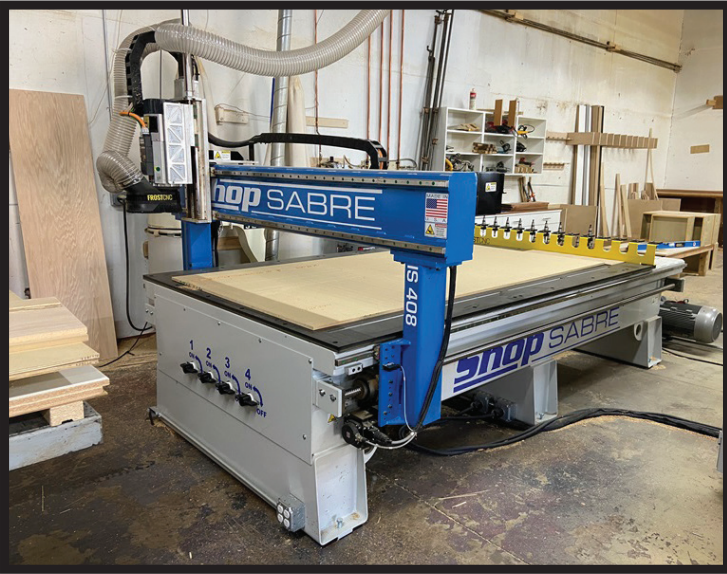
2022 SHOP SABRE IS-408

7105 NE 40TH AVE., STE. E, VANCOUVER, WA 98661