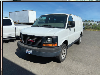
2011 GMC SAVANNA 1500