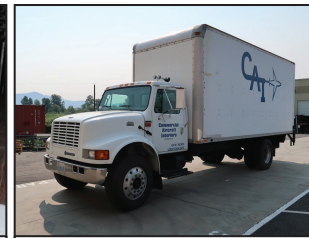
2001 INTERNATIONAL 4700