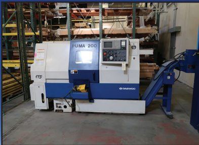
1998 DAEWOO PUMA 200C