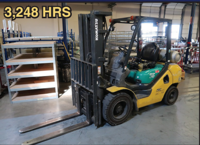
2006 KOMATSU FG30HT-16