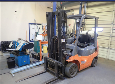
1999 TOYOTA 7FGCU20