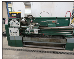
1996 LU-NAN LC400A