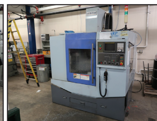
2005 SHARP SV2412