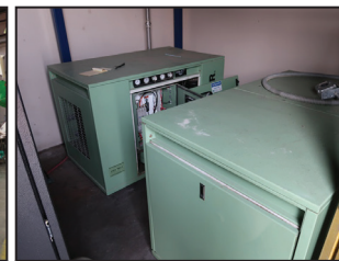
(2) SULLAIR LS-10