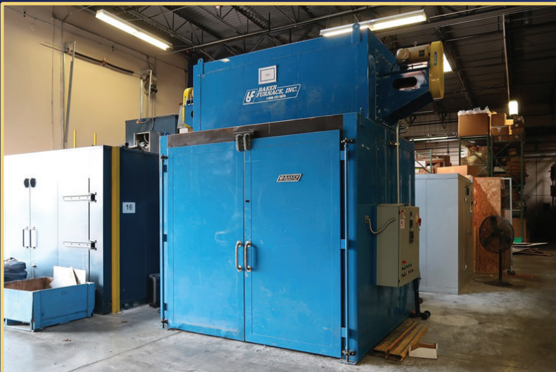
BAKER 8'X8'X8' 500 DEGREE FURNACE

Location: 1600 Port Drive, Burlington, WA 98233