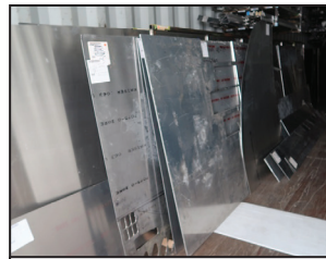
ASSORTMENT OF ALUMINUM SHEETS