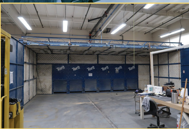
TORIT 12'X36' 3-SIDED DUST COLLECTION BOOTH