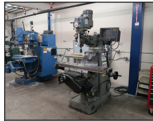
2005 SHARP TMV-MP-2