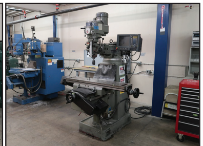
2005 SHARP TMV-MP2