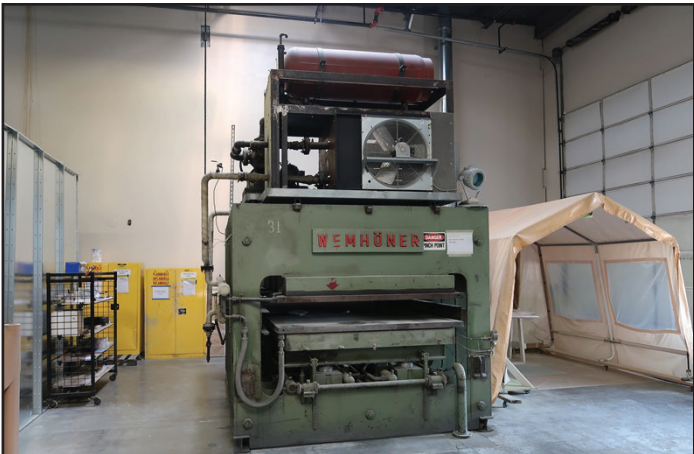
1966 WEMHONER VS2S