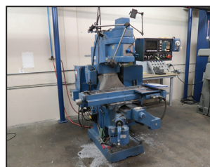
1985 TREE MACHINE TOOL JOURNEYMAN 325