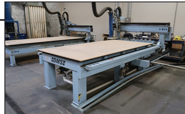
2006 DMS 3B5-5-10-7SL0LXX 5'X10' CNC ROUTER