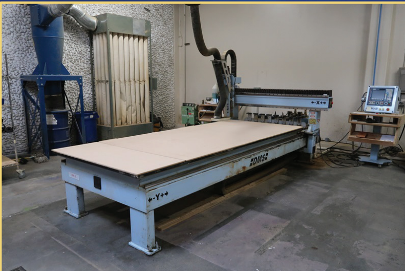
2009 DMS 3B5I-5-12-10SCXLXX 5'X12' CNC ROUTER