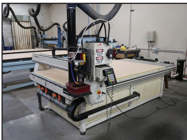
2007 AXYZ 4008

BETCO STEALTH WALK BEHIND FLOOR MACHINE W/CHARGER, HOUR METER READS: 102