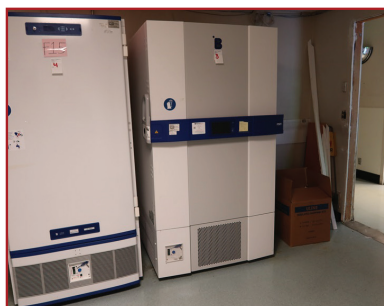
B MEDICAL SYSTEMS F901