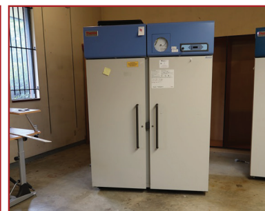
THERMO FISHER SCIENTIFIC REVCO ULT5030A