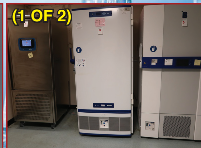
(1-OF 2) B MEDICAL SYSTEMS FR750G