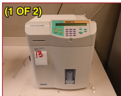
HORIBA MEDICAL ABX MICROS 60 CS