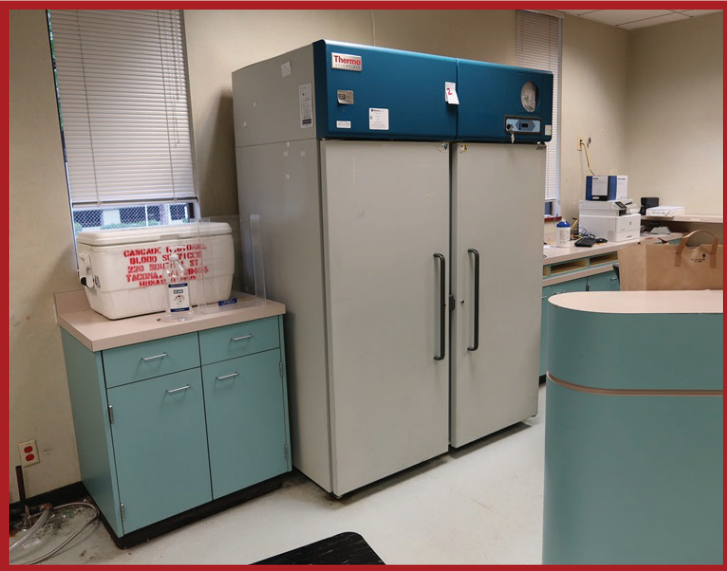
THERMO FISHER SCIENTIFIC JEWETT JPL5030D20