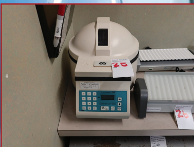
CLAY ADAMS SERO-FUGE