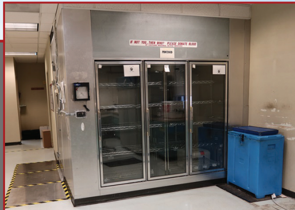
ISOLEC MANUFACTURING CO.