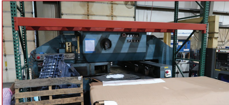
1985 AMADA PEGA-304050 KING