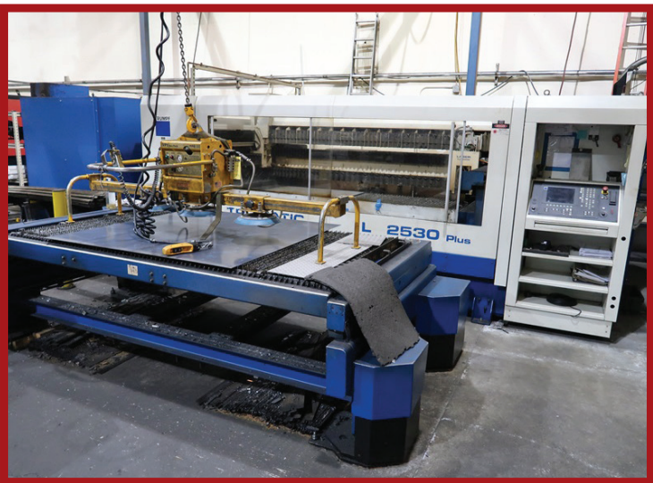
2005 TRUMPF TLF4000

18620 141ST AVENUE NE, SUITE A, WOODINVILLE WA 98072