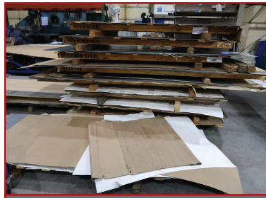
ASSORTED SHEET METAL