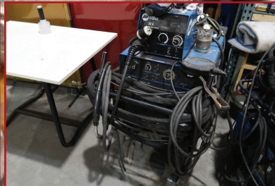
MILLER DIMENSION 302