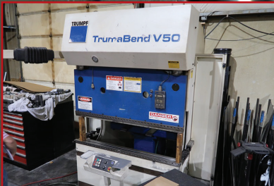
1998 TRUMPF TRUMBEND V50