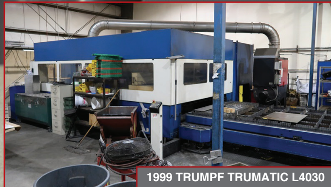
1999 TRUMPF TRUMATIC L4030