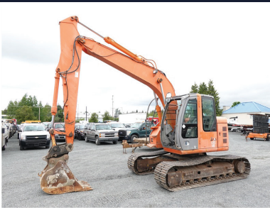
2004 HITACHI ZX135US