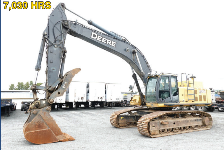
2010 JOHN DEERE 450D LC