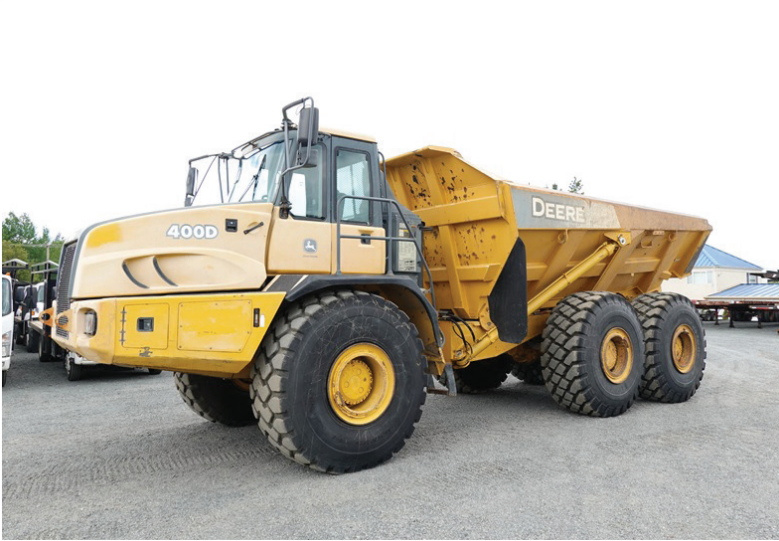
2004 JOHN DEERE 400D