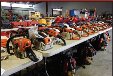
STIHL CHAIN SAWS