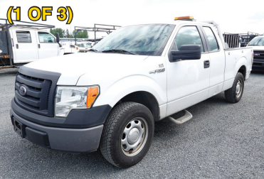
(1 OF 3) 2014 FORD F150