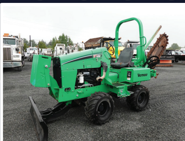
2019 VERMEER RTX450