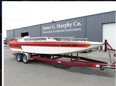
1991 ELIMINATOR 24'