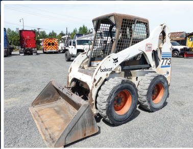
2000 BOBCAT 773