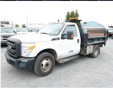
2011 FORD F350