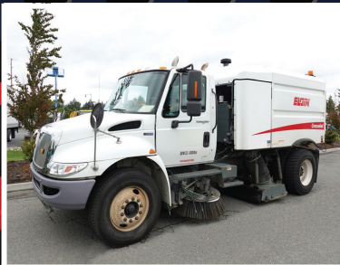
2012 INTERNATIONAL 4300