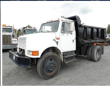
1990 INTERNATIONAL 4900