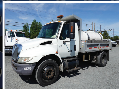
2004 INTERNATIONAL 4300