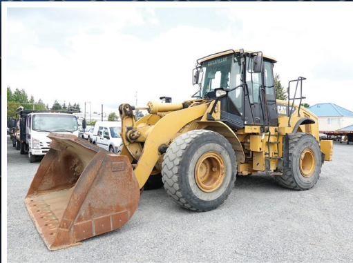
2011 CAT 950H