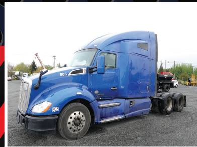
2018 KENWORTH T680

1.800.426.3008 - 425.486.1246 - murphyauction.com