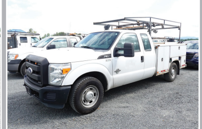
2012 FORD F350