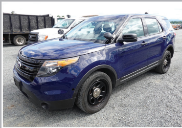
2014 FORD EXPLORER