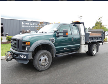
2009 FORD F450