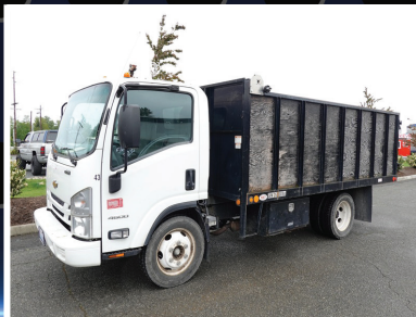
2018 CHEV 4500