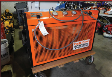
POSEIDON AIR COMPRESSOR