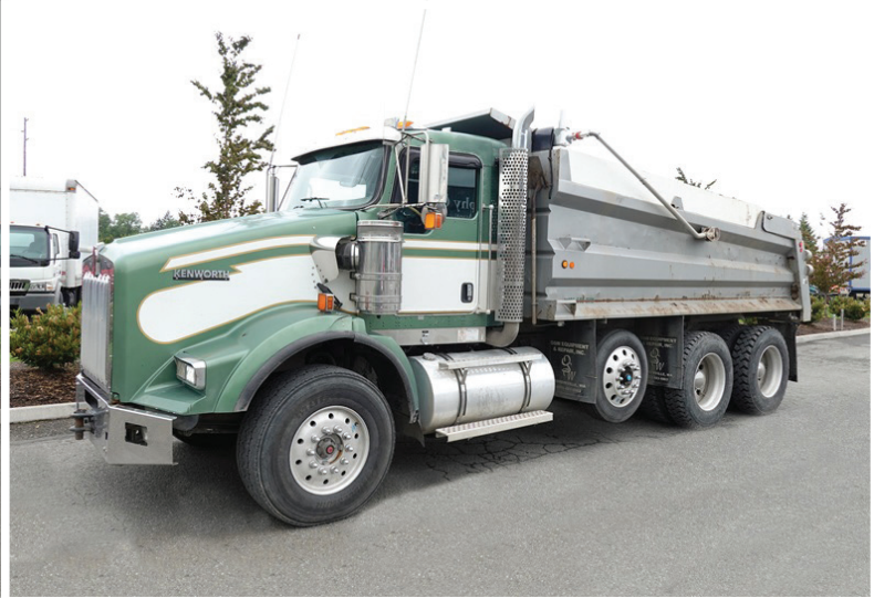
2014 KENWORTH T800