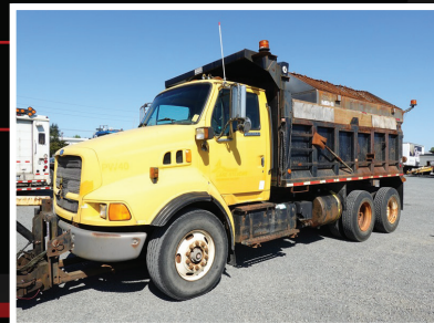
1997 FORD LOUISVILLE