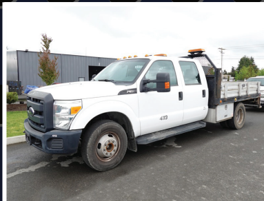
2015 FORD F350