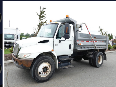
2004 INTERNATIONAL 4400