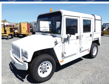
2012 E-RIDE EXV4 TOPPER