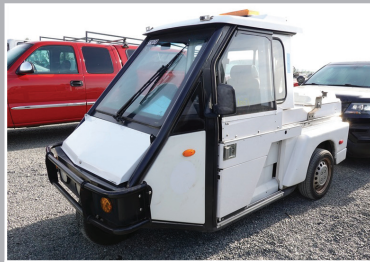
2016 WESTWARD GO4