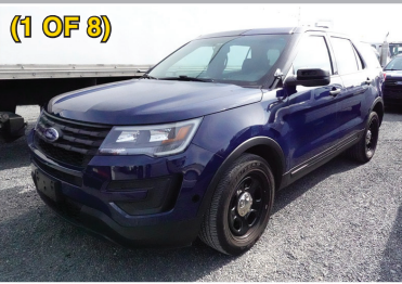
(1 OF 8) 2016 FORD EXPLORER