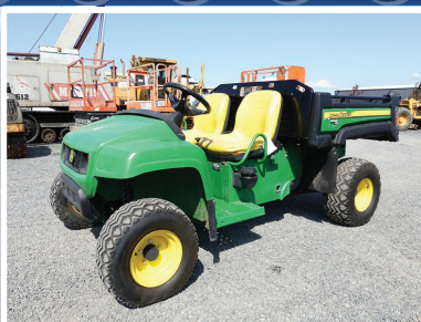
2018 JOHN DEERE TX GATOR