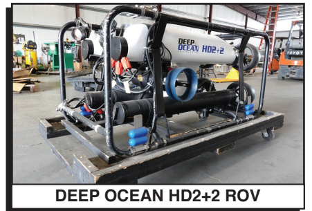
DEEP OCEAN HD2+2 ROV