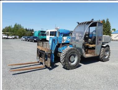
2006 TEREX TX5519