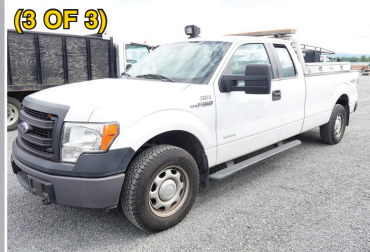
(3 OF 3) 2014 FORD F150