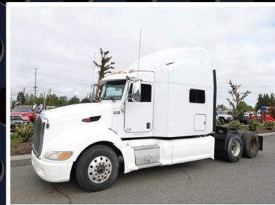
2011 PETERBILT 386