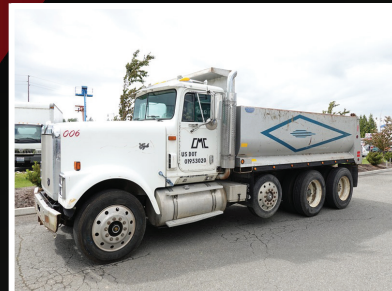
1999 EAGLE 9300