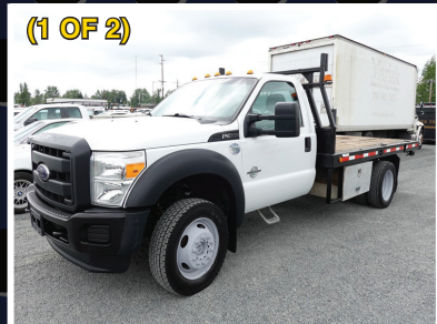
2015 FORD F450