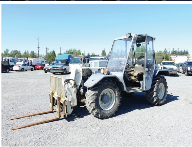
2002 TEREX TX51-19M