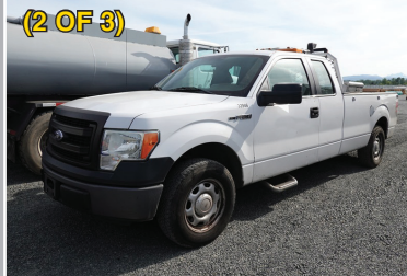
(2 OF 3) 2014 FORD F150