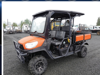
2016 KUBOTA RTV-X1140