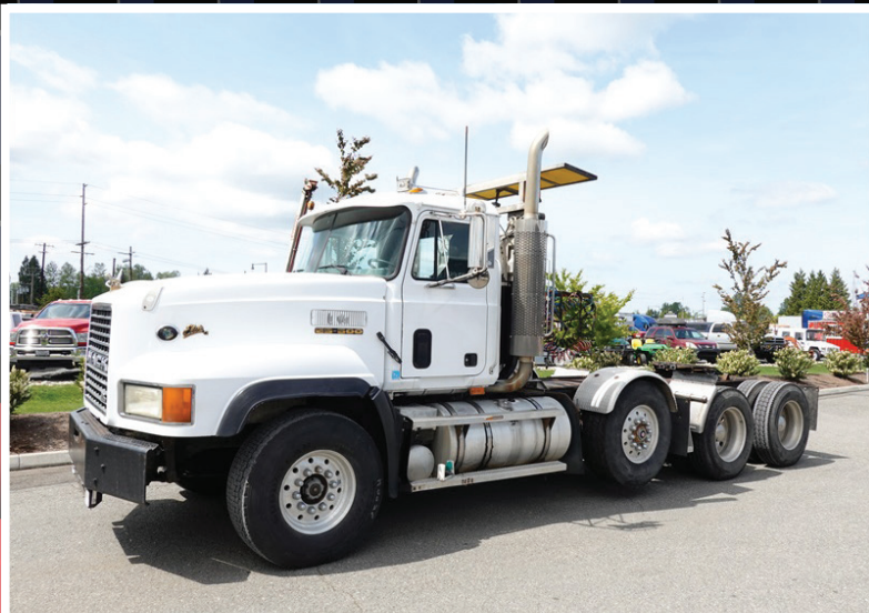
1996 MACK CL713