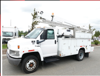
2003 CHEV C4500