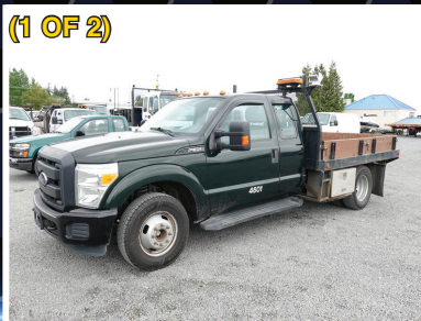
2015 FORD F350