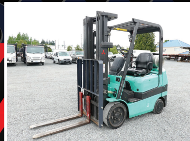
2002 MITSUBISHI FGC25K

1.800.426.3008 - 425.486.1246 - murphyauction.com