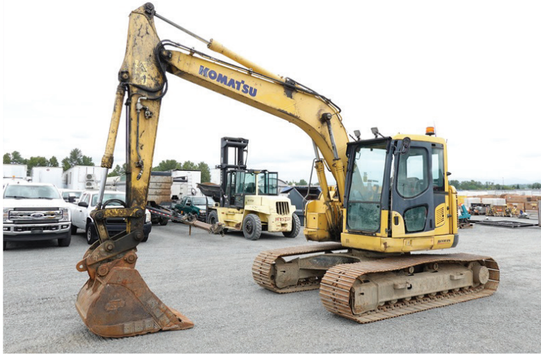
2011 KOMATSU PC138USLC-8