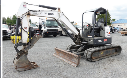
2018 BOBCAT E45