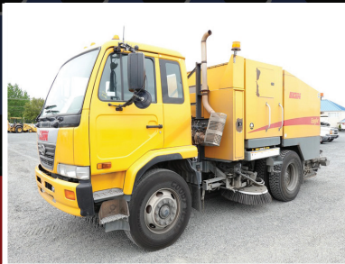
2009 UD ELGIN EAGLE SERIES F