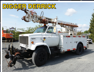
1985 GMC TOPKICK 7000