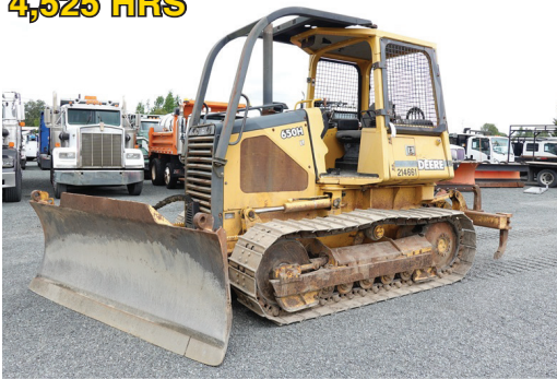
2001 JOHN DEERE 650H LT