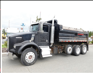
1992 KENWORTH T800