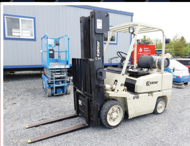
2010 KALMAR C50