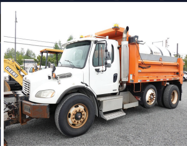
2007 FREIGHTLINER M2