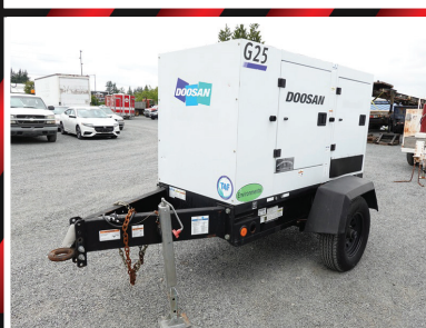
2018 DOOSAN G25WDO-TAF