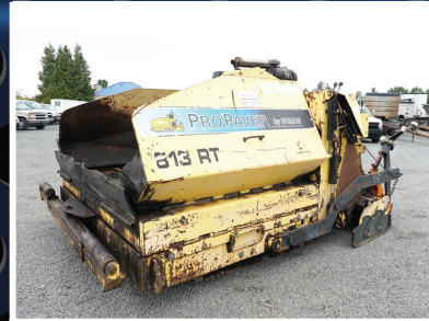
2005 BOMAG 813RT