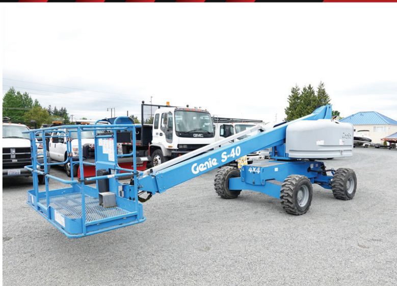
2016 GENIE S-40