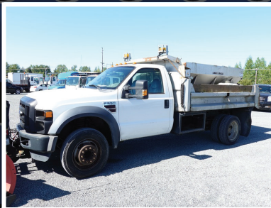
2009 FORD F550