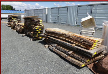
ASSORTED LIVE EDGE