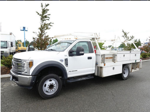
2019 FORD F450