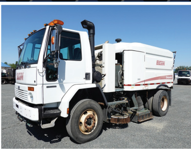
2005 STERLING SC8000