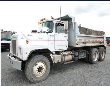
1979 MACK RS600L