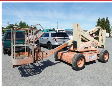
1996 JLG 35