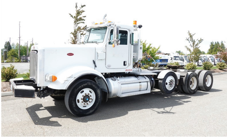
2013 PETERBILT 367