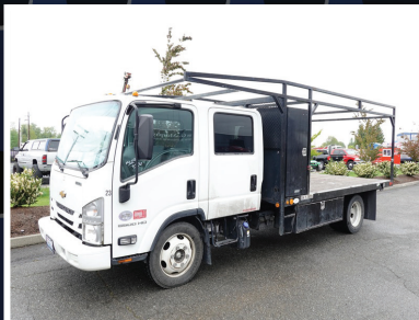
2017 CHEV 5500