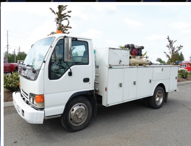
2003 ISUZU NQR