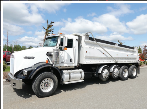
2007 KENWORTH T800B