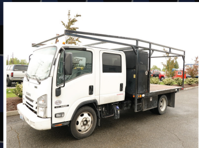
2017 CHEV NQR