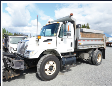
2006 INTERNATIONAL 7400