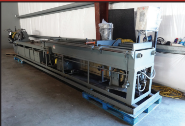
TUBE HONING MACHINE