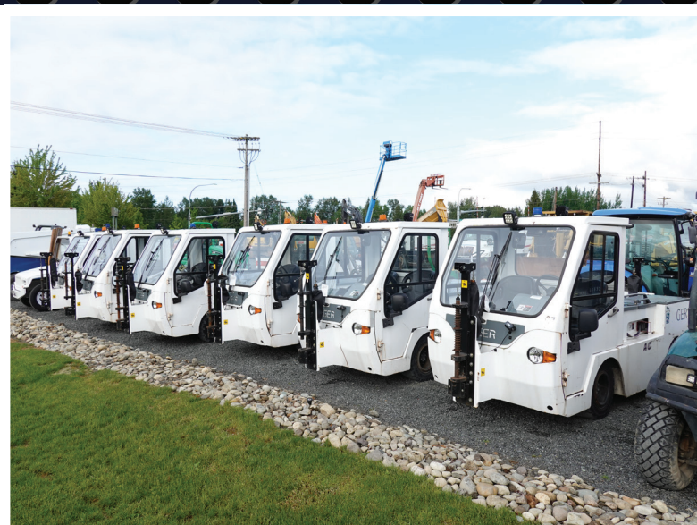
(6) TAYLOR DUNN CO-T50-80