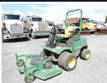
2003 JOHN DEERE 1445