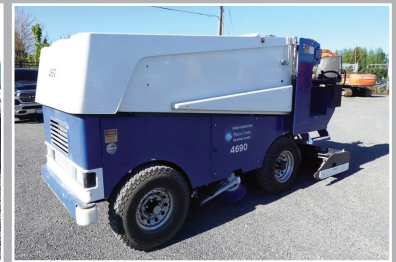
2004 ZAMBONI 540