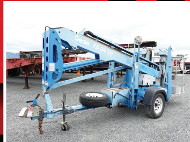
2005 GENIE TZ-34