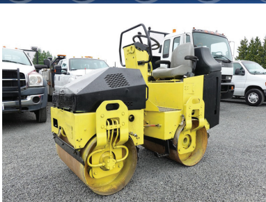
2006 BOMAG BW 900-2