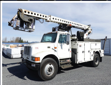
1997 INTERNATIONAL 4900