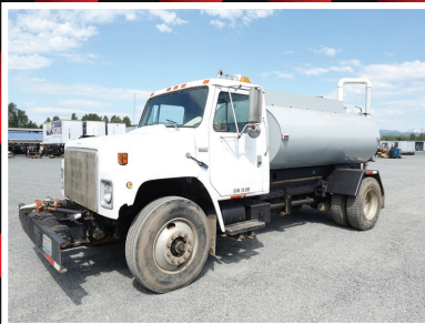
1982 INTERNATIONAL S1900