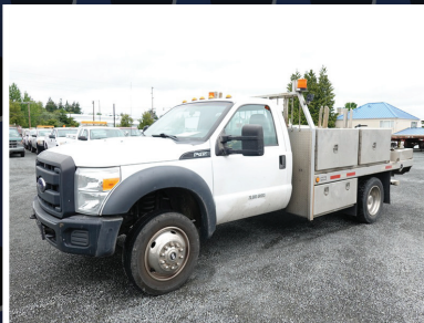
2015 FORD F450