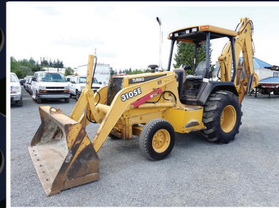
2000 JOHN DEERE 310SE 2WD