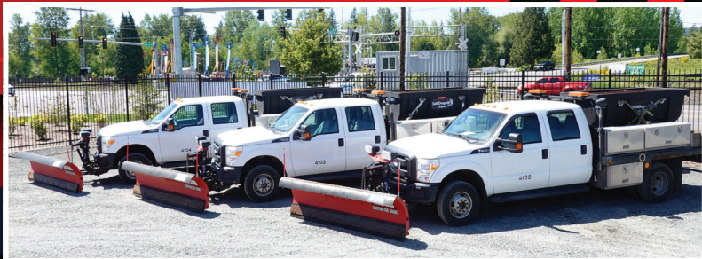
(3) 2015 FORD F350'S