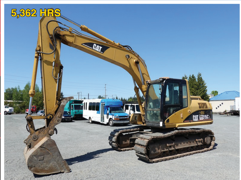
2004 CAT 315C L