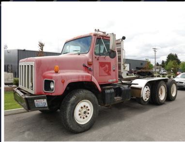
1993 INTERNATIONAL 2674