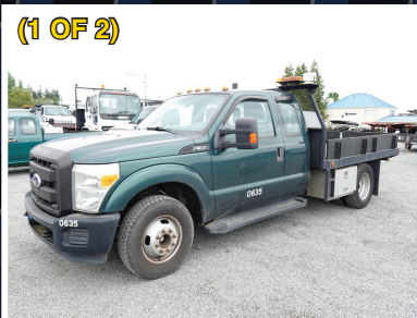
2011 FORD F350