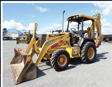
2000 JOHN DEERE 310SE 4WD