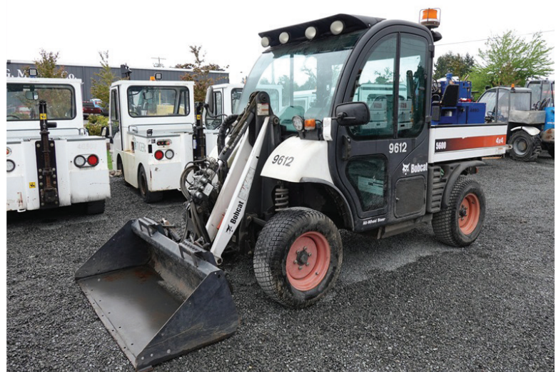
2009 BOBCAT 5600