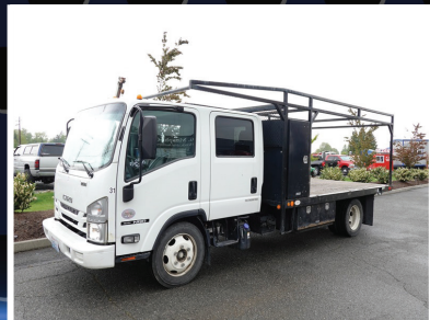
2018 ISUZU NQR