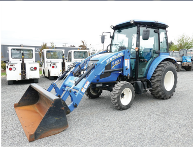
2016 NEW HOLLAND BOOMER 37