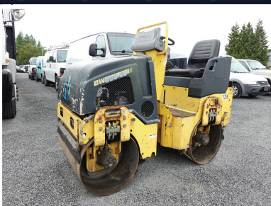
2015 BOMAG BW 900-50