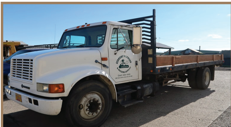
1999 INTERNATIONAL 4900