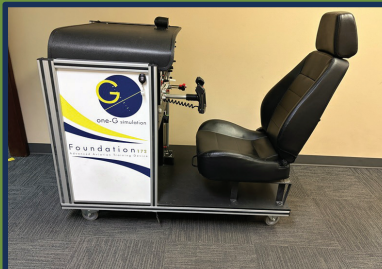
ONE-G SIMULATION FOUNDATION 172