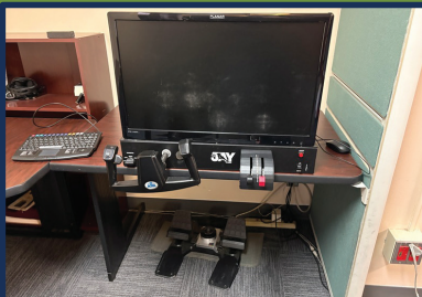
REDBIRD FLIGHT SIMULATIONS "THE JAY"