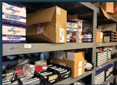
CESSNA & DIAMOND PARTS