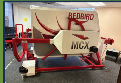
REDBIRD FLIGHT SIMULATIONS MCX