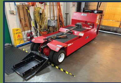
2020 LEXTRO 2020-AP8600A-62