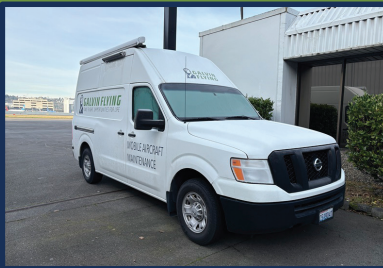
2019 NISSAN NV2500HD