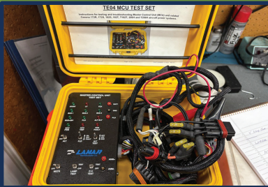
2021 LAMAR TE04 MCU