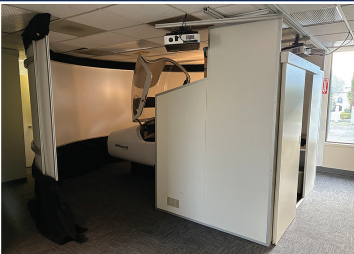
2008 DIAMOND DA42 TWINSTARS FLIGHT TRAINING DEVICE