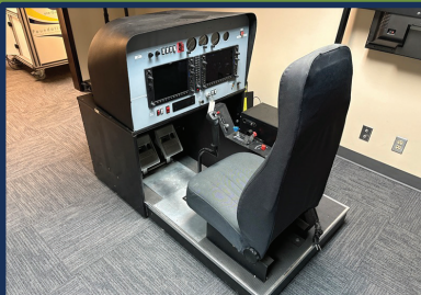
2007 FRASCA INT'L MENTOR