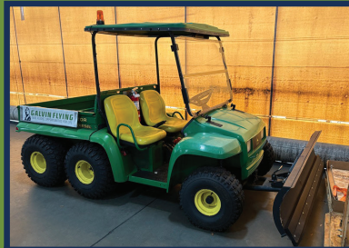
JOHN DEERE GATOR TH 6X4