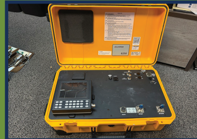
LAVERSAB 625-W REV.A2