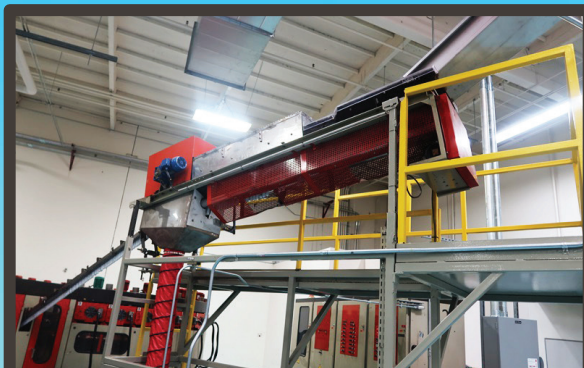
(2) 9' GRAVITY FEED POWER BOTTLE BLANK SINGULATOR