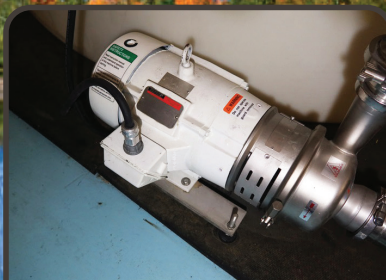
(2) RELIANCE ELECTRIC P21G3861C