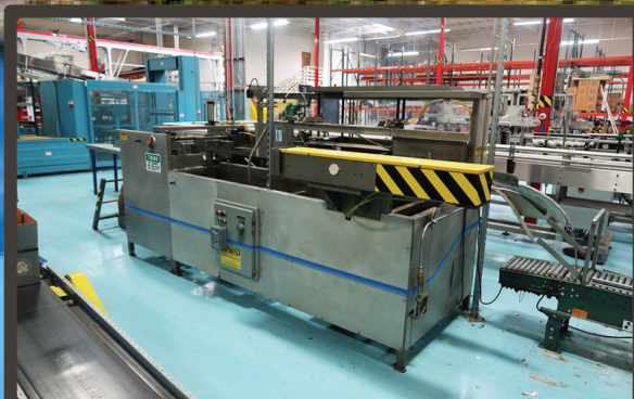
A-B-C PACKAGING MACHINE CORP.130