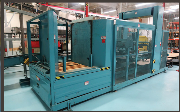
BON GAL LOPAL-MKII-4840-LH-SEP