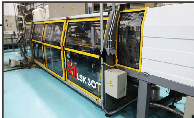
SMI LSK 30T