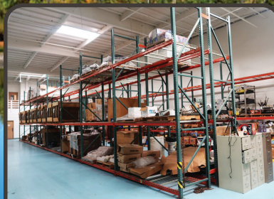
(35) SECTIONS OF 16' PALLET RACKING

FOR MORE INFORMATION GO TO MURPHYAUCTION.COM • PHONE 425.486.1246