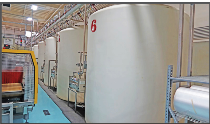
(6) NORWEST CO.