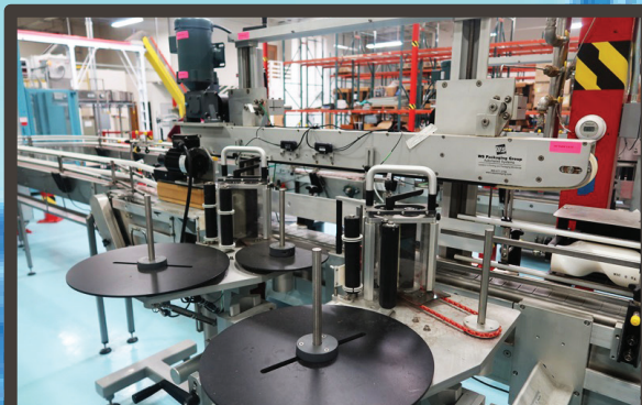
(2) WS PACKAGING GROUP JN57030-1