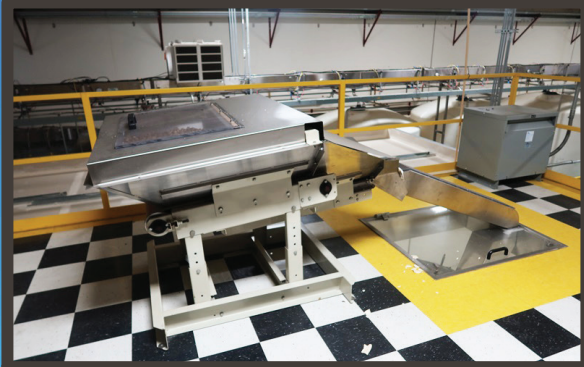
HOPPMANN WB SERIES 6