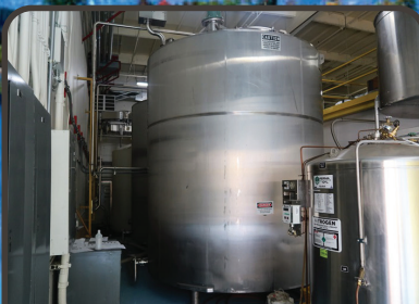
(2) CHERRY BURRELL