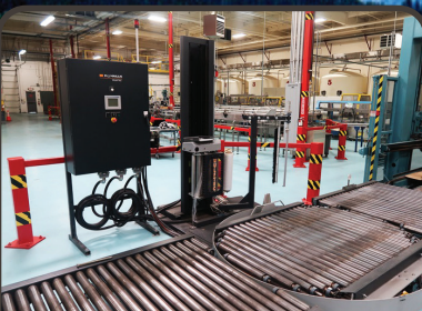
M.J MAILLIS WULFTEC WCA-150