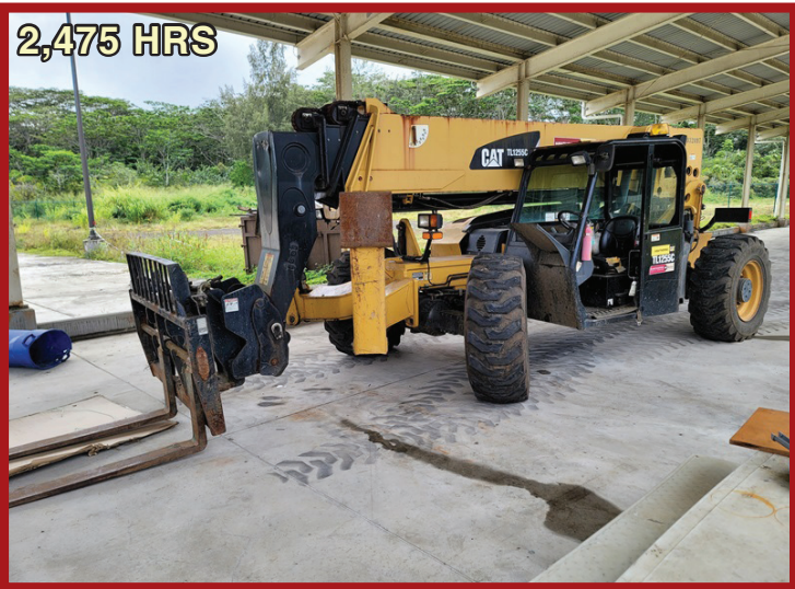
2013 CAT TL1255C