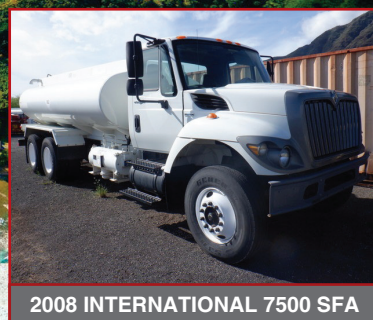
2008 INTERNATIONAL 7500 SFA