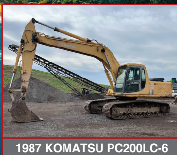
1987 KOMATSU PC200LC-6