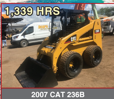
2007 CAT 236B