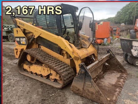
2017 CAT 289D