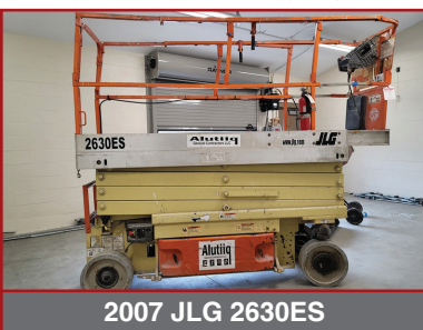
2007 JLG 2630ES

COMPLETE TERMS AND CONDITIONS OF SALE WILL BE AVAILABLE AT THE TIME OF SALE.