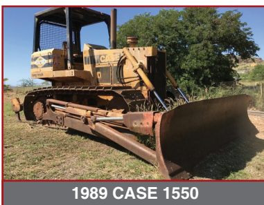
1989 CASE 1550

MURPHYAUCTION.COM FOR ADDITIONAL INFORMATION