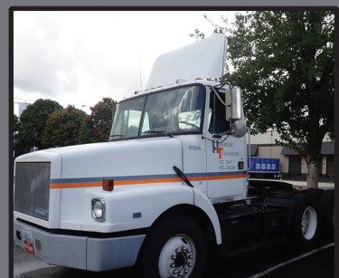
1992 WHITE WG64T