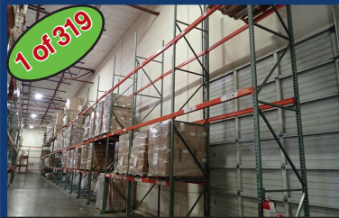
SECTIONS OF PALLET RACKING