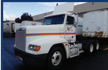
1997 FREIGHTLINER FLD