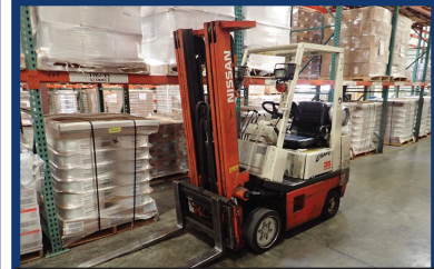
1995 NISSAN 3500