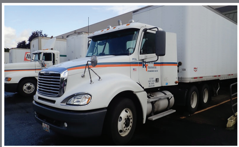
2007 FREIGHTLINER COLUMBIA