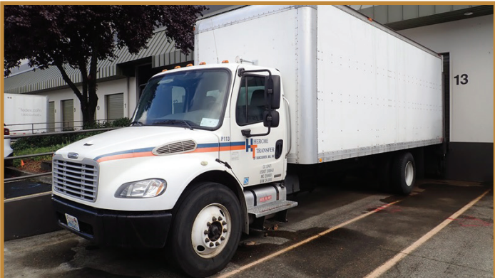
2005 FREIGHTLINER BUSINESS CLASS M2

INVENTORY AT AUCTION SUBJECT TO LOCATION CHANGE PLEASE SEE CATALOG FOR FINAL LOCATIONS