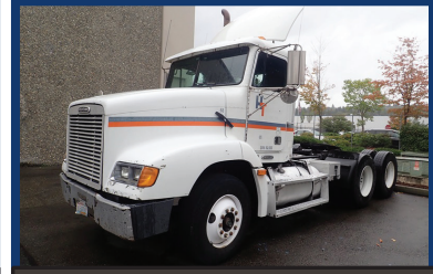
1997 FREIGHTLINER FLD