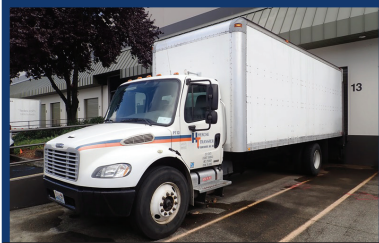
2005 FREIGHTLINER BUSINESS CLASS M2