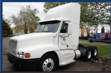
1998 FREIGHTLINER CENTURY