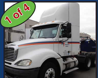
2006 FREIGHTLINER COLUMBIA