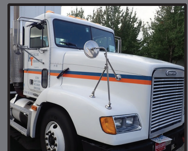
2000 FREIGHTLINER FLD