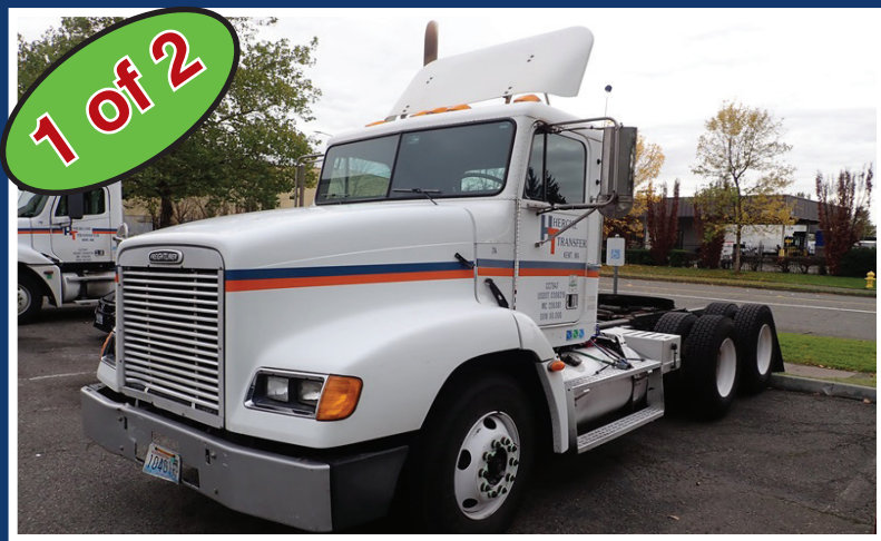
2000 FREIGHTLINER FLD

10:00 AM | Wed - November 6 Preview 8AM to 10AM | Wed, November 6 603 SE Assembly Ave., Ste B, Vancouver, WA 98661