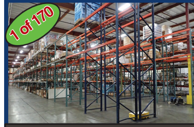
8'x17' SECTIONS OF PALLET RACKING