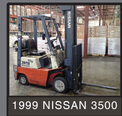
1999 NISSAN 3500