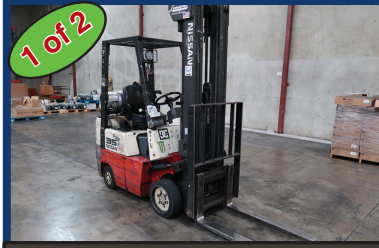
2001 NISSAN 3500