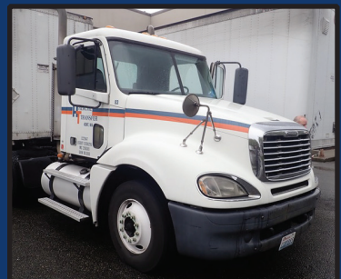
2007 FREIGHTLINER COLUMBIA