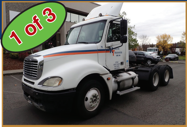
2005 FREIGHTLINER COLUMBIA

James G. Murphy Co. Commercial & Industrial Auctioneers