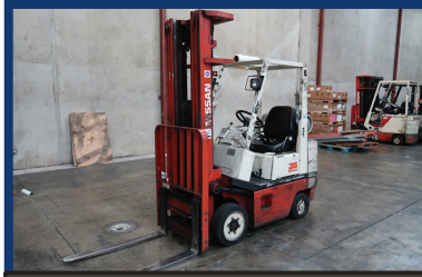
1990 NISSAN 3500