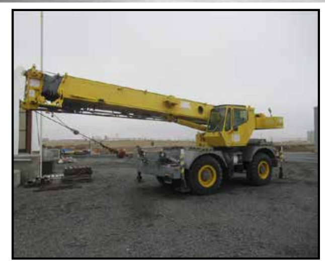
James G. Murphy Co. Commercial & Industrial Auctioneers P.O. Box 82160, Kenmore, WA 98028