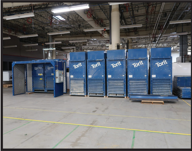
DONALDSON TORIT DWS 4