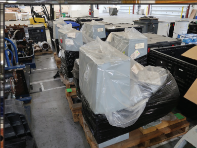
(6) MARATHON ELECTRIC 432RSL4015