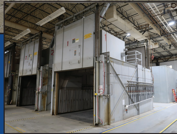
DISPATCH INDUSTRIES PSD 4-20S