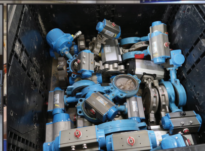
(20+) VALBIA BUNOMI