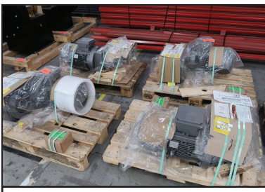
(4) NORD 160MP/4CU5TW