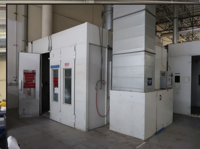
1999 BLOWTHERM 2000B