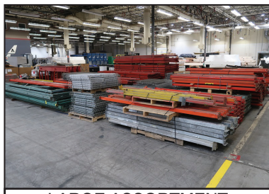
LARGE ASSORTMENT OF PALLET RACKING