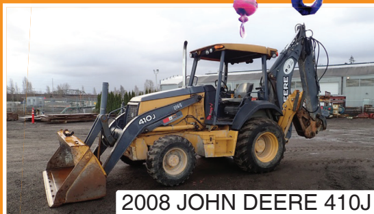
2008 JOHN DEERE 410J

65 TON, 36'-111' 4-SECTION BOOM R.T. CRANES, CUMMINS, AUX. WINCH, ANTI 2-BLOCK ROOSTER SHEAVE, 29.25 TIRES, 28 PLY, GREER RCI 510 SYSTEM, 5 SHEAVE HOOK BLOCK, & SPARE TIRE