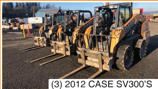
(3) 2012 CASE SV300'S