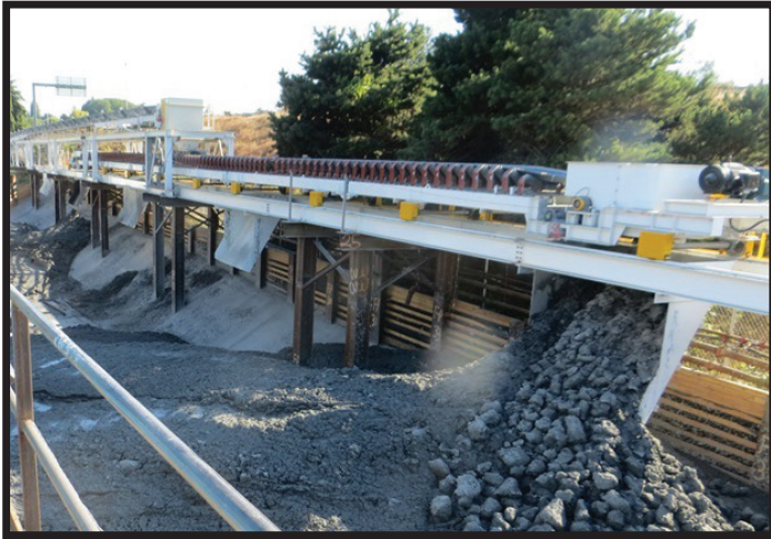
SYSTEM IS DISASSEMBLED ROBBINS/AFFHOLDER CC09000 CONVEYOR SHUTTLE SYSTEM

17 E. MARINE VIEW DR., EVERETT, WA 98201