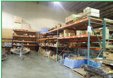
(22) SECTIONS OF PALLET RACKING