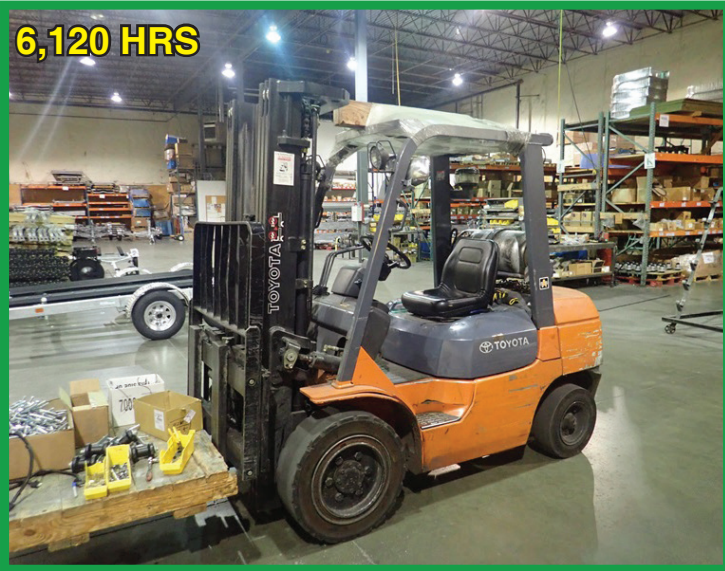
2003 TOYOTA 7FGU30