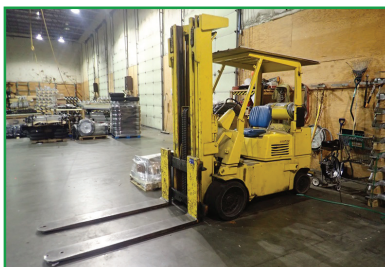
HYSTER 12,000LB CAP. FORKLIFT