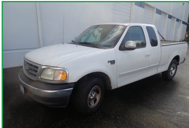
2002 FORD F150 XLT