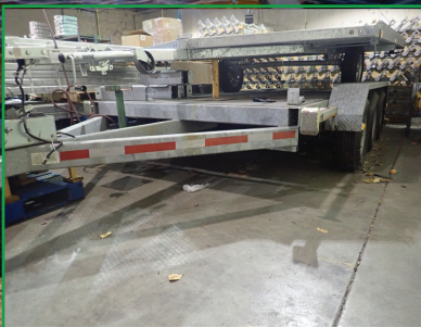
KING 80"X13'TRI/A TRAILER