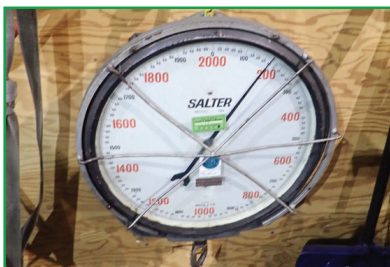
SALTER HANGING SCALE