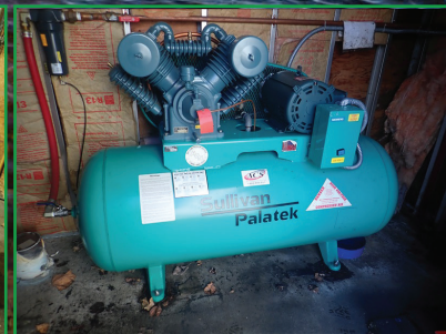
SULLIVAN PALATEK SPHT-755-120