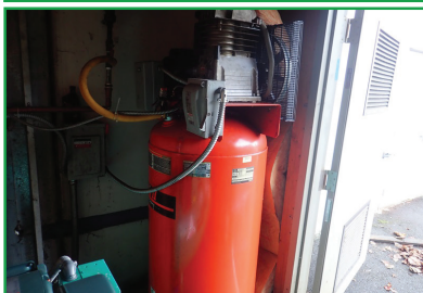
DEVILBISS PROAIR II