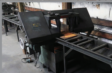
METAL CUTTING BANDSAW