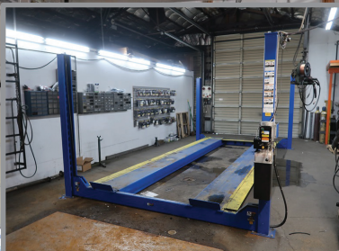
ROTARY AR/AR014 SM14/SM014