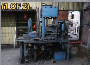
CUSTOM BUILT IRON WORKER