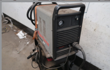
HYPERTHERM POWERMAX 600