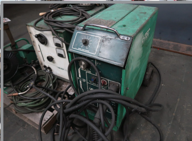
L-TEC MIGMASTER 250