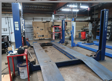
2008 BEND PAK HD-18