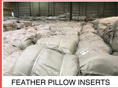
FEATHER PILLOW INSERTS