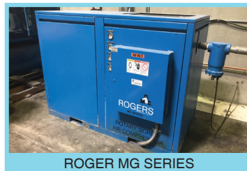
ROGER MG SERIES