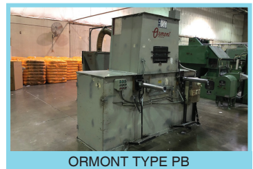
ORMONT TYPE PB