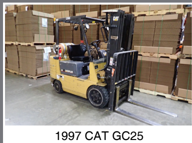
1997 CAT GC25