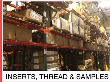
INSERTS, THREAD & SAMPLES