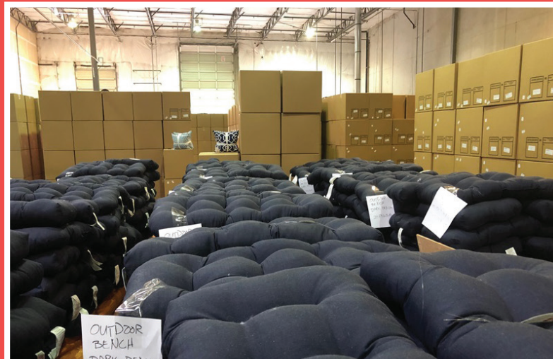
LARGE ASSORTMENT OF PILLOWS