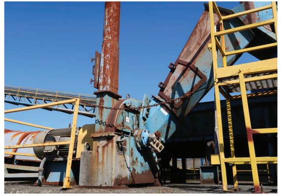
PRECISION TRUE SLICE SIZE 38-09

APPROX. 32' POWERED HOURGLASS ROLLCASE (INFEED TO DEBARKER) W/(13) 36" HOURGLASS ROLLS, HOLD DOWN ARM, MOTOR TO SHAFT MOUNTED REDUCER, ALLEN BRADLEY VFD