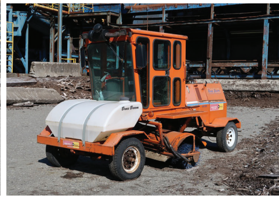
BROCE BROOM CR350

13% BUYERS PREMIUM ON ALL PURCHASES - PAYMENT: FULL PAYMENT MUST BE MADE BY 5 PM, JUNE 29TH. REMOVAL: ALL ITEMS MUST BE REMOVED NO LATER THAN 4:00 PM, AUGUST 24TH. REMOVAL HOURS: 8:00 AM – 4:00 PM, NO WEEKEND REMOVAL. WARRANTY DISCLAIMER: ALL SALES ARE FINAL. ALL ITEMS ARE BEING SOLD "AS IS, WHERE IS," WITH ALL FAULTS AND WITHOUT ANY WARRANTIES AS TO MERCHANTABILITY. COMPLETE TERMS AND CONDITIONS OF SALE WILL BE AVAILABLE AT THE TIME OF SALE.