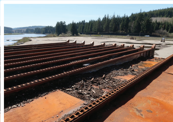
APPROX. 42' SPLIT INFEED LOG DECK