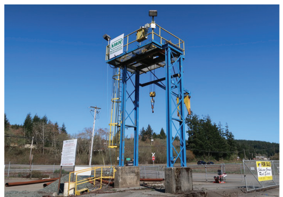
15,000 LB. CAPACITY TRAILER LOADER