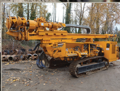
2011 DAVEY DRILL DK725