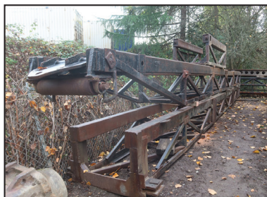
PILE DRIVING LEADS