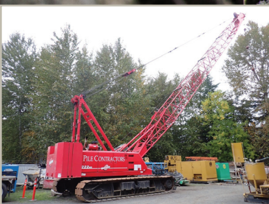
1994 MANITOWOC 222HD