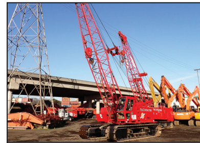
1990 MANITOWOC M80W