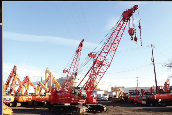
2012 MANITOWOC 11000-1