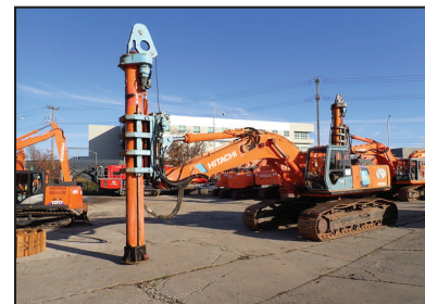
LO-DRILL RIG LO-DRILL LLMH-TFB-80