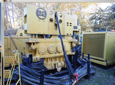
1997 APE 200