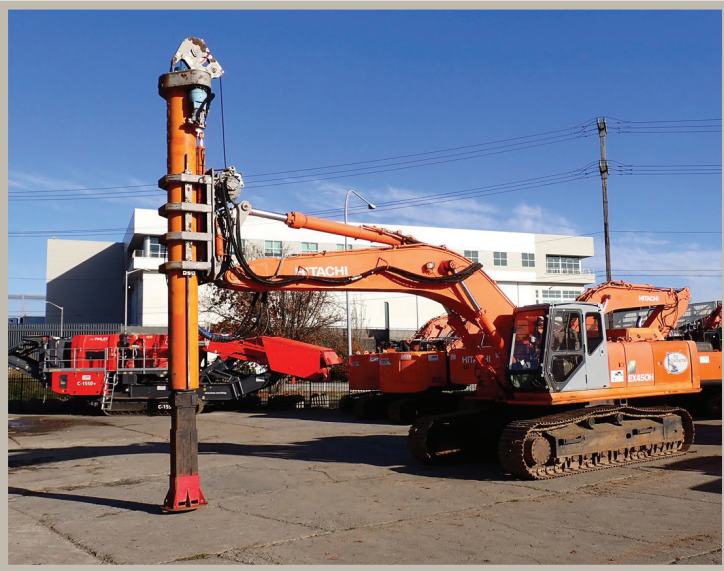
LO-DRILL RIG LO-DRILL LLMH-TFB-80 80' DRILLING DEPTH