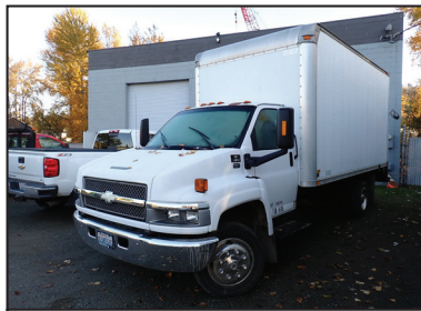
2005 CHEV C4500