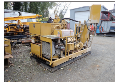
CHEM ROUT COLLOIDAL CG-6880