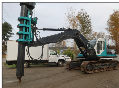
LO-DRILL RIG LO-DRILL LLM-60