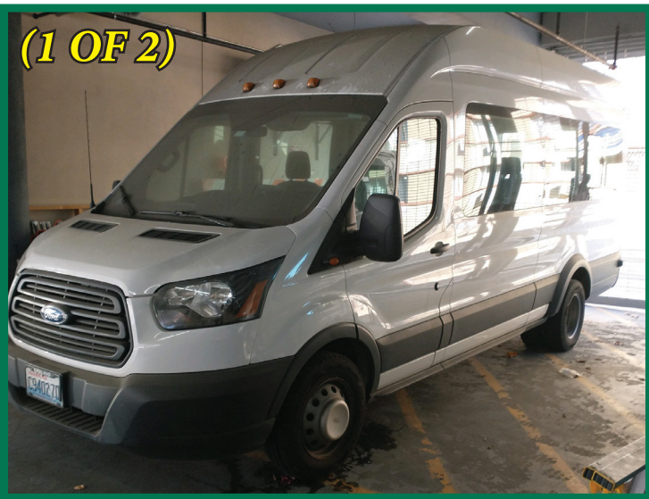
2015 FORD TRANSIT 350HD ECOBOOST