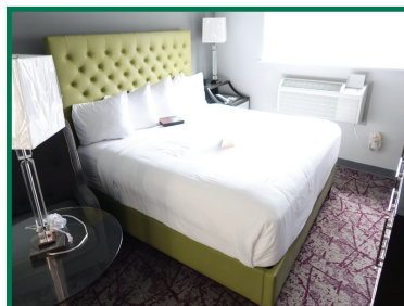
(70+) UNUSED FURNISHED ROOMS