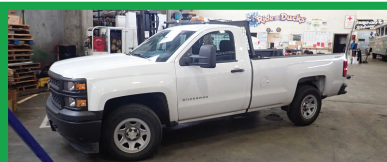
2014 CHEVROLET SILVERADO 1500