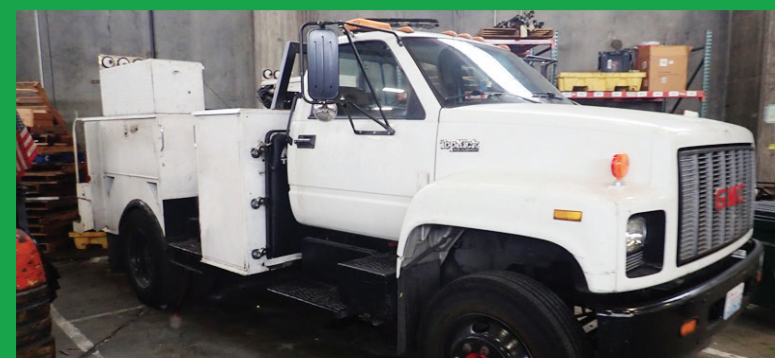
1993 GMC TOPKICK

COMPLETE TERMS AND CONDITIONS OF SALE WILL BE AVAILABLE AT THE TIME OF SALE.