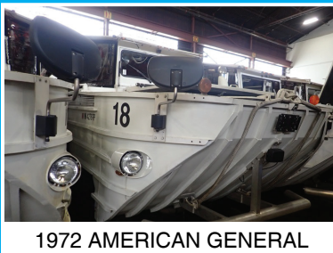
1972 AMERICAN GENERAL