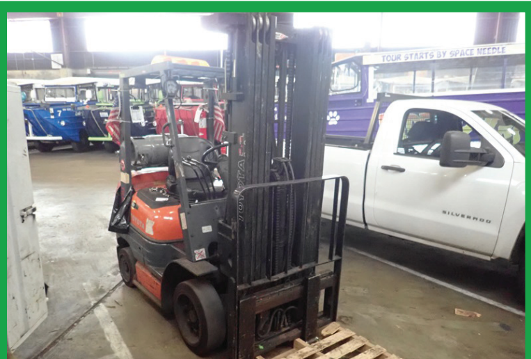
1999 TOYOTA 42-6FGCU25