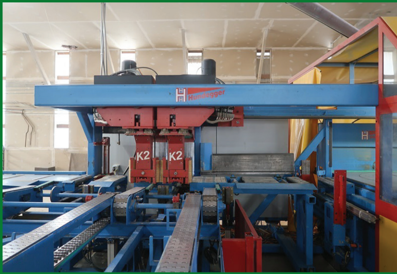
2006 HUNDEGGER K2-5 LOG JOINERY MACHINE

EQUIPMENT & ROLLING STOCK START DATE: 10AM | MARCH 17 END DATE: 10AM | MARCH 24