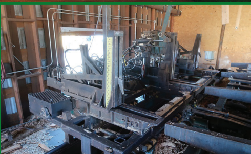
HELLE APPROX 36"X14' 3-KNEE CARRIAGE