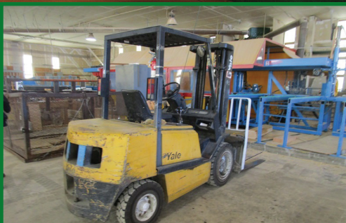
2000 YALE GP060TGE86