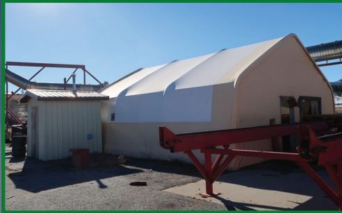
APPROX 14'X25'X30' PORTABLE BUILDING