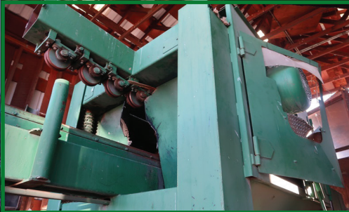
PENDU KD20 LOG CANTER