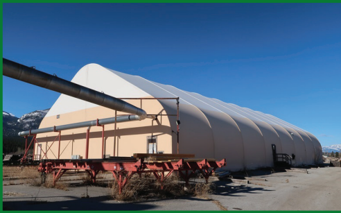
COVER-ALL 40'X80'X180' PORTABLE BUILDING