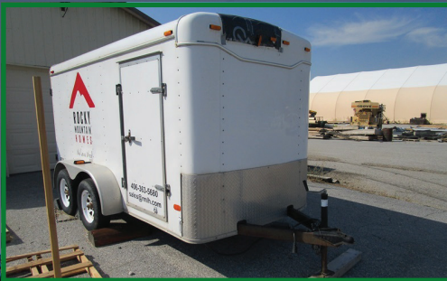
2002 HAULMARK GC6XDT2