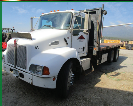
2005 KENWORTH T300