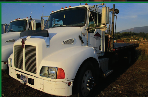
2003 KENWORTH T300