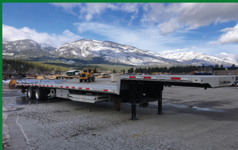
2013 TRANSCRAFT DTL-2100