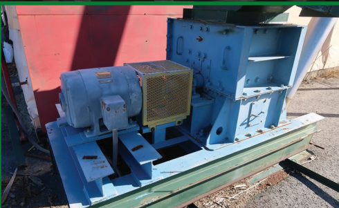
JEFFREY 30AB HAMMER MILL