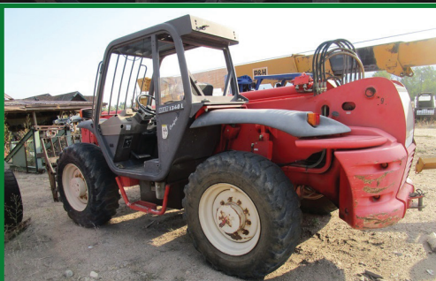
2001 MANITOU 1340L