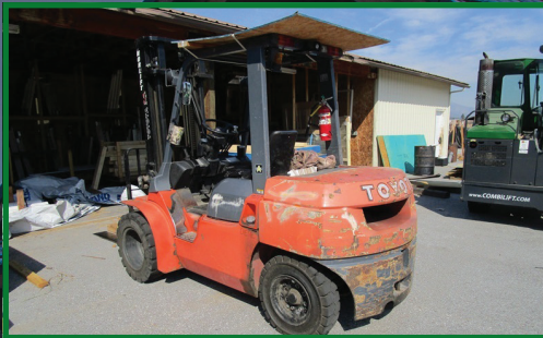
2007 TOYOTA 7FDU35