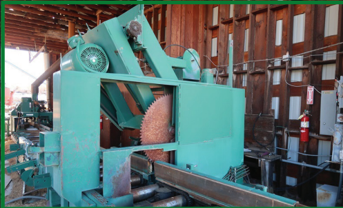
1986 PENDU 2400 TIMBER CUT OFF SAW