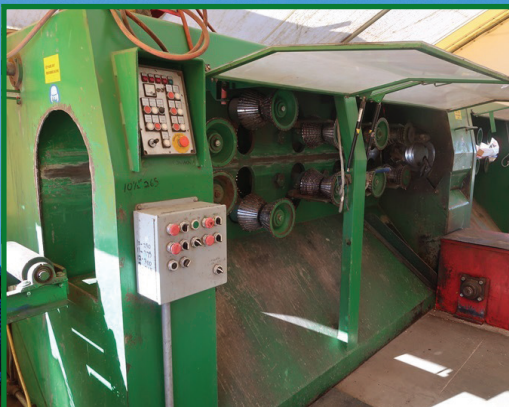
2002 BEZNER RF-160-380-6MK LOG ROUNDING MACHINE