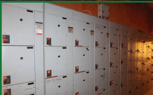
GE SPECTRA SERIES 12-SECTION MCC