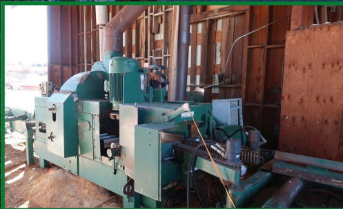
1986 PENDU 9500 GANG SAW