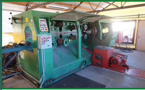
2002 BENZER CP300 LOG ROUNDING MACHINE