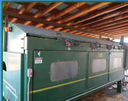
2005 PENDU LOG HEWING MACHINE