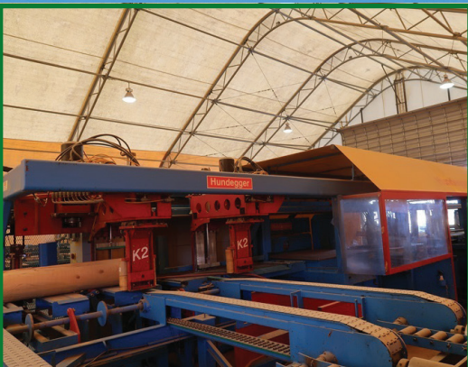
2002 HUNDEGGER K2-5 LOG JOINERY MACHINE

Location: 1883 Hwy 93 S., Hamilton, MT 59840