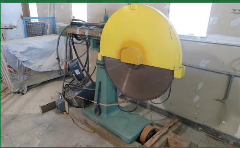
GRUTTER 2011 32" FLYING CUT OFF SAW