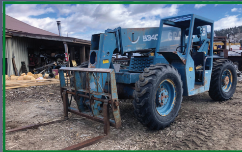
1991 GRADALL 534C-6