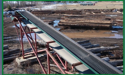
(2) MORBARK CONVEYORS