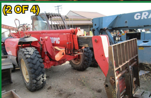
2000 MANITOU 1340L