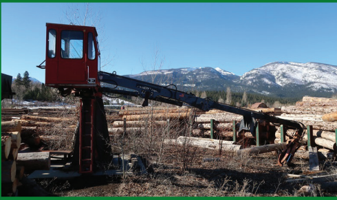
(2) PRENTICE 120BC HYDRAULIC OPERATED PEDESTAL MOUNTED LOADERS