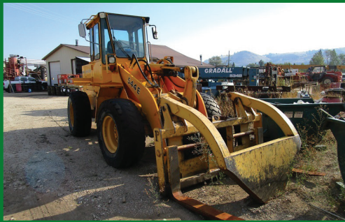
1992 JOHN DEERE 544E