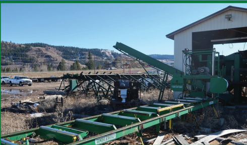
TIMBERWOLF APPROX 48"X20' HORIZONTAL BAND TRAVELING SAWMILL