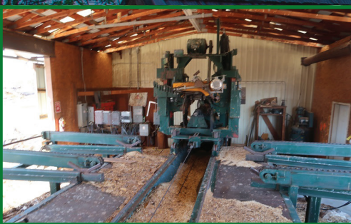
CUSTOM BUILT APPROX 20'X26' LOG TURNING LATHE