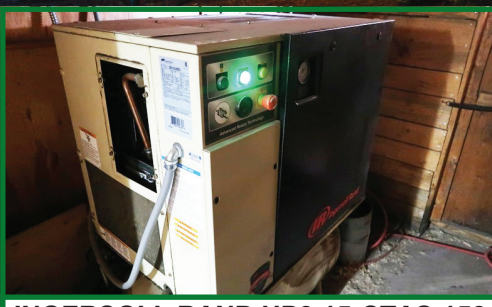
INGERSOLL RAND UP6-15-CTAS-150 15HP VARIABLE SPEED ROTARY AIR COMPRESSOR