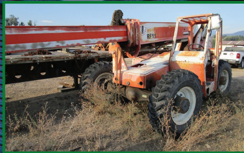
(2) 1996 SKYTRACK 8042