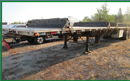
2003 WESTERN ELITE