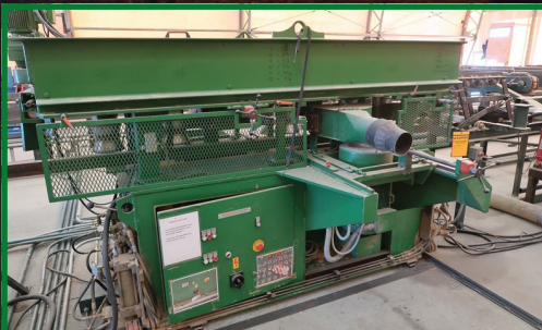
(2) CUSTOM BUILT LOG COPING MACHINES