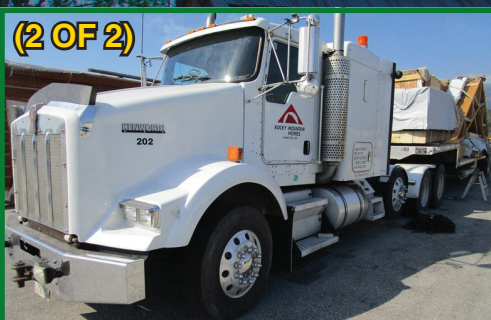
2004 KENWORTH T800