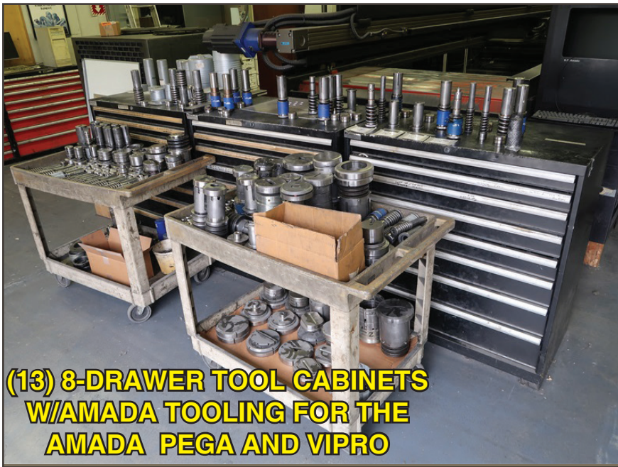
(13) 8-DRAWER TOOL CABINETS W/AMADA TOOLING FOR THE AMADA PEGA AND VIPRO