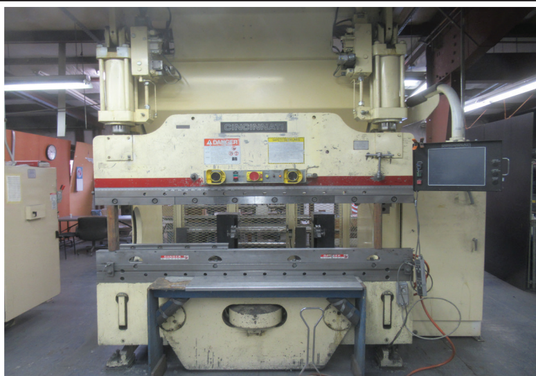
CINCINNATI AUTOFORM 90-TON HYDRAULIC PRESS BREAK