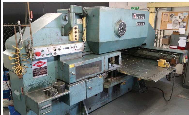
1985 AMADA PEGA-30405 KING 30-TON TURRET PUNCH