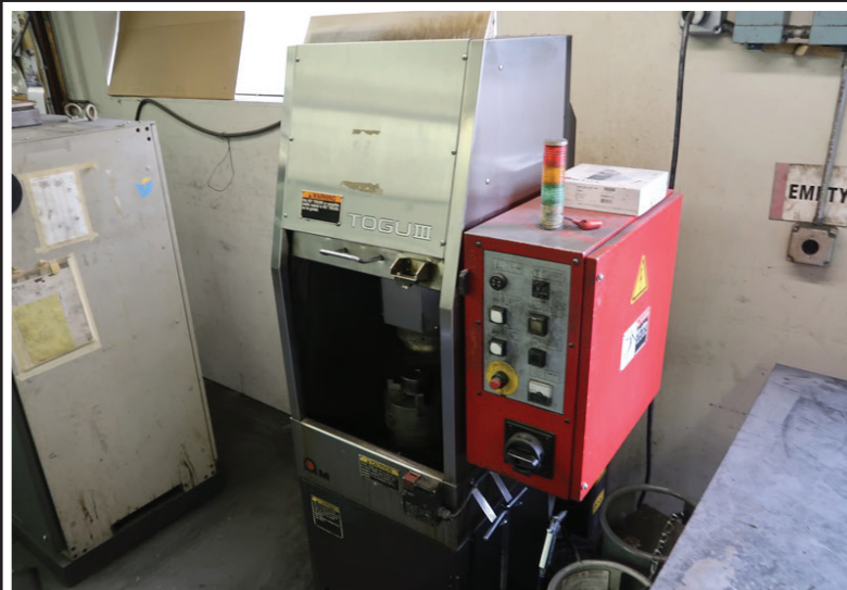
AMADA TOGU III AUTOMATIC TOOL GRINDER

James G. Murphy Co. Commercial & Industrial Auctioneers