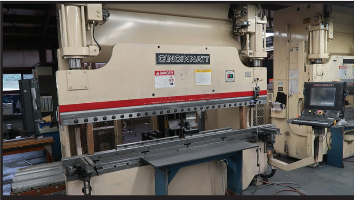
CINCINNATI AUTOFORM 90-TON HYDRAULIC PRESS BREAK

14400 NE North Woodinville Way, Woodinville, WA 98072