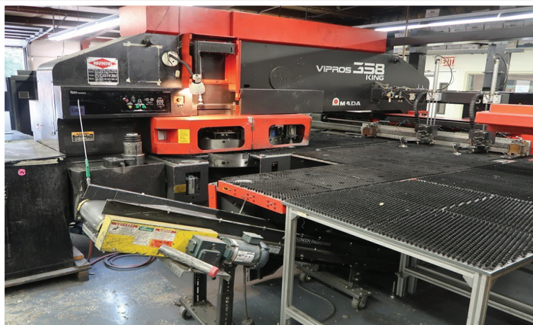
1996 AMADA VIPROS 358K 30-TON TURRET PUNCH

LIVE ONLINE BIDDING AVAILABLE AT MURPHYAUCTION.COM