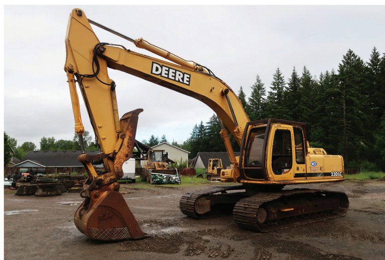
1998 JOHN DEERE 230LC