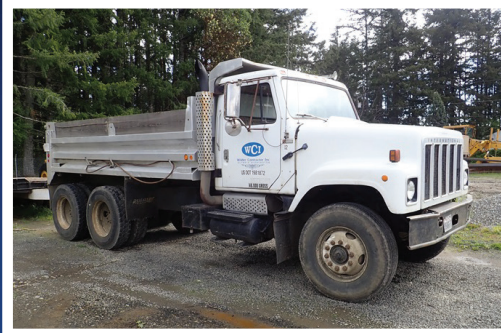
1979 INTERNATIONAL F2574