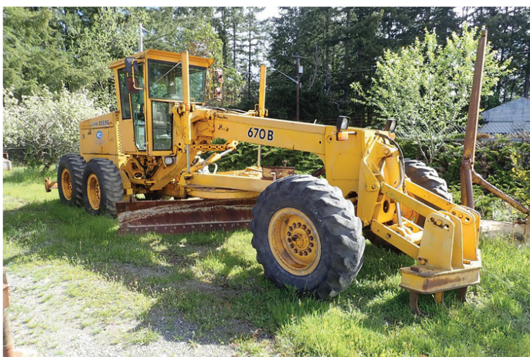
1986 JOHN DEERE 670B