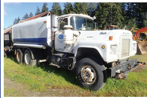
1972 MACK RL785LST

1992 JOHN DEERE 510D 4X4 LOADER BACKHOE, BUCKET, CANOPY, HOE BUCKET, HOUR METER READS: 8,711, S/N: T0510DG783095