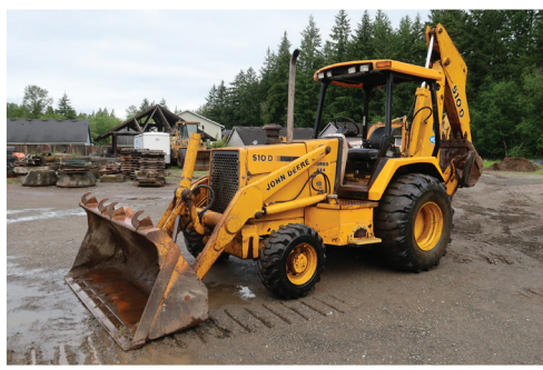
1992 JOHN DEERE 510D