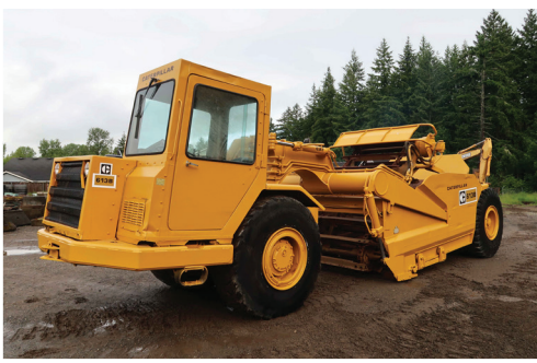
1980 CAT 613B