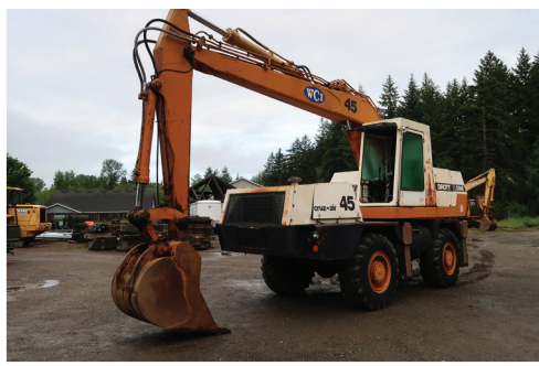
1983 CASE DROTT CRUZ AIR 45B