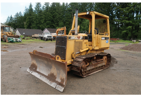
1995 JOHN DEERE 450G SERIES IV