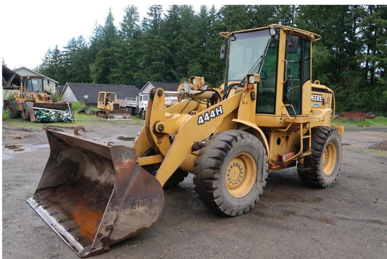
1998 JOHN DEERE 444H