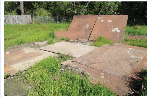
ASSORTED STEEL ROAD PLATES