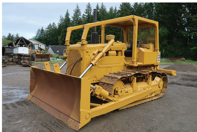
1979 CAT D6D