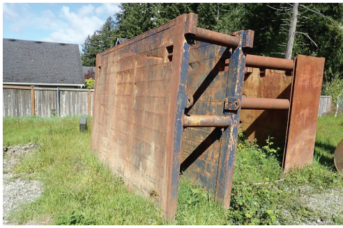
ASSORTED TRENCH BOXES