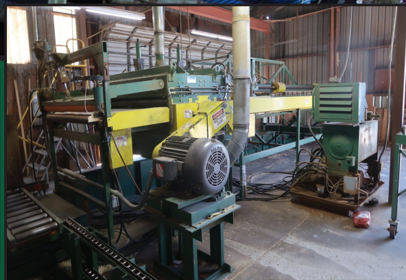
2006 MID OREGON PS-60LHZ