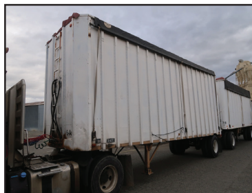
(5) WALKING FLOOR TRAILERS