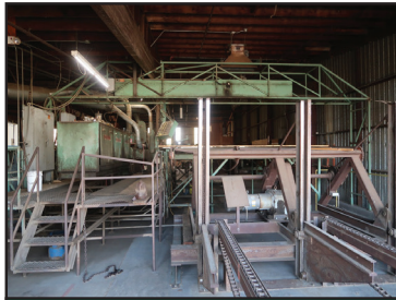
PORTLAND IRON WORKS