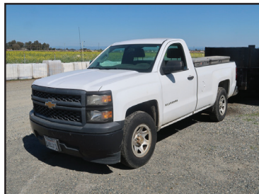
2015 CHEV SILVERADO

STRICK 24' T/A 14-UNIT WALKING FLOOR TRAILER, BARN DOORS, TARP, 11R22.5 TIRES, S/N: C124432 1986 ANJI 24' T/A 14-UNIT WALKING FLOOR TRAILER, BARN DOORS, TARP, 11R22.5 TIRES, S/N: 1A9W02916G1051268 1986 ANJI 28' S/A WALKING FLOOR CHIP TRAILER, S/N:1A9W02914G1051270 STRICK 28' S/A WALKING FLOOR CHIP TRAILER, S/N: C124311 1974 STRICK 24' T/A 14-UNIT WALKING FLOOR TRAILER, BARN DOORS, TARP, 11R22.5 TIRES, S/N: 183968 1981 ALLOY ATB-30P 30' S/A 11-1/2-UNIT POSSUM BELLY CHIP TRAILER, 11R22.5 TIRES, S/N: 1ALSC6188BS081312 1981 ALLOY 24' S/A POSSUM BELLY CHIP TRAILER, 11R22.5 TIRES, S/N: 1ALSC6180BS081313 (2) 1967 PEERLESS 28' S/A 11.1-UNIT POSSUM BELLY CHIP TRAILERS, 11R22.5 TIRES, S/N: 677111 & 677112 (4) 1973 PEERLESS 28' S/A 11.3-UNIT POSSUM BELLY CHIP TRAILERS, 11R22.5 TIRES, S/N: 725159, 725157, 725156 & 725158 (2) 28' S/A 11-UNIT CHIP TRAILERS, 11R22.5 TIRES 2004 UTILITY 48' T/A FLATBED ALUMINUM TRAILER, 11R22.5 TIRES, S/N: 1UYFS24844A315501 (2) 24' S/A FLATBED TRAILERS, 11R22.5 TIRES (5) TRAILER DOLLIES 2001 FOREST RIVER SIERRA 22' T/A TRAVEL TRAILER