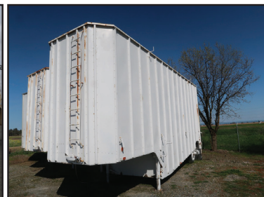
(5) CHIP TRAILERS